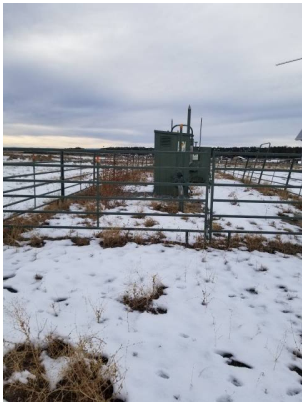
Completed work description Completed work description of corrective action 4 Additional photos

removed weed debris from around equipment