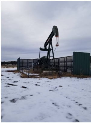
Completed work description of corrective action 3 Photo of fourth corrective action completed

removed weed debris from around equipment