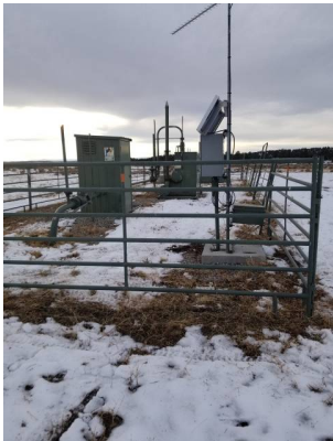
Completed work description Summary of all work completed

removed weed debris from around equipment removed weed debris from around equipment