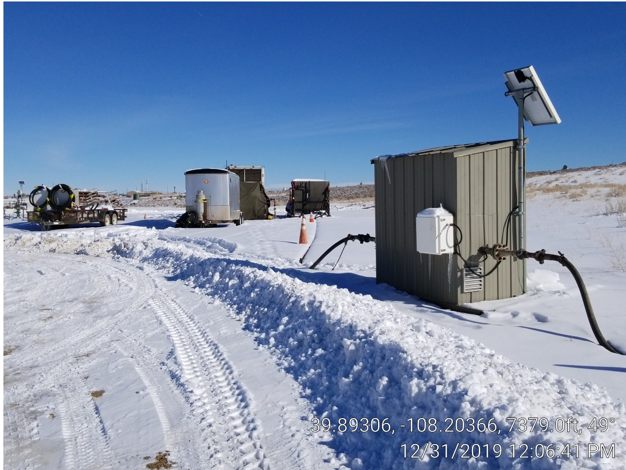
Photo 5. Equipment on trailers.