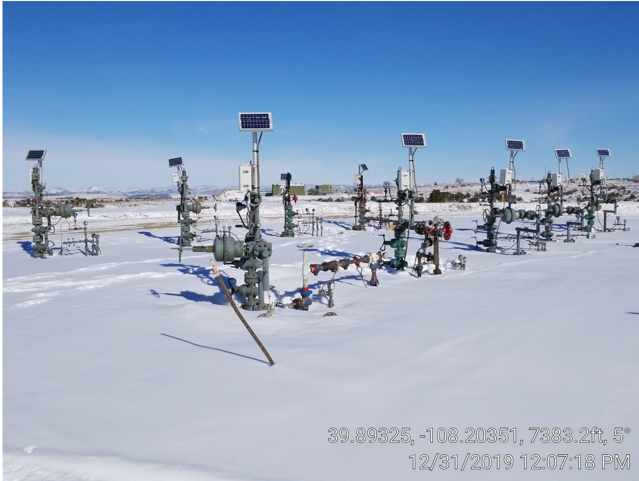
Photo 2. Well heads.