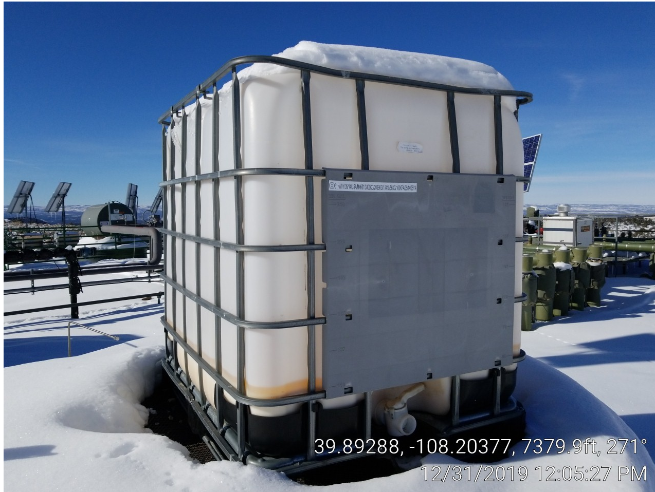
Photo 6. Container without label.