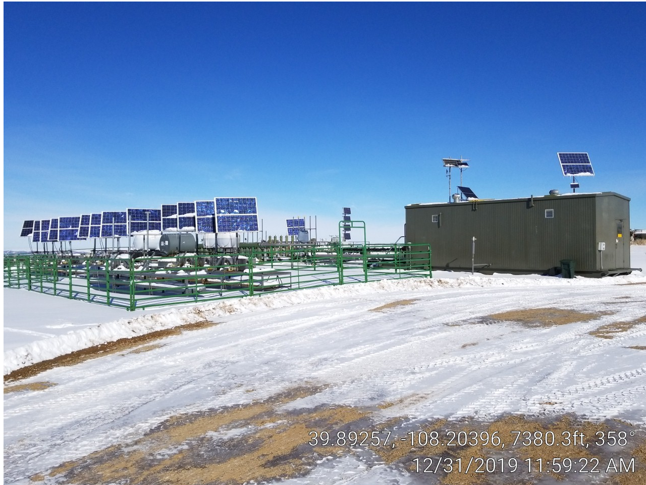
Photo 3. Chemical & building.