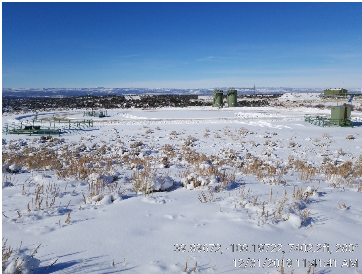
Photo 1. Location.