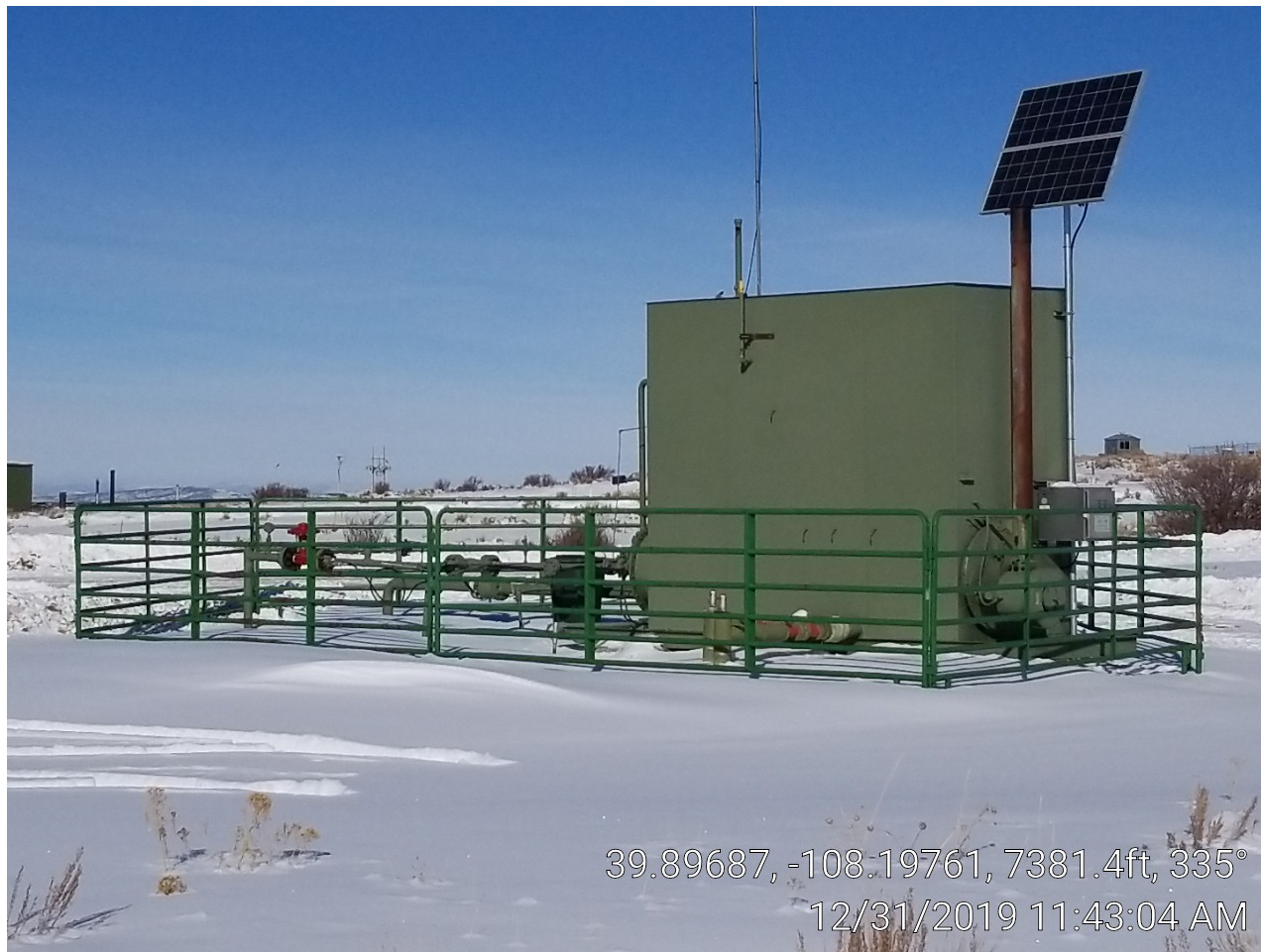
Photo 3. Separator.