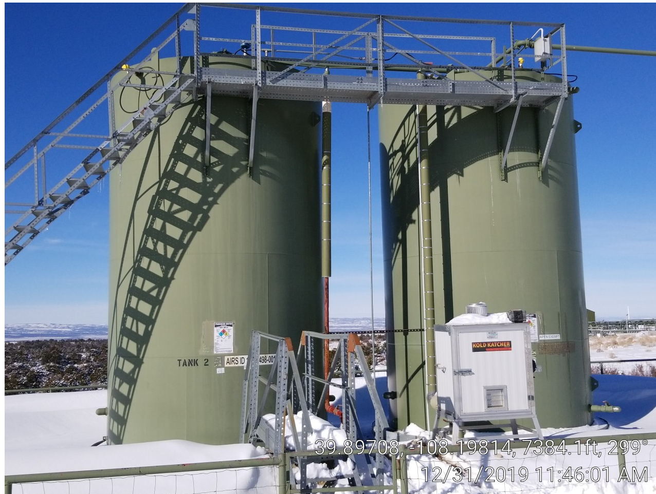
Photo 4. Tanks.