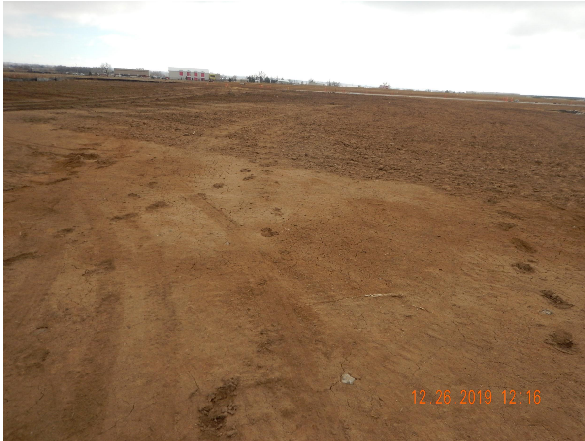
Photo 9. Photo taken from the southern location, facing South. Operator indicated this is where topsoil was stored; however, there is no indication that additional soil is present (e.g., no stockpile and southern area appears to be similar in contour as its surrounding area).