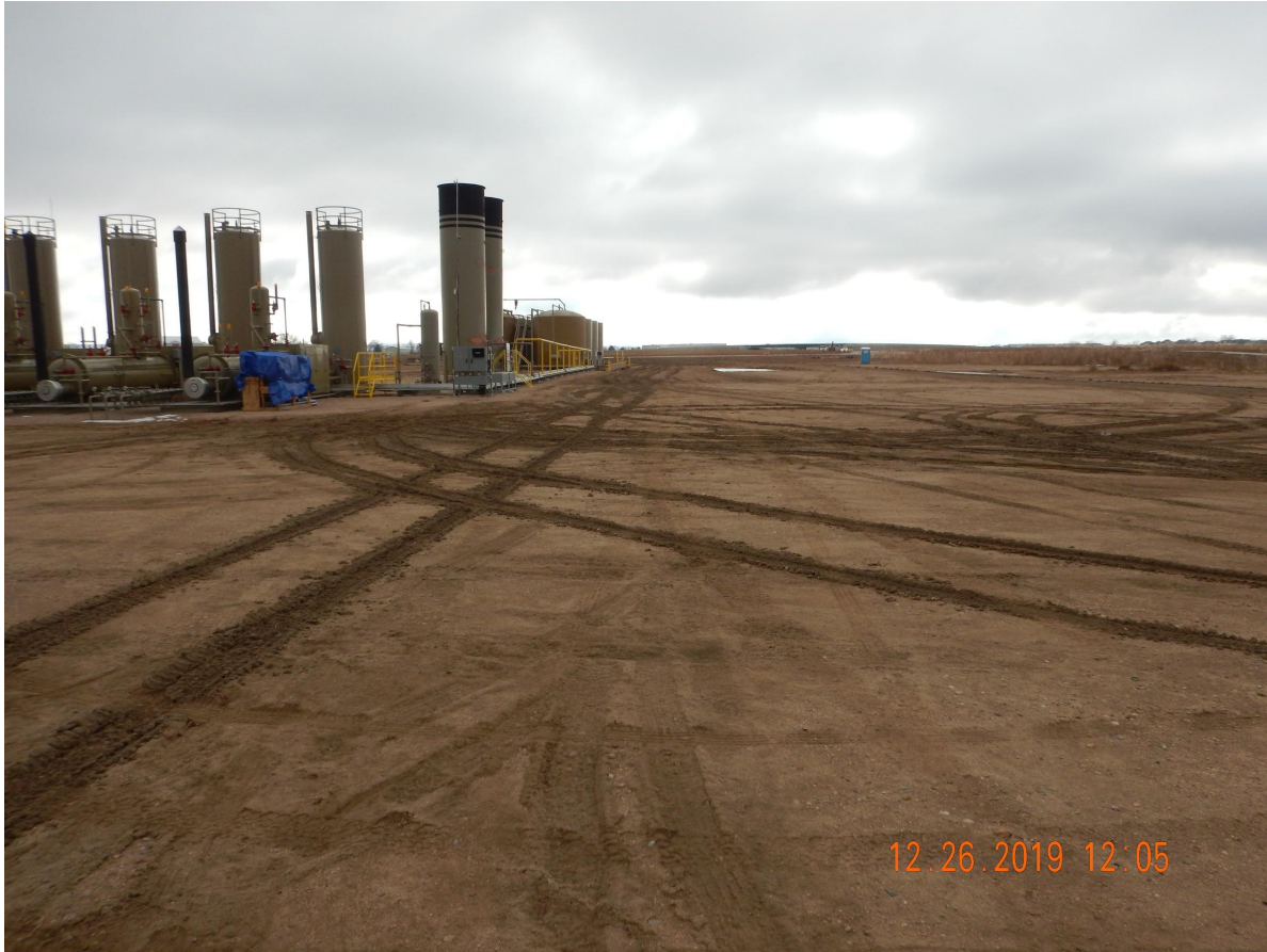
Photo 1. Photo taken from the central location, facing South. Photo illustrates the production facility. At the time of this inspection, soil conditions were frozen. Note: Per Rule 1002.f.(2).F., locations shall control potential sediment discharges from operational roads, well pads, and other unpaved surfaces. Practices should include minimizing rutting.