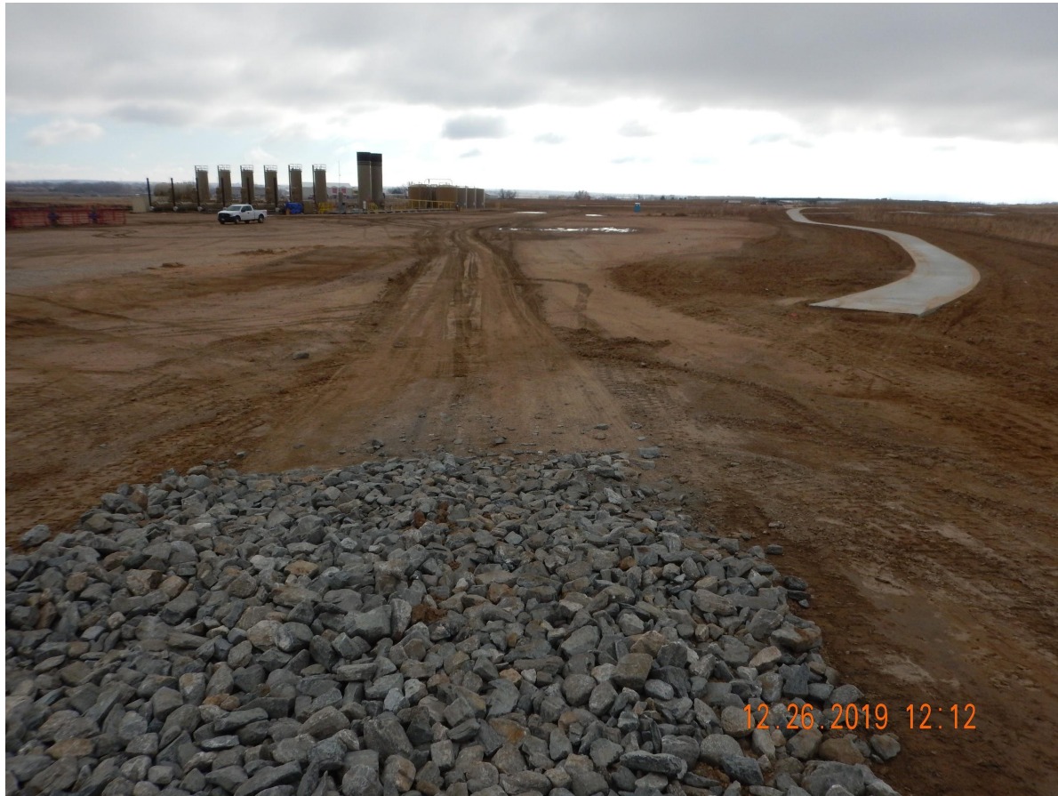
Photo 8. Photo taken from the northwestern location entrance, facing South. Photo illustrates what appears to be a sidewalk along the western portion of the location.