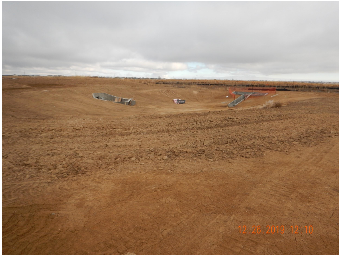
Photo 5. Photo taken from the northeastern location, facing North. Photo illustrates housing development stormwater construction underway. Note: this is not part of the location.