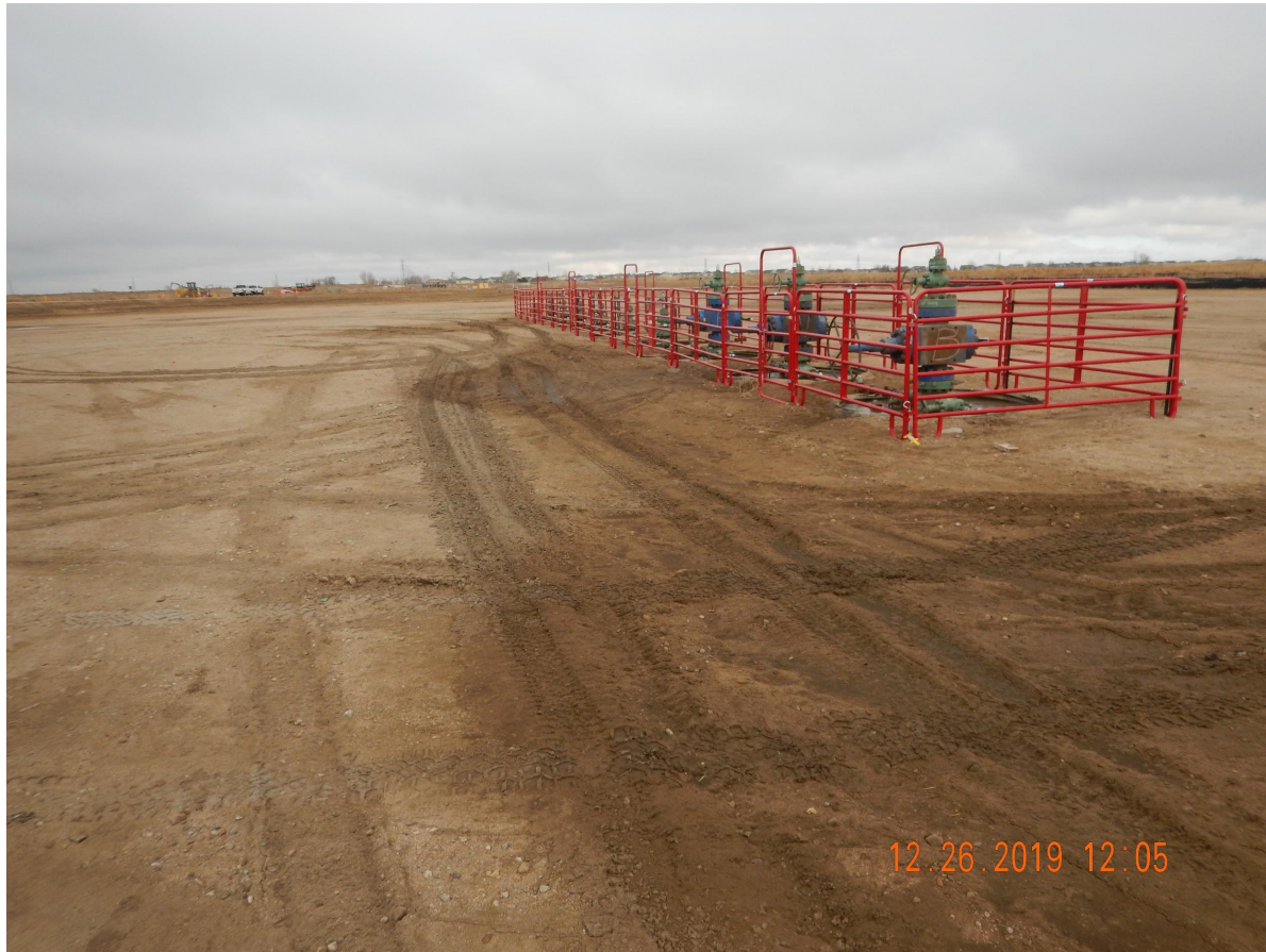
Photo 2. Photo taken from the central location, facing North. Photo illustrates the current wells. See comments under Photo 1 regarding rutting.