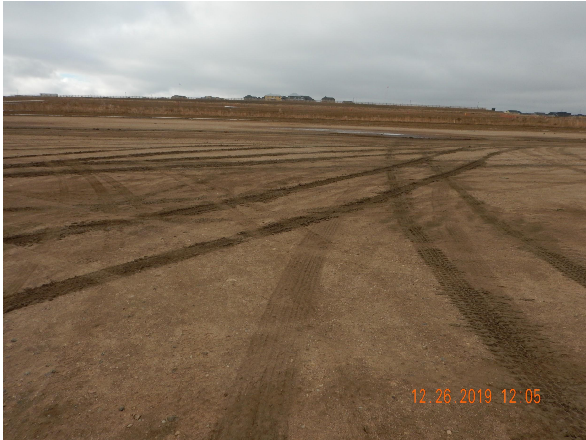
Photo 3. Photo taken from the central location, facing West. See comments under Photo 1 regarding rutting.