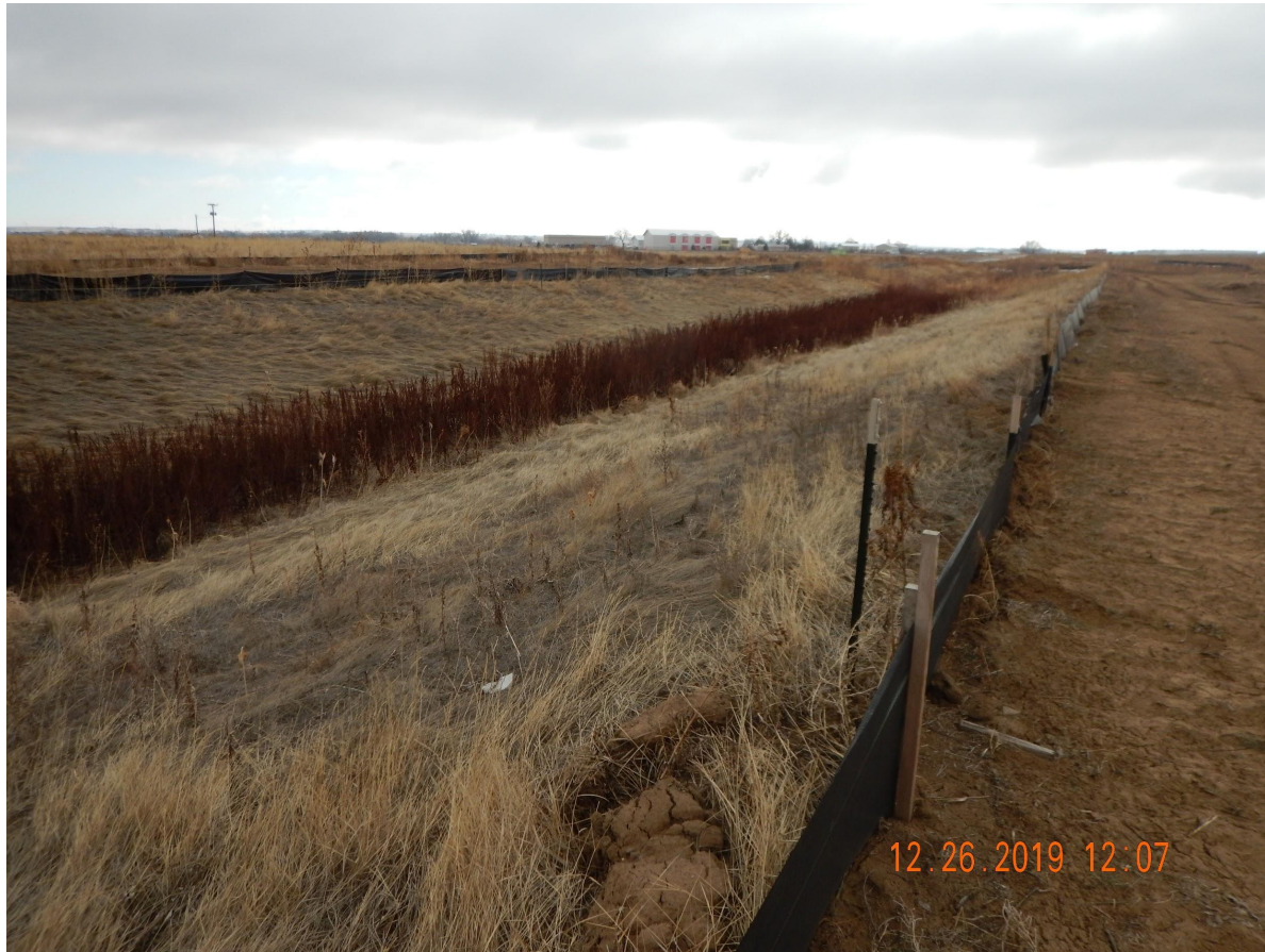
Photo 4. Photo taken from the eastern location, facing South. Photo illustrates silt fence BMP installed along the eastern down-gradient portion of the location. This ditch will be used as part of the housing development stormwater plan.