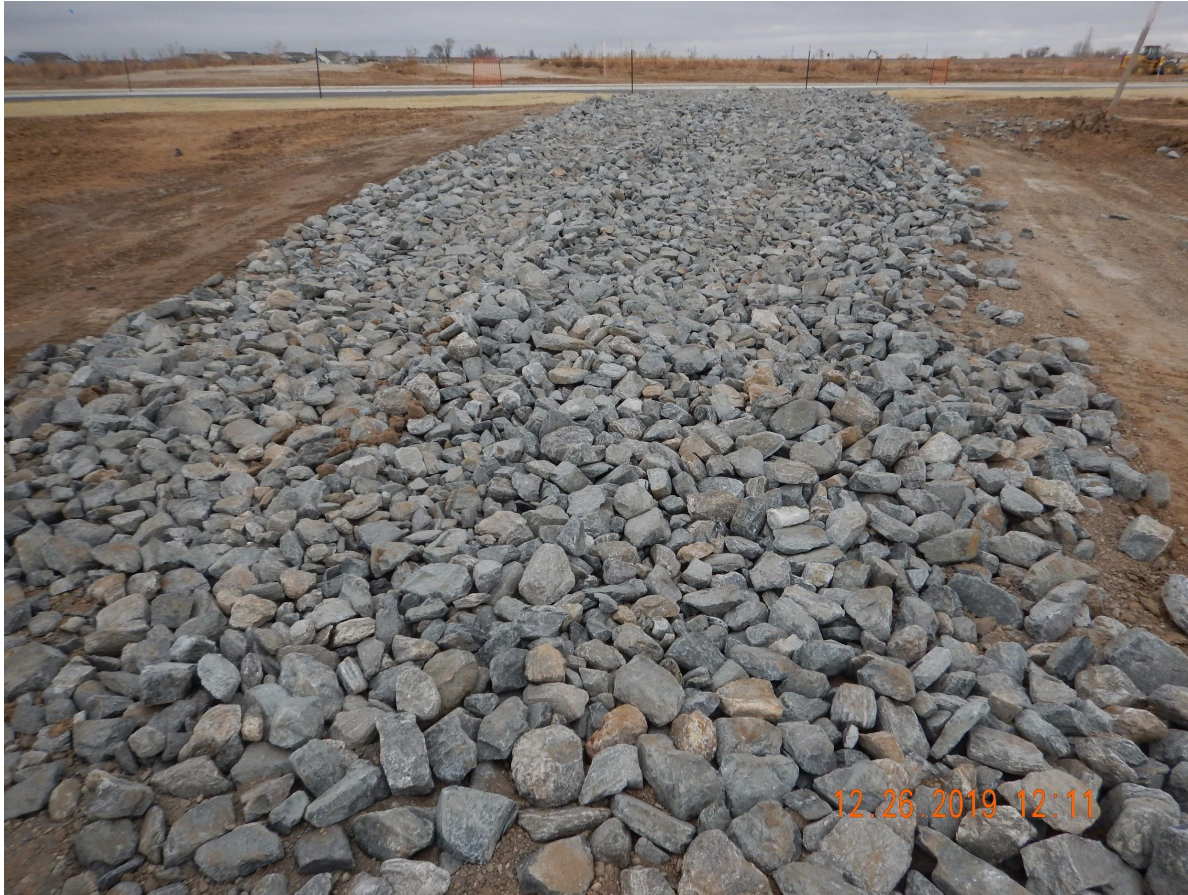
Photo 7. Photo taken from the northwestern location entrance, facing North. Photo illustrates what appears to be the temporary access point, as this is not included in the location file.