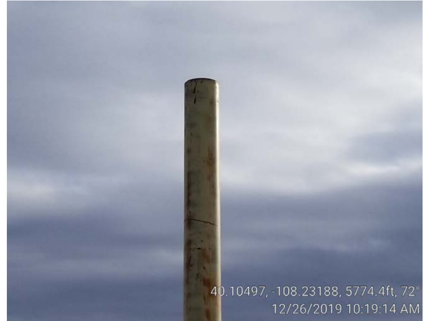
Photo 6. Cride tank stack.