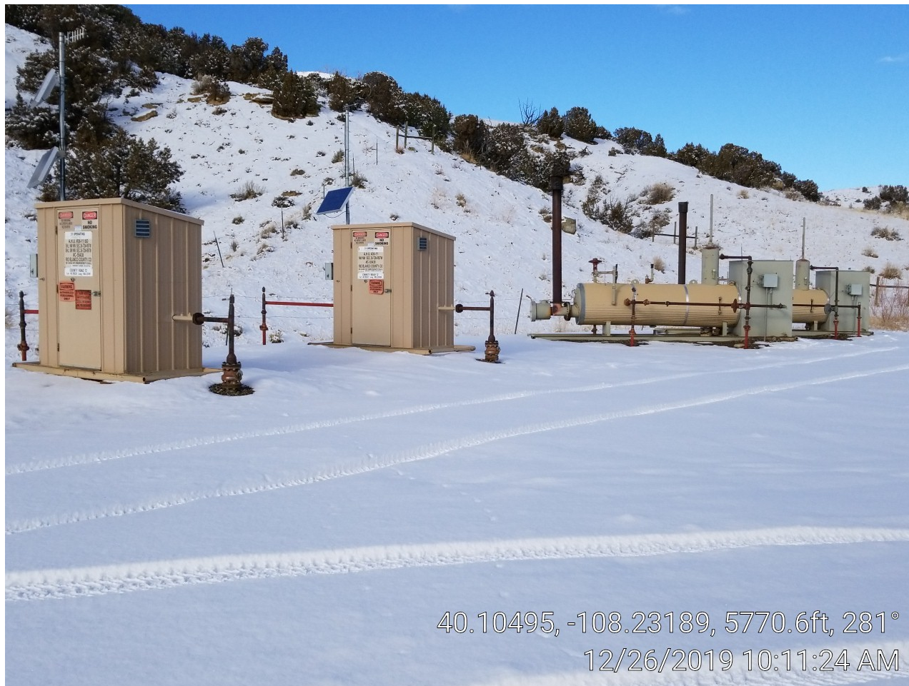
Photo 3. Meter buildings & separators.