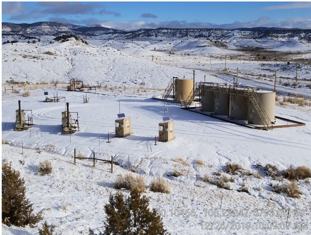
Photo 1. Location.