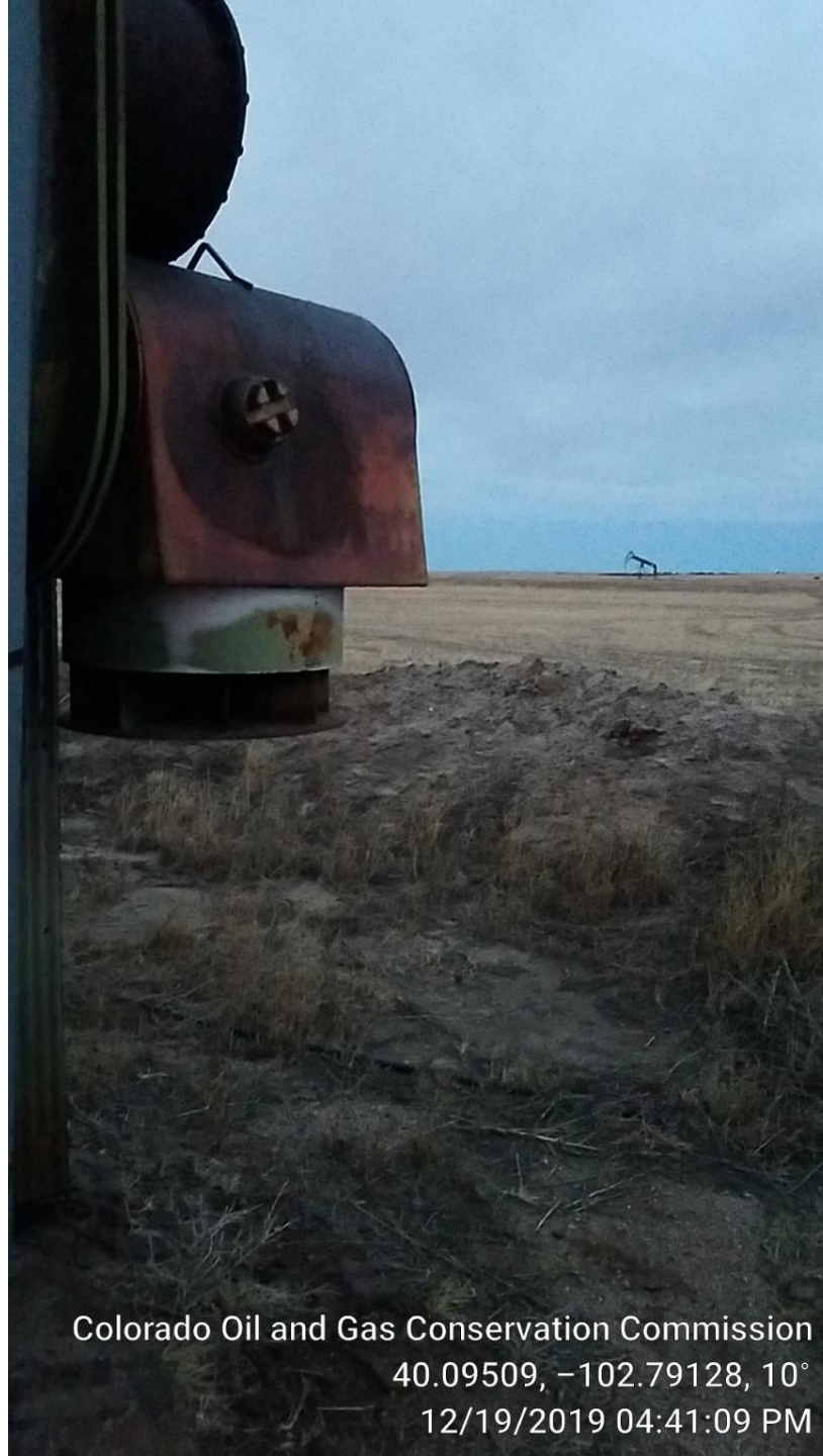
Flowline GPS at treater.

Colorado Oil and Gas Conservation Commission 40.09509, -102.79128, 10° 12/19/2019 04:41:09 PM