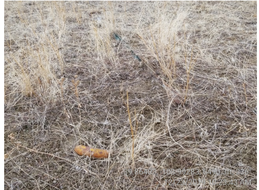
Photo 18. Fallen deadman marker.