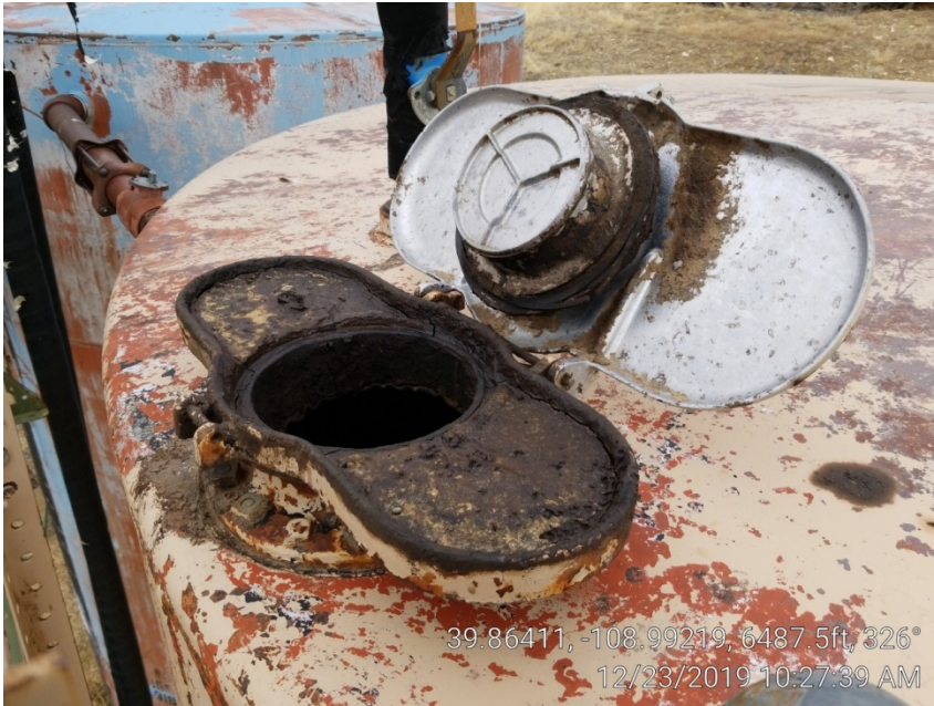
Photo 17. Tank hatch open.