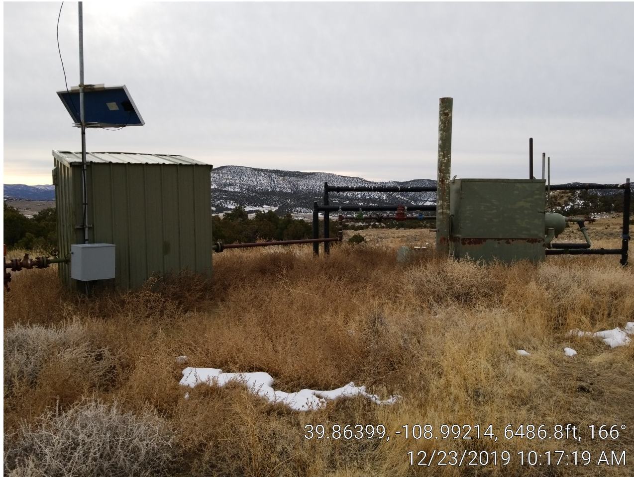
Photo 3. Meter building & separator.