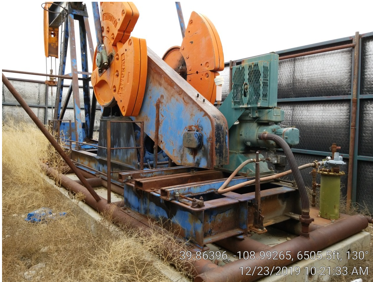
Photo 4. Pump jack.

Hells Hole 19-1 API: 05-103-10835 Inspection: 679706657