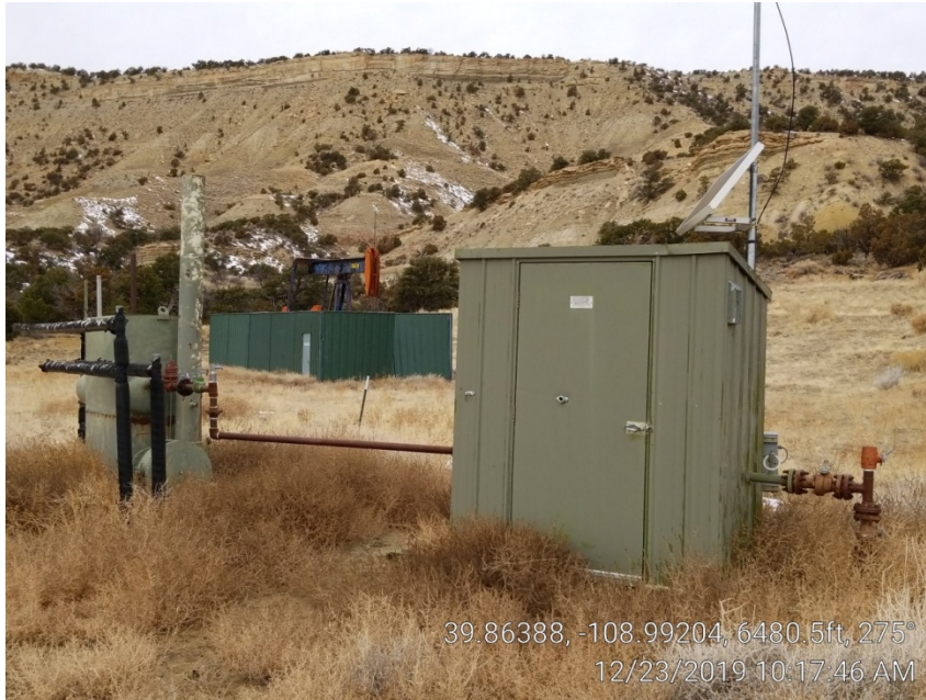
Photo 9. Weeds next to separator.