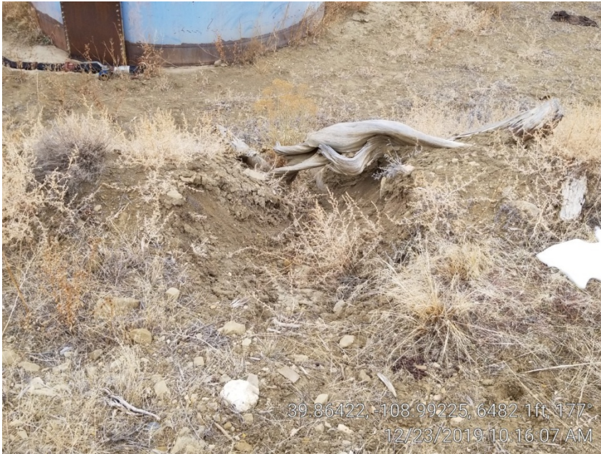
Photo 7. Erosion channel entering tank battery secondary containment.