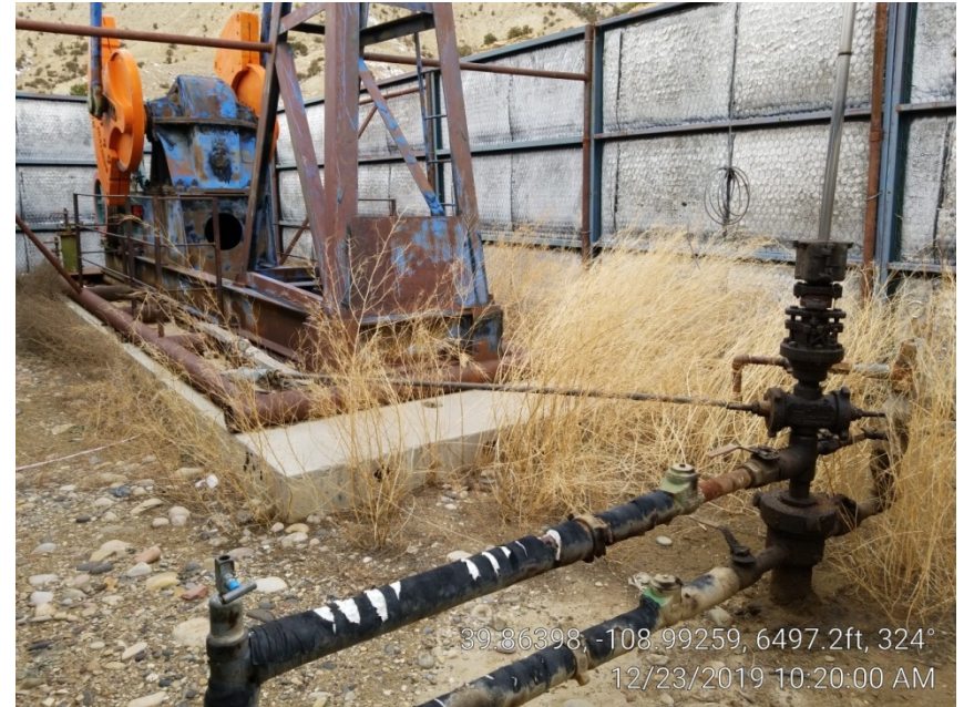
Photo 14. No well head sign.