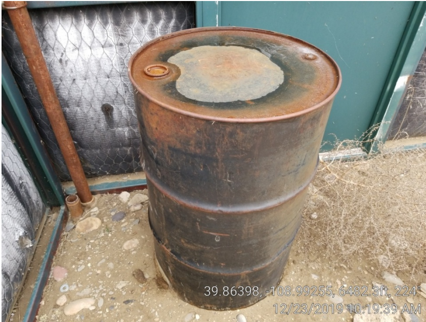
Photo 13. Unlabeled empty barrel next to pump jack.