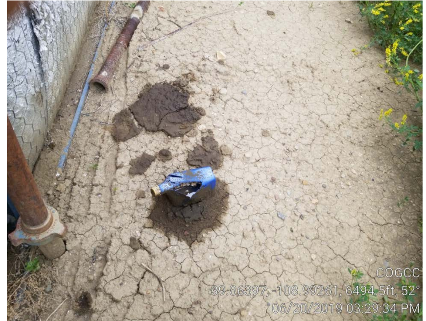
Photo 12. Oil container broken open next to pump jack.