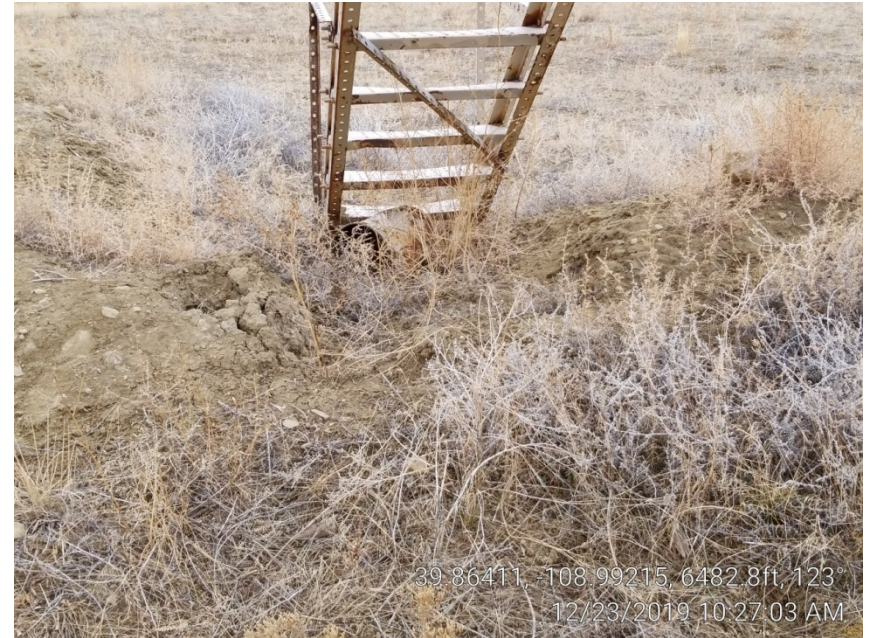
Photo 8. Erosion channel exiting tank battery secondary containment. Also weeds on berm.