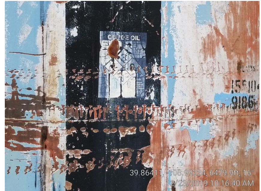
Photo 6. Tank sign.