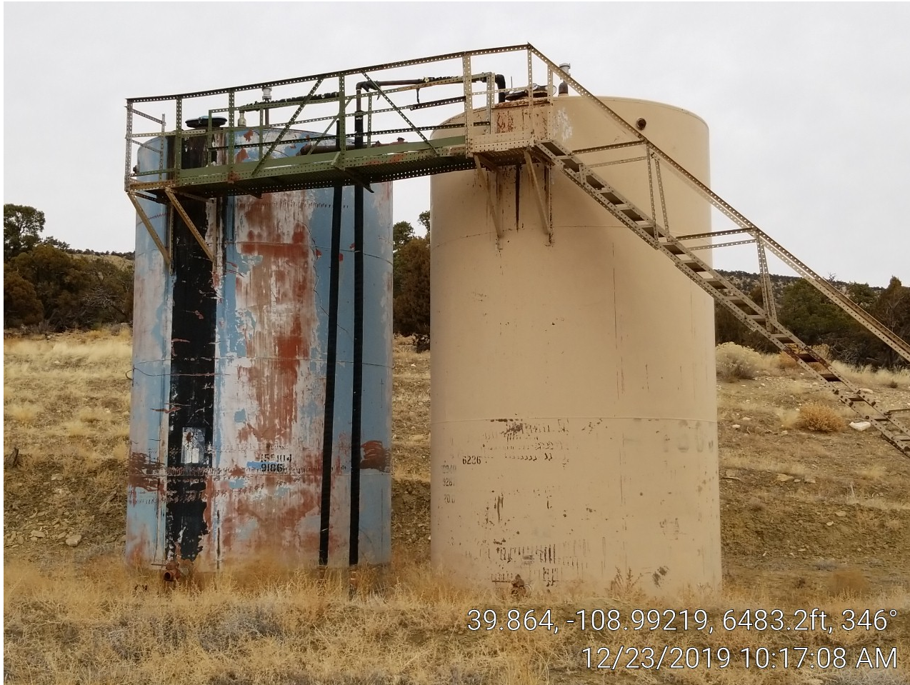
Photo 2. Tank battery.