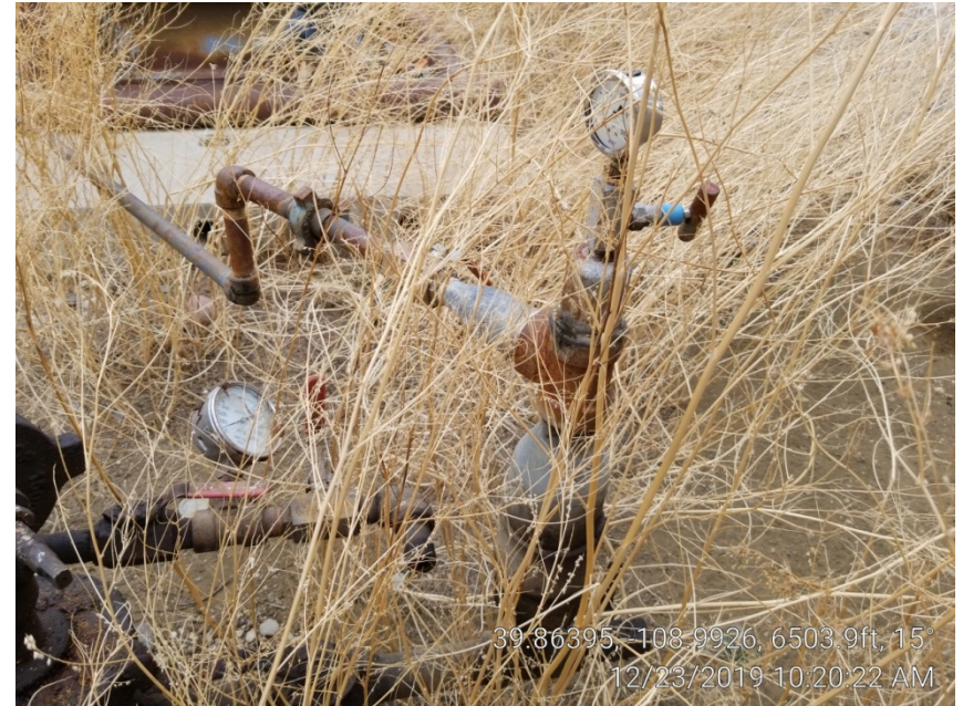
Photo 10. Weeds next to well head.