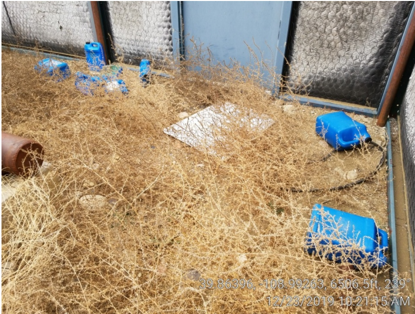
Photo 11. Oil containers next to pump jack.