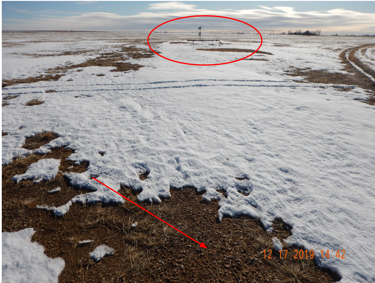
Photo 2. Photo taken from the location, facing South. Photo illustrates equipment remaining at location and appears gravel has not been removed.