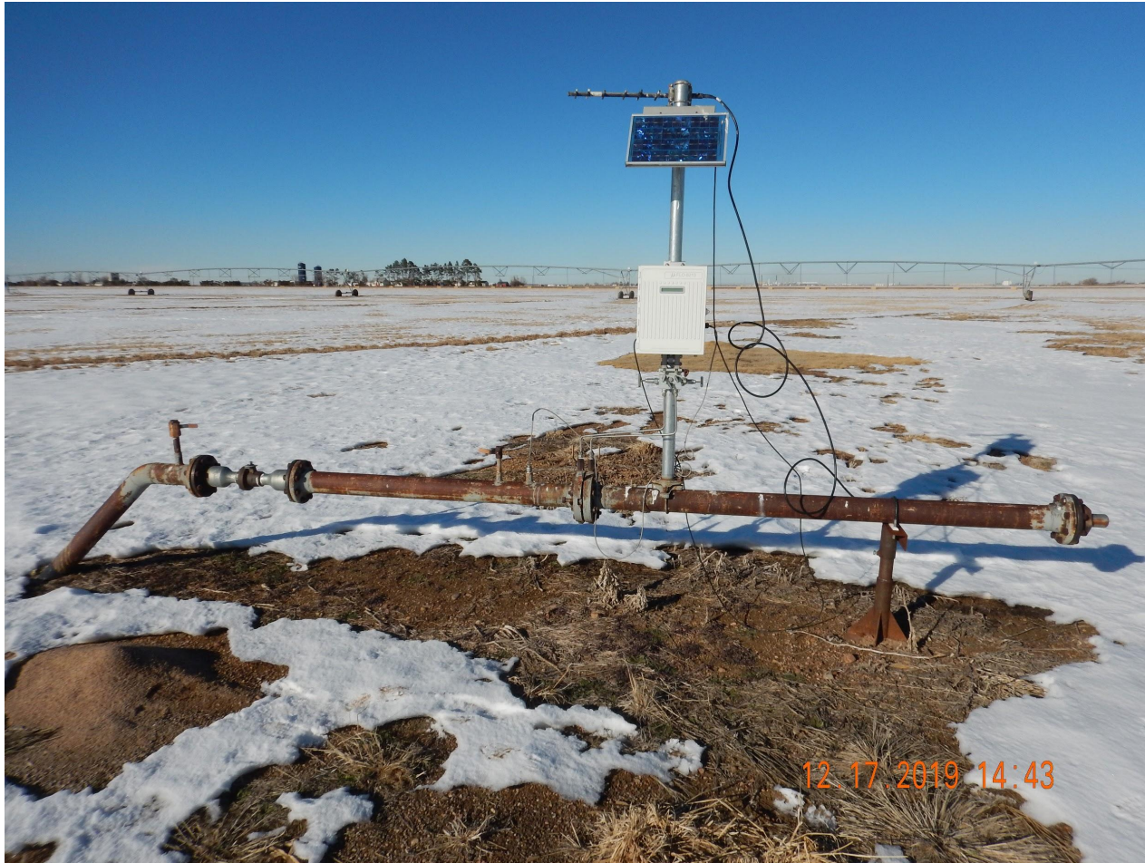
Photo 3. Photo taken from the location, facing North. Photo illustrates equipment remaining at location.