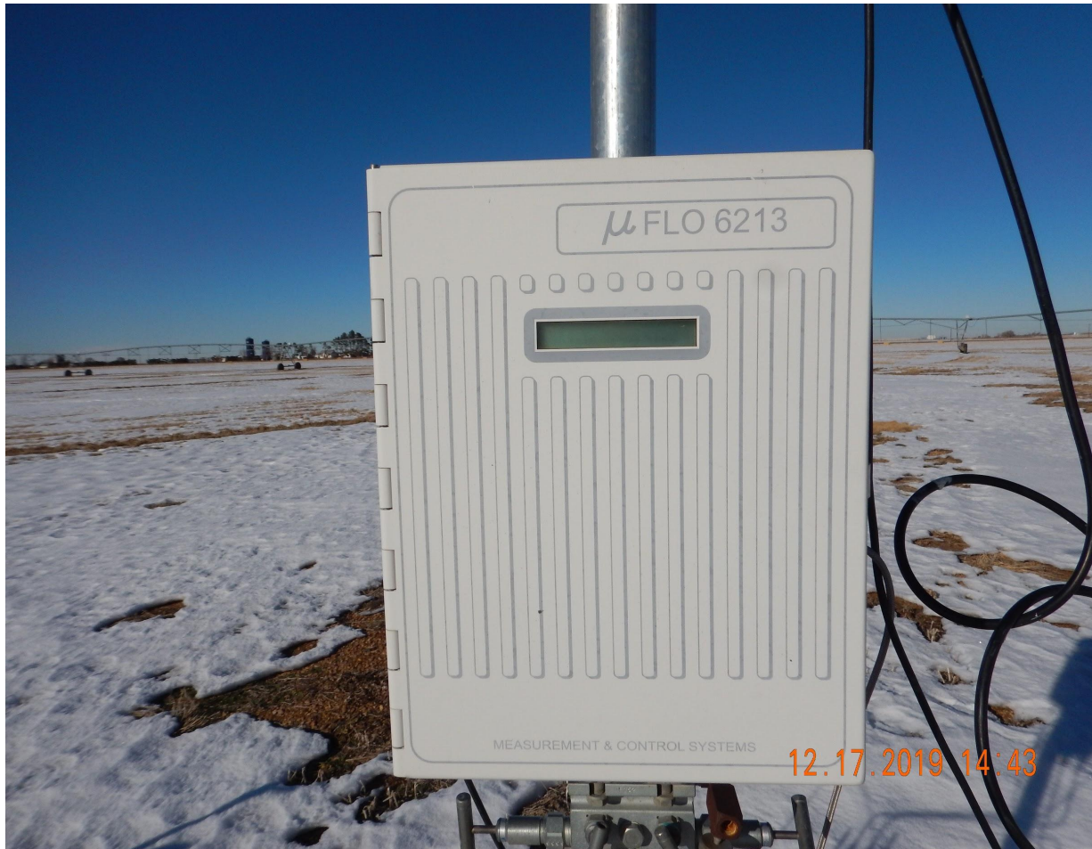
Photo 4. Photo taken of the equipment illustrating it is not in use.