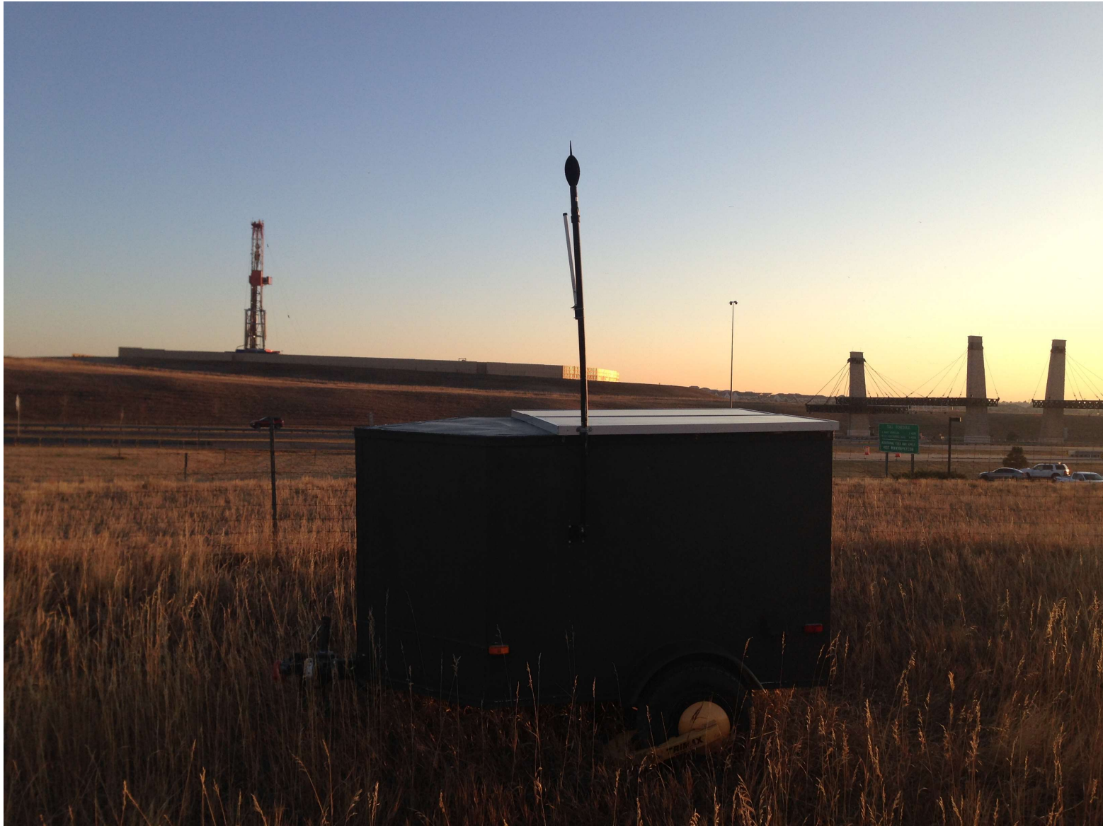
PHOTOGRAPH 1. EXTRACTION OIL & GAS – LIVINGSTON PADSITE NOISE MONITORING TERMINAL (NMT) LOCATION LIVINGSTON - NORTH NMT 502