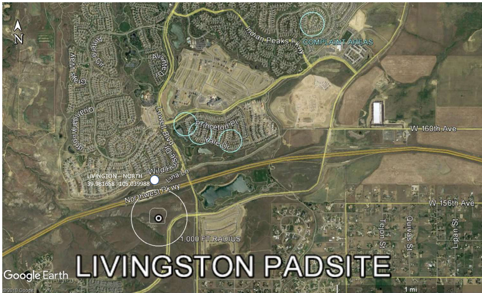
FIGURE 1. EXTRACTION OIL & GAS – LIVINGSTON PADSITE NOISE MONITORING TERMINAL (NMT) LOCATION LIVINGSTON - NORTH NMT 502