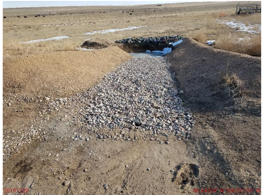
Photo 34: Photo taken from the sediment trap on the northeast corner of the location. Photo shows additional maintenance appears to have been conducted on the BMP. At time of inspection, BMP appeared to be in proper functioning condition and installed in accordance with good engineering practices.