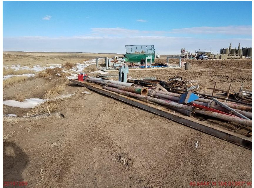
Photo 26: Photo taken from west end of the location, facing north. Photos 26-28 provide an overview of the location from north, east, to southeast.