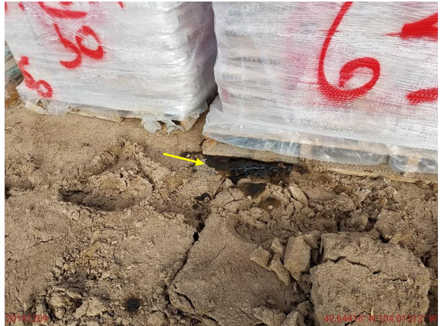
Photo 24: Photo taken from the south end of the location. Photo shows chemical spill under a material pallet.