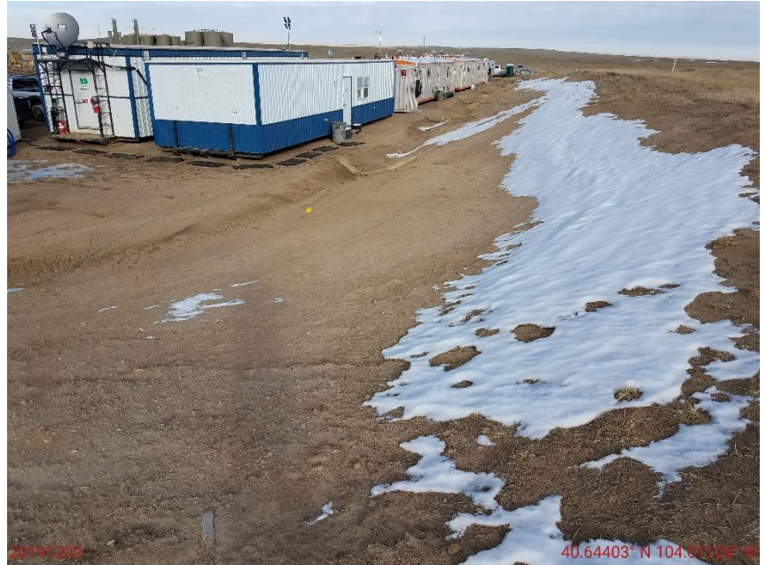
Photo 6: Photo taken from the south east end of the location, facing north. Photo shows cut slopes of location.