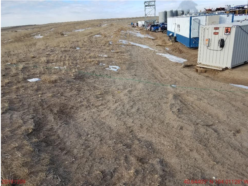
Photo 5: Photo taken from the south east end of the location, facing west. Photo shows cut slopes of location.