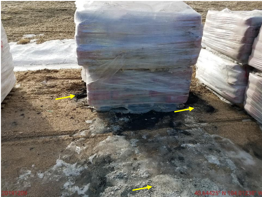
Photo 17: Photo taken from the south end of the location. Photo shows chemical/materials appear to have been spilled onto the soil surface of the pad. Material sits adjacent to the stormwater diversion ditch which transports stormwater runoff off location. It is noted that the materials observed in this photo have comingled with ice/precipitate.