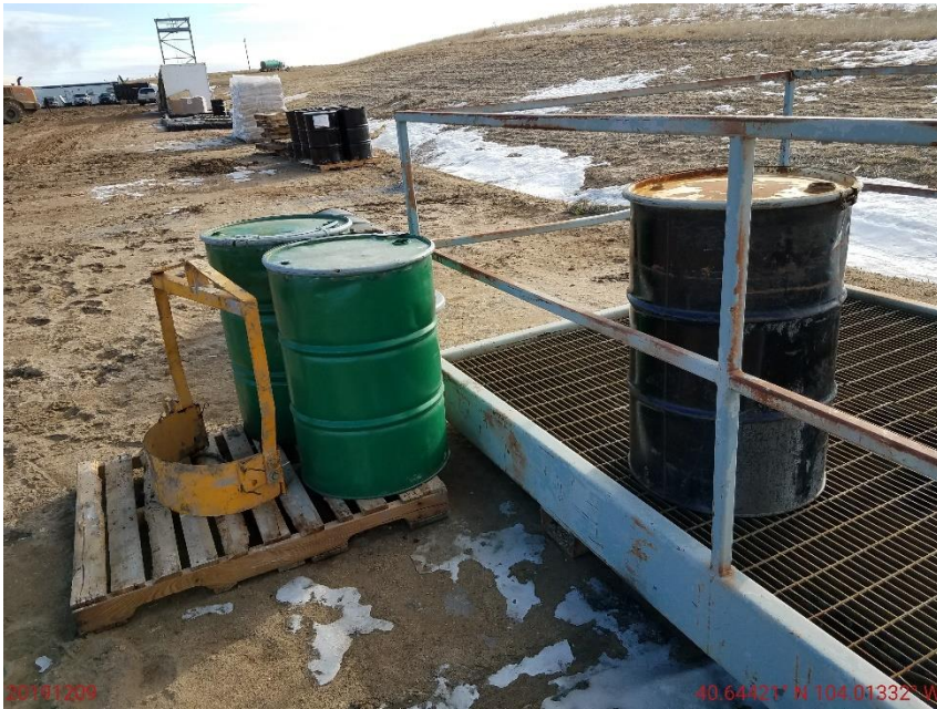
Photo 25: Photo taken from the south end of the location. Photo shows additional barrels stored on location.