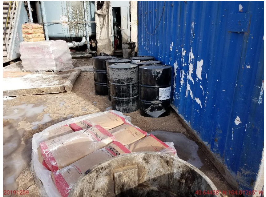
Photo 20: Photo shows six (6) chemical barrels stored without secondary containment. A seventh (7 th ) barrel was observed laying on its side on other side of barrels observed in this photo (see photo 21)