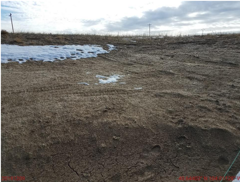
Photo 3: Photo taken from the southeast corner of the location. Photo shows area of cut-slope where erosion degradation was previously observed. Operator appears to have installed a tackifier mulch on the cut slopes. BMP appears to be degrading and is unlikely to remain sufficient to maintain slope stabilization without maintenance, or additional BMPs installed in conjunction.