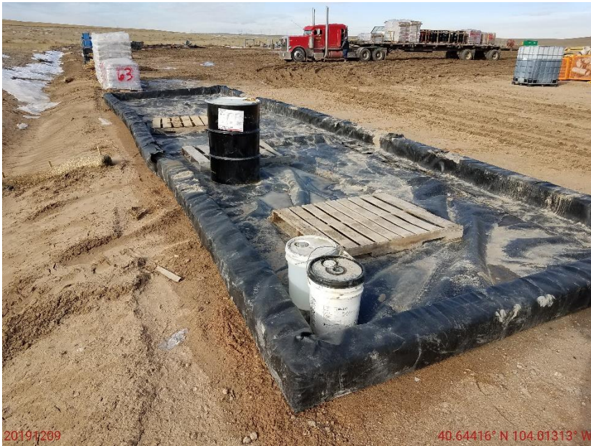
Photo 23: Photo taken from the south end of the location. Photo shows secondary containment BMP in place on location available for use.