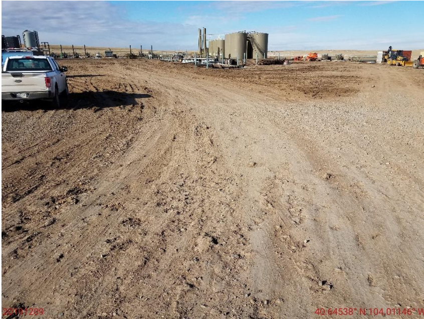
Photo 37: Photo taken from the location entrance on the east end of the location, facing west. Photo shows tracking pad. Operator has failed to maintain BMP; BMP has filled with sediment and is no longer in proper functioning condition.