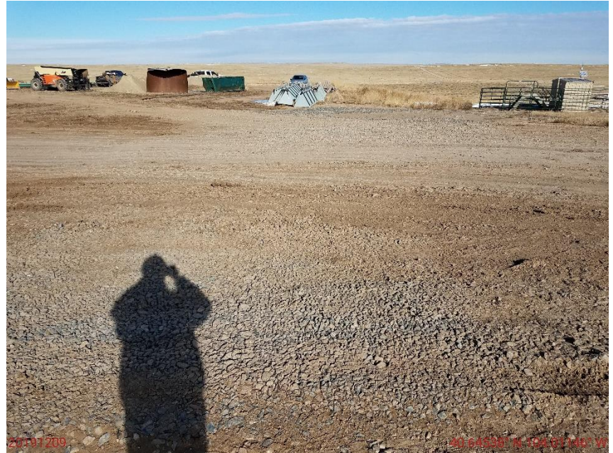
Photo 38: Photo taken from the location entrance on the north end of the location, facing west. Photo shows tracking pad. Operator has failed to maintain BMP; BMP has filled with sediment and is no longer in proper functioning condition.