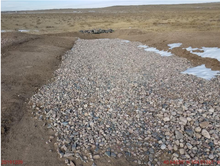
Photo 29: Photo taken from the sediment trap on the northwest corner of the location. Photo shows additional maintenance appears to have been conducted on the BMP. At time of inspection, BMP appeared to be in proper functioning condition and installed in accordance with good engineering practices.