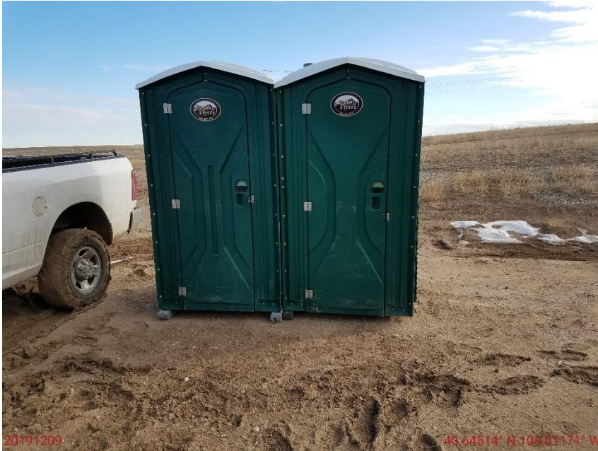
Photo 1: Photo shows porta-johns appear sufficiently secured down.