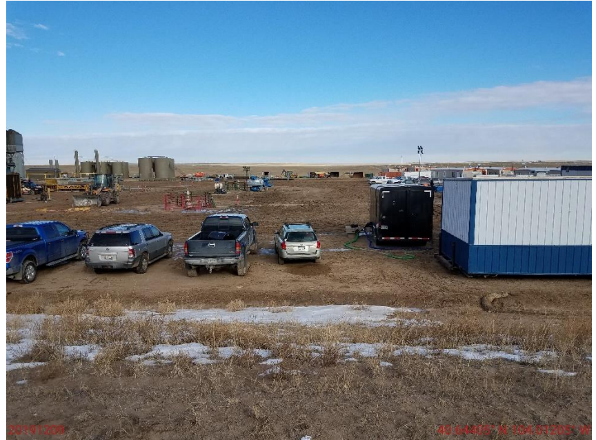
Photo 8: Photo taken from the south end of the location, facing north. See comments under photo 5.