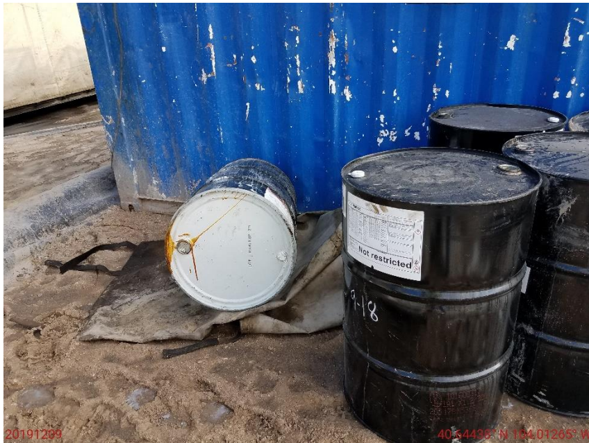
Photo 21: Continued from photo 20. Photo shows chemical barrels stored without secondary containment, with one stored on its side.