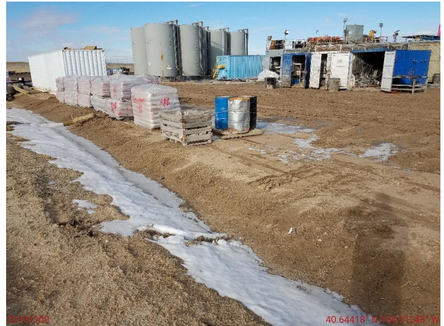
Photo 14: Photo taken from the south end of the location. Photo shows materials stored on Location. Photo also show three (3) chemical barrels stored without secondary containment.