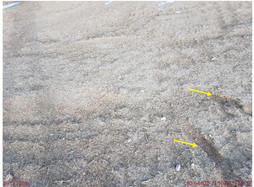
Photo 4: Continued from photo 3. Photo shows cut slopes on the southeast corner of the location. Photo shows signs that erosion degradation is beginning to recur. Tackifier appears to be degrading.