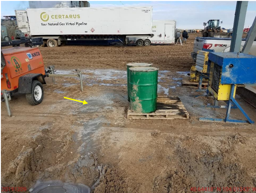
Photo 9: Photo taken from the south end of the location. Photo shows potential E&P waste spilled upon the soil surface with discharge into the perimeter stormwater diversion ditch. Outlet of ditch leads off location. It is noted that the materials observed in this photo have comingled with ice/precipitate.