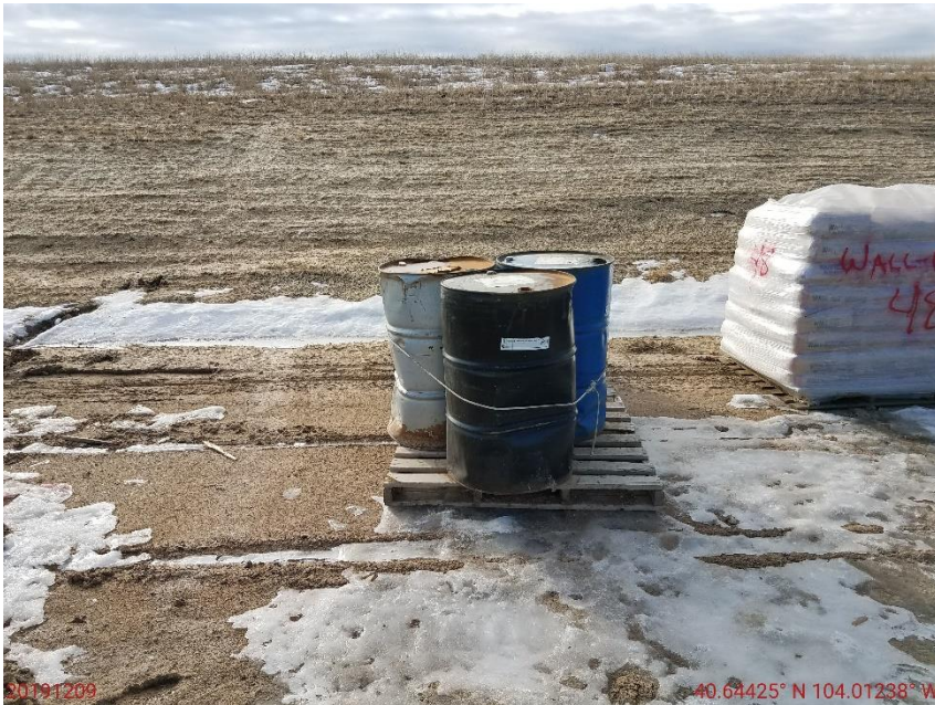
Photo 15: Continued from photo 14. Photo shows three (3) chemical barrels stored without secondary containment.