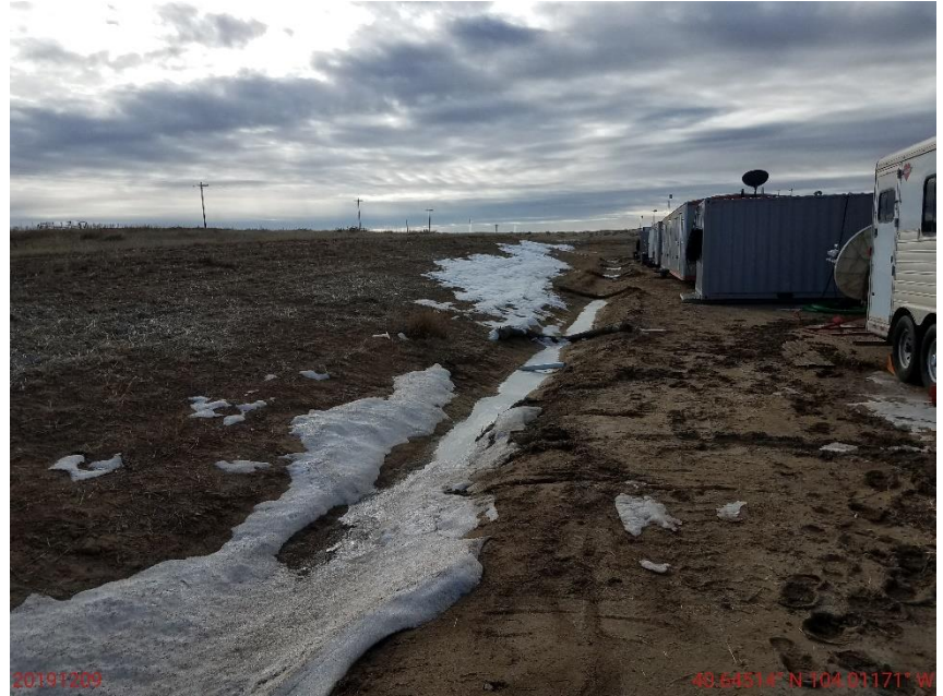
Photo 2: Photo taken from the east end of the location, facing south. Photo of perimeter stormwater diversion ditch.