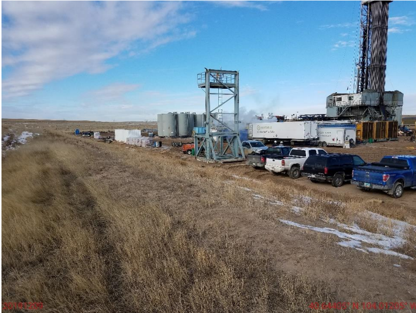
Photo 7: Photo taken from the south end of the location, facing northwest. Photo shows overview of drilling operations.