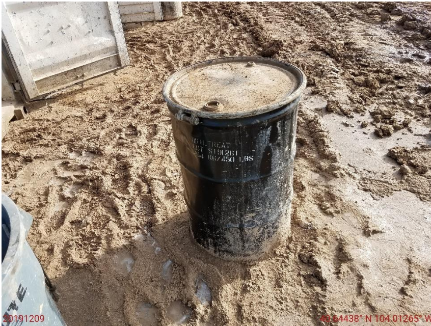
Photo 19: Photo shows barrel not stored within secondary containment. Writing on side of barrel says "Driltreat"