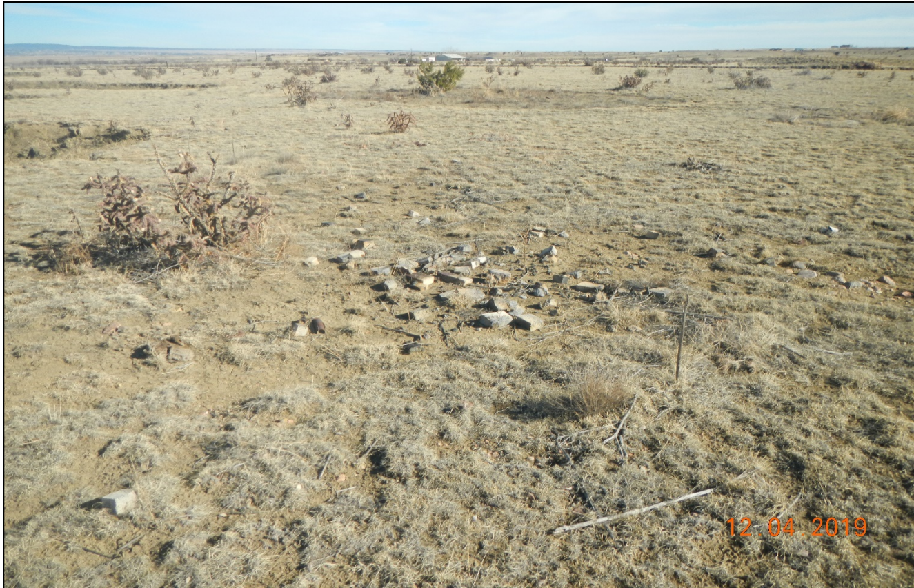
Photo 1. Facing northeast toward the location. There is a small pile of bricks that remain.