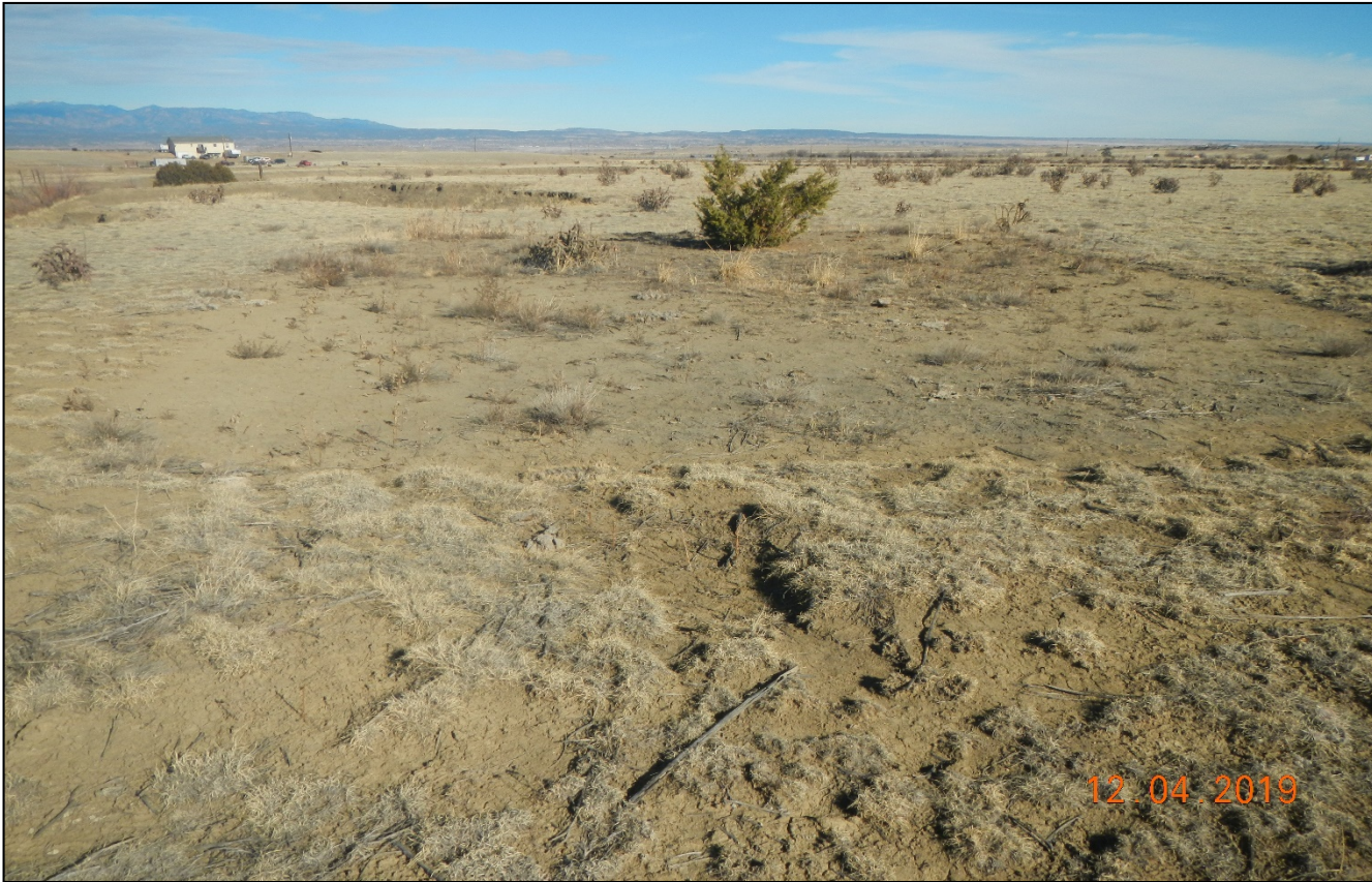
Photo 2. Facing northeast at the location. Approximately 40'x30' area which has not revegetated.