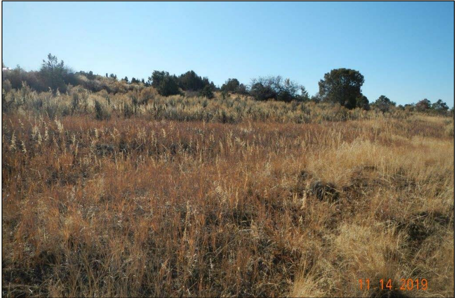
Photo 4. View of reference area, comprised of sagebrush shrubland, with grasses planted in openings.