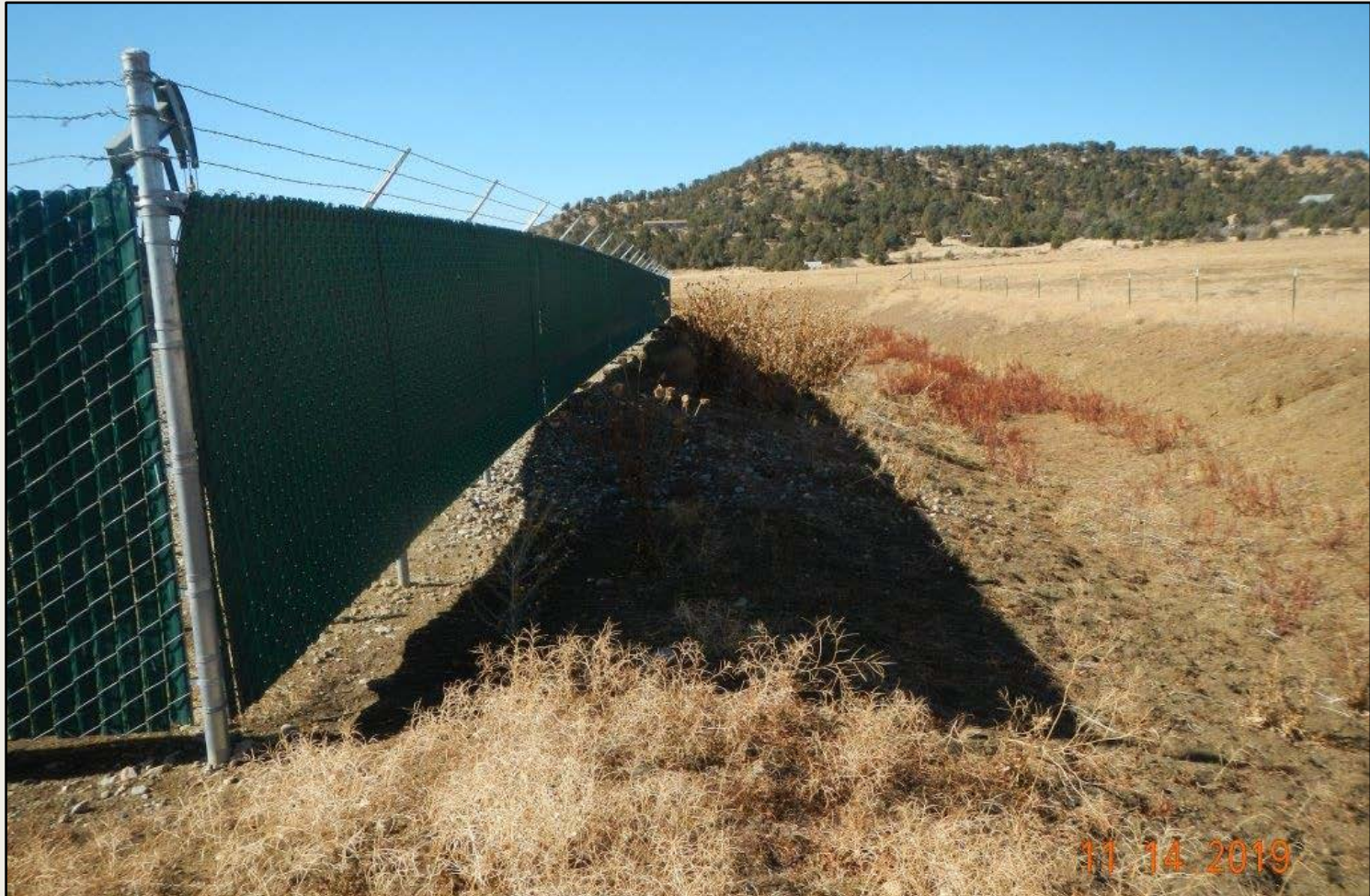
Photo 3. View of the northern project area from the northeastern corner facing westward. Area is infested with musk thistles, with little desirable vegetation present.