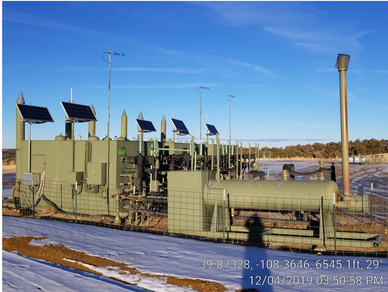
Photo 3. Separators.

RG 23-14-298 pad API: 05-103-11269, 276, 280, 770 to 780 Inspection: 679706432