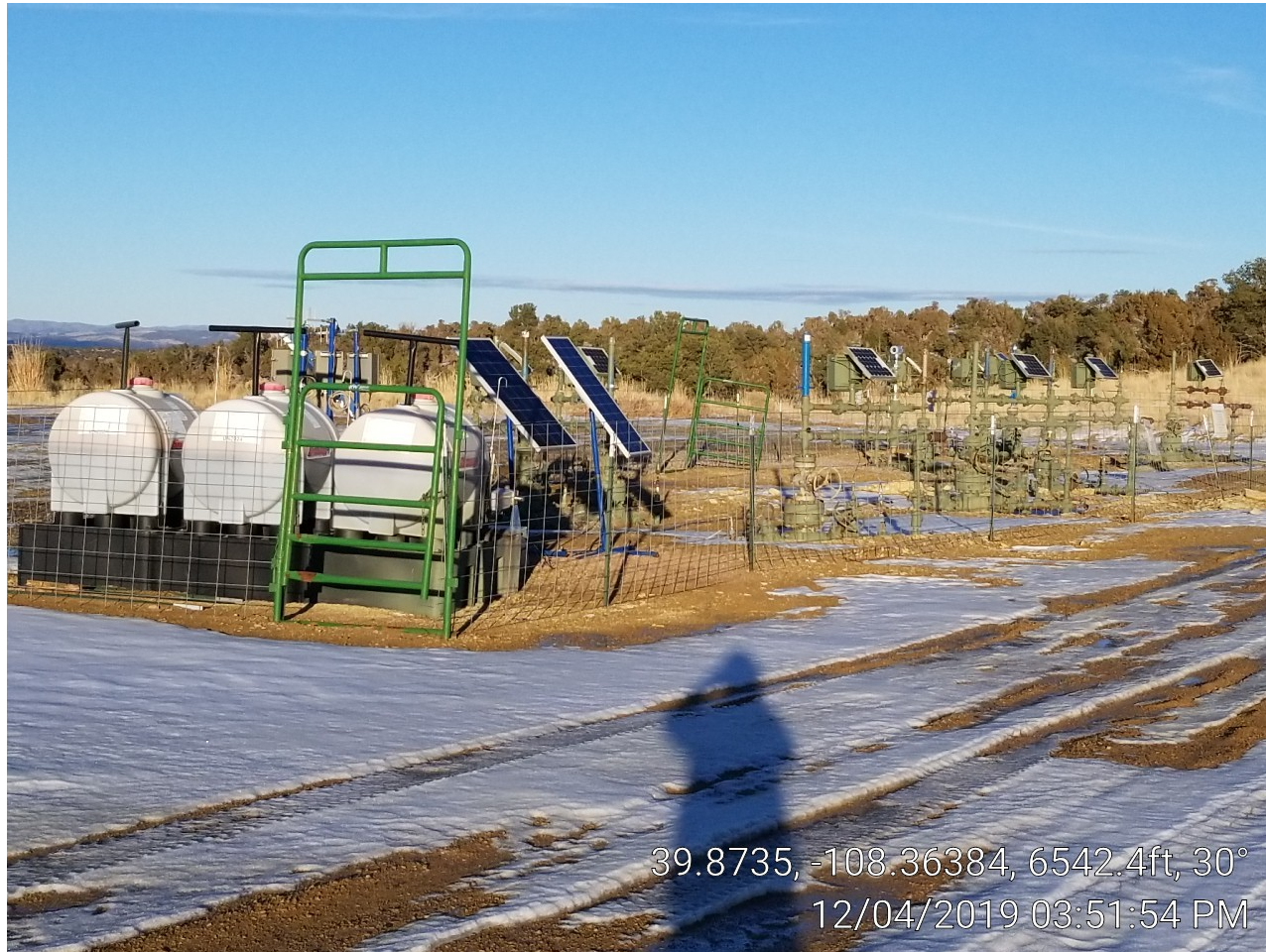
Photo 2. Well heads.

RG 23-14-298 pad API: 05-103-11269, 276, 280, 770 to 780 Inspection: 679706432