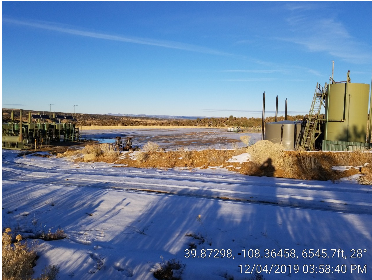
Photo 1. Location.

RG 23-14-298 pad API: 05-103-11269, 276, 280, 770 to 780 Inspection: 679706432