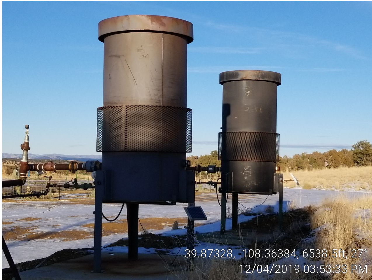
Photo 4. Burners.

RG 23-14-298 pad API: 05-103-11269, 276, 280, 770 to 780 Inspection: 679706432