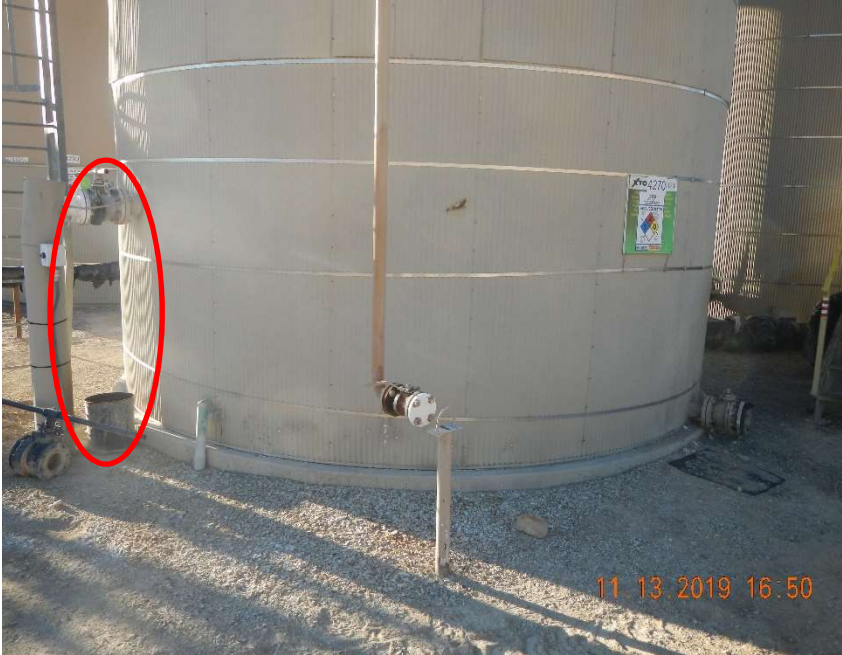
Photo #21 – View of the 5-gallon bucket underneath a valve (Red oval) on a 750 bbls Produced Water AST #4270.

Location Name: RNPU 197-15A1, Love Ranch 1 Location ID: 441601, 316151 & Spill/Release ID: 469300 Inspection Date: November 13, 2019