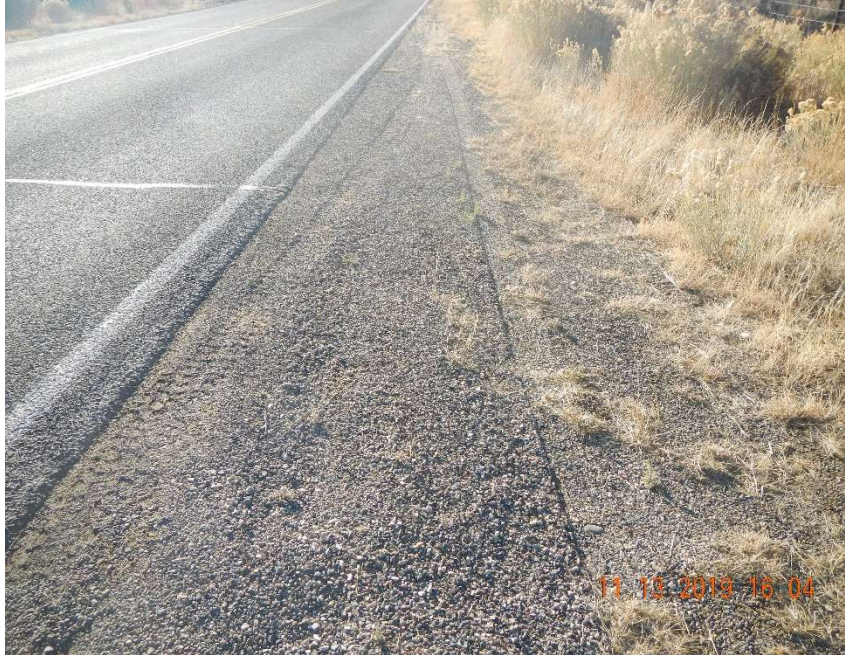
Photo #11 - View of the first pull off on County Road 5 (1.0 miles south of RNPU 197-15A1) looking south. No impacts were observed on the road or roadside.

Location Name: RNPU 197-15A1, Love Ranch 1 Location ID: 441601, 316151 & Spill/Release ID: 469300 Inspection Date: November 13, 2019