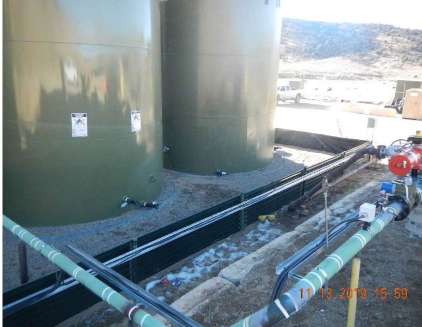
Photo #7 – View of impacted gravel located within the tank battery on the north side.

Location Name: RNPU 197-15A1, Love Ranch 1 Location ID: 441601, 316151 & Spill/Release ID: 469300 Inspection Date: November 13, 2019