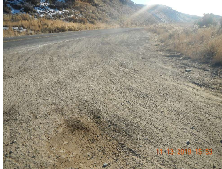
Photo #8 - View of impacted soil with a detectable odor near County Road 5 looking south.