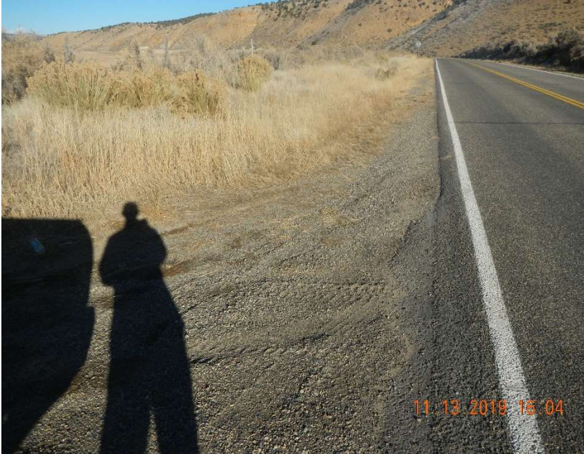
Photo #9 – View of the first pull off on County Road 5 (1.0 miles south of RNPU 197-15A1) looking north. No impacts were observed on the road or roadside.

Location Name: RNPU 197-15A1, Love Ranch 1 Location ID: 441601, 316151 & Spill/Release ID: 469300 Inspection Date: November 13, 2019