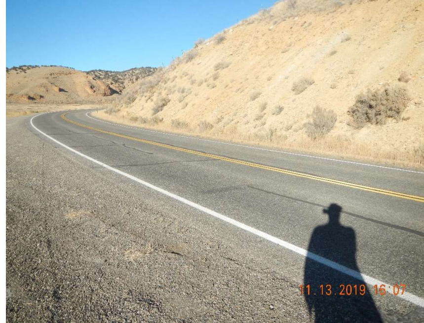
Photo #12 - View of the second pull off on County Road 5 (1.6 miles south of RNPU 197-15A1) looking north. No impacts were observed on the road or roadside.