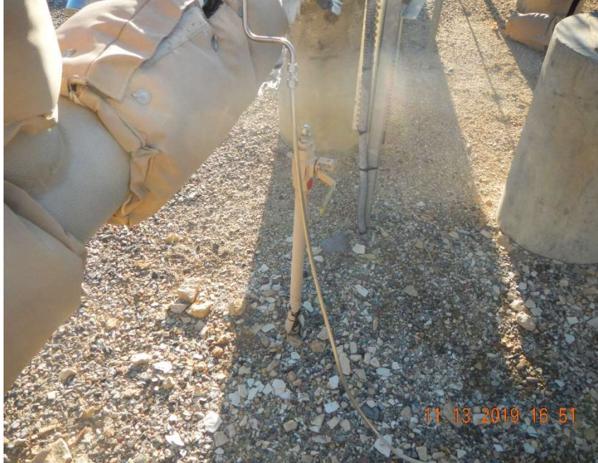
Photo #23 – View of the 1-inch riser located near the pig launcher.

Location Name: RNPU 197-15A1, Love Ranch 1 Location ID: 441601, 316151 & Spill/Release ID: 469300 Inspection Date: November 13, 2019