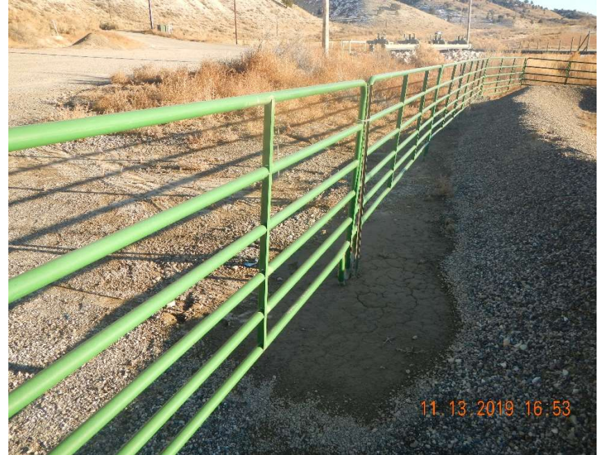
Photo #24 – View of the impacted soil and erosion rills located east of the pig launcher.