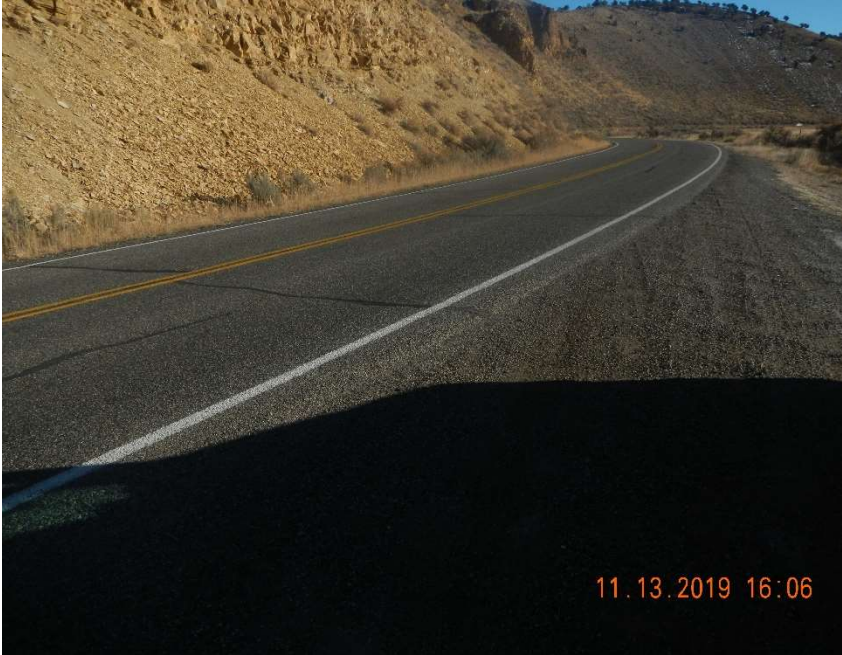
Photo #13 - View of the second pull off on County Road 5 (1.6 miles south of RNPU 197-15A1) looking south. No impacts were observed on the road or roadside.

Location Name: RNPU 197-15A1, Love Ranch 1 Location ID: 441601, 316151 & Spill/Release ID: 469300 Inspection Date: November 13, 2019