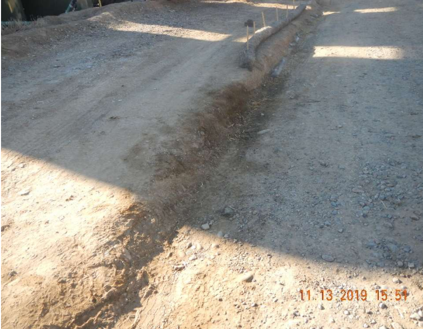
Photo #5 – View of impacted soil with a detectable odor located north of the load out area.

Location Name: RNPU 197-15A1, Love Ranch 1 Location ID: 441601, 316151 & Spill/Release ID: 469300 Inspection Date: November 13, 2019