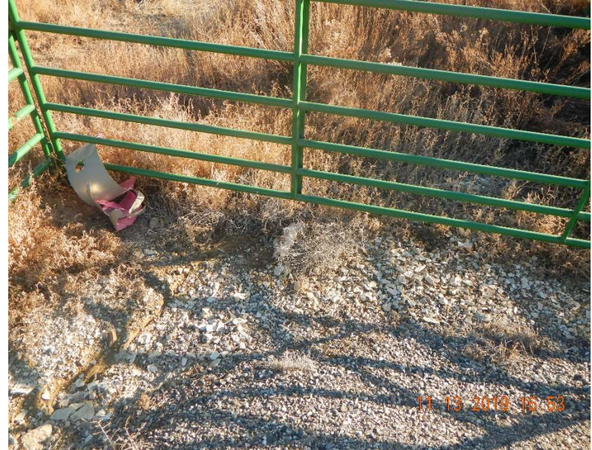
Photo #26 - View of the impacted soil and erosion rills located south of the pig launcher.