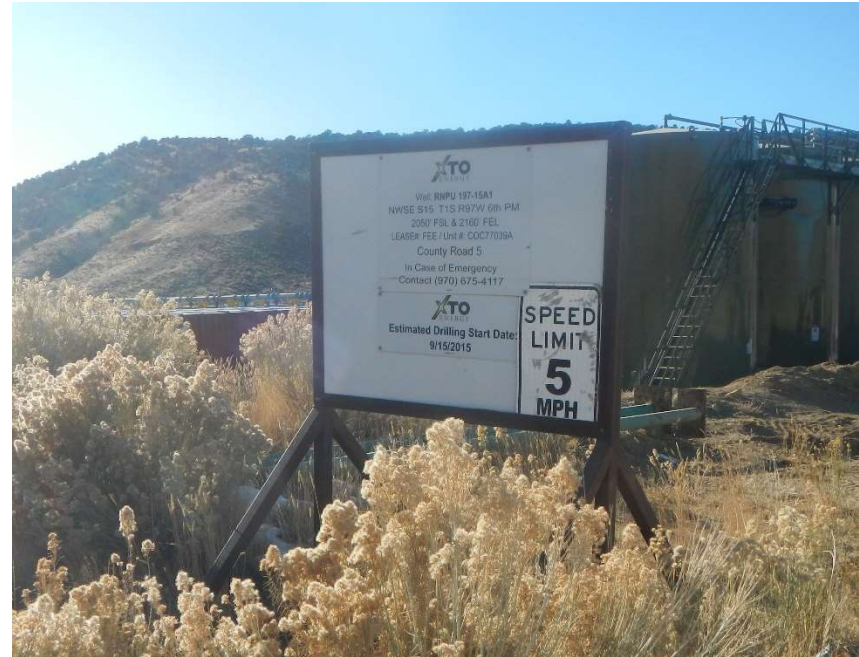
Photo #4 – View of the RNP 197-15A1 sign and the outdate drilling sign.