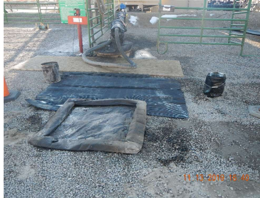
Photo #16 – View of the 15 feet by 30 feet by 3-inch+ deep area of impacted soil with a detectable odor located at the load out area, east of the tank battery.