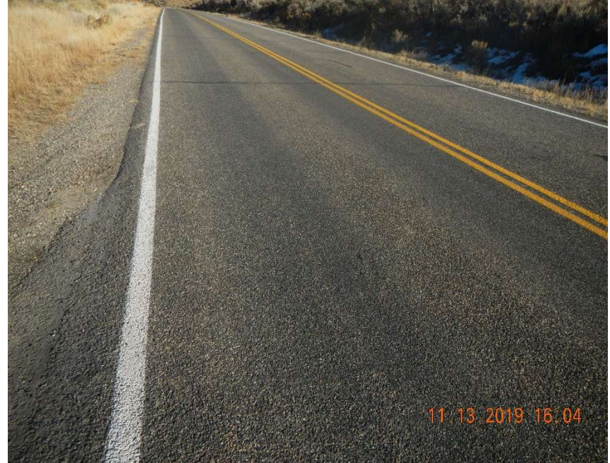
Photo #10 – View of the first pull off on County Road 5 (1.0 miles south of RNPU 197-15A1) looking north. No impacts were observed on the road or roadside.