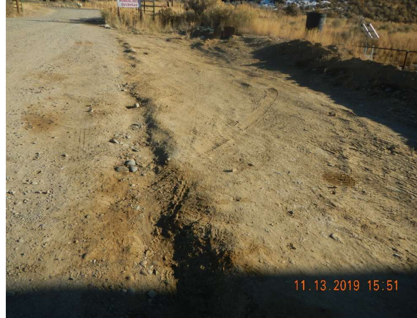
Photo #6 - View of impacted soil with a detectable odor located north of the load out area.