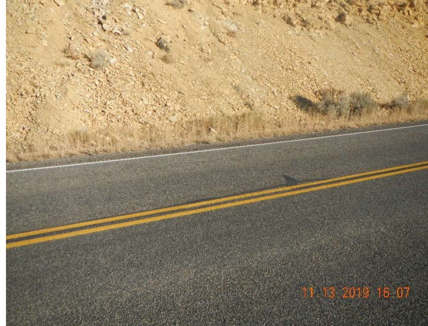
Photo #14 - View of the second pull off on County Road 5 (1.6 miles south of RNPU 197-15A1) looking south east. No impacts were observed on the road or roadside.