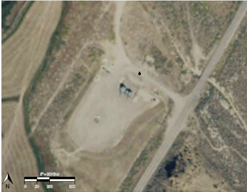
Photo #1 – Aerial view of the RNPU 197-15A1 (Location ID 441601). The black drop represents the initial spill/release location.

Location Name: RNPU 197-15A1, Love Ranch 1 Location ID: 441601, 316151 & Spill/Release ID: 469300 Inspection Date: November 13, 2019