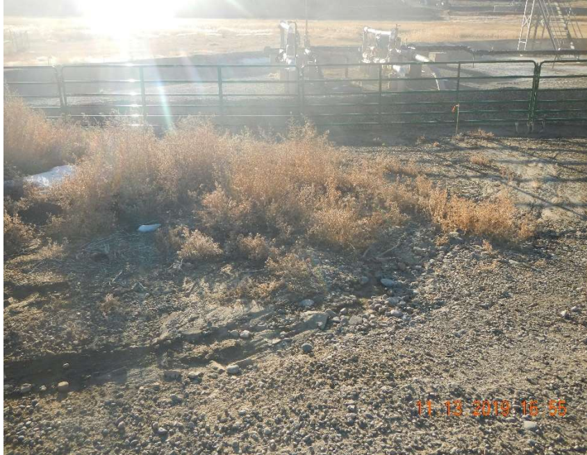
Photo #25 - View of the impacted soil and erosion rills located east of the pig launcher.

Location Name: RNP 197-15A1, Love Ranch 1 Location ID: 441601, 316151 & Spill/Release ID: 469300 Inspection Date: November 13, 2019