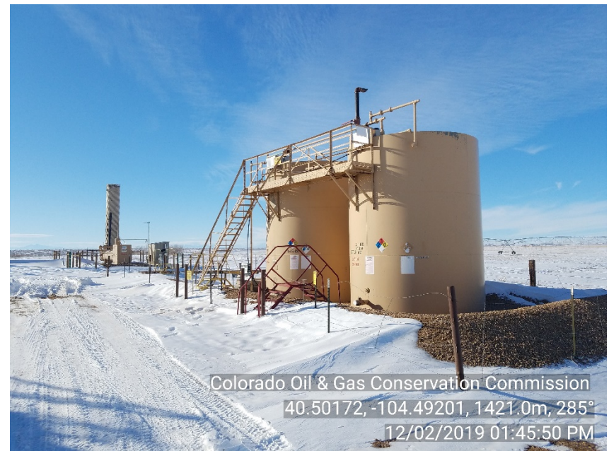
Colorado Oil & Gas Conservation Commission 40.50172, -104.49201, 1421.0m, 285° 12/02/2019 01:45:50 PM