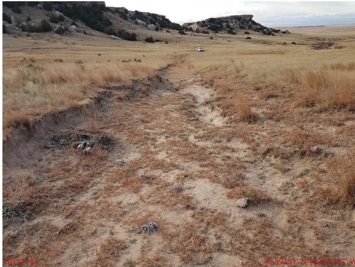
Photo 9: Photo taken from the access road, facing south towards the location. See comments under photo 7