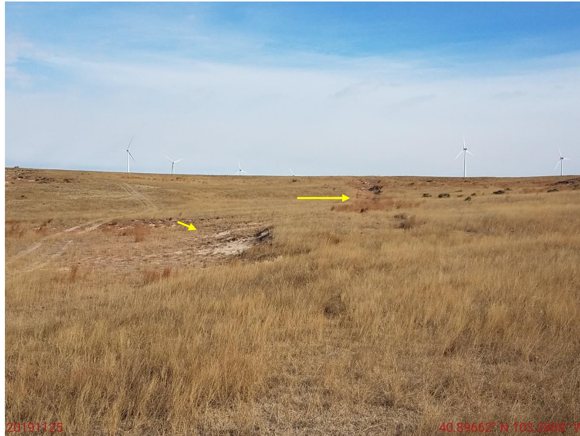
Photo 1: Photo taken from the south end of the location, facing north. Photo shows eastern end of pad with erosion concerns and un-reclaimed access road.