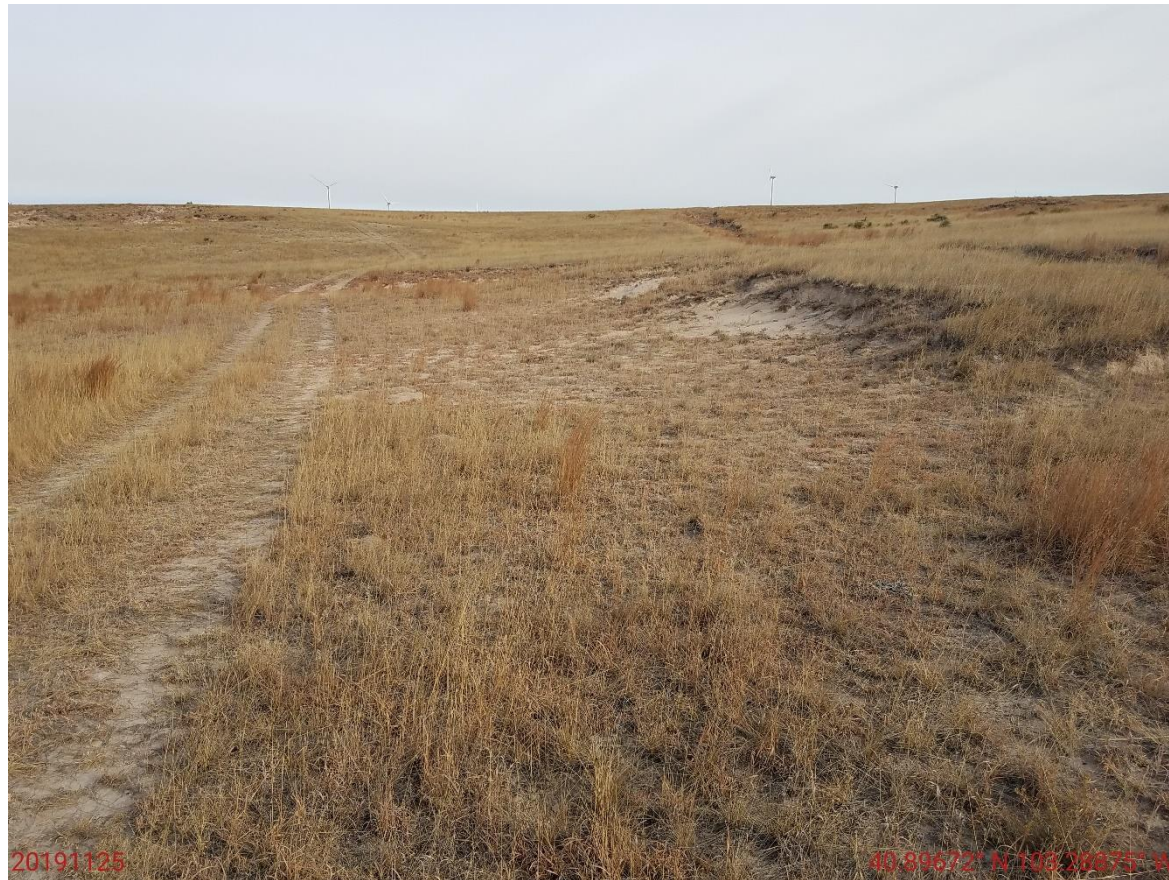
Photo 2: Photo taken from the south end of the pad, facing north. Photo shows erosion degradation on the east end of the pad remains.