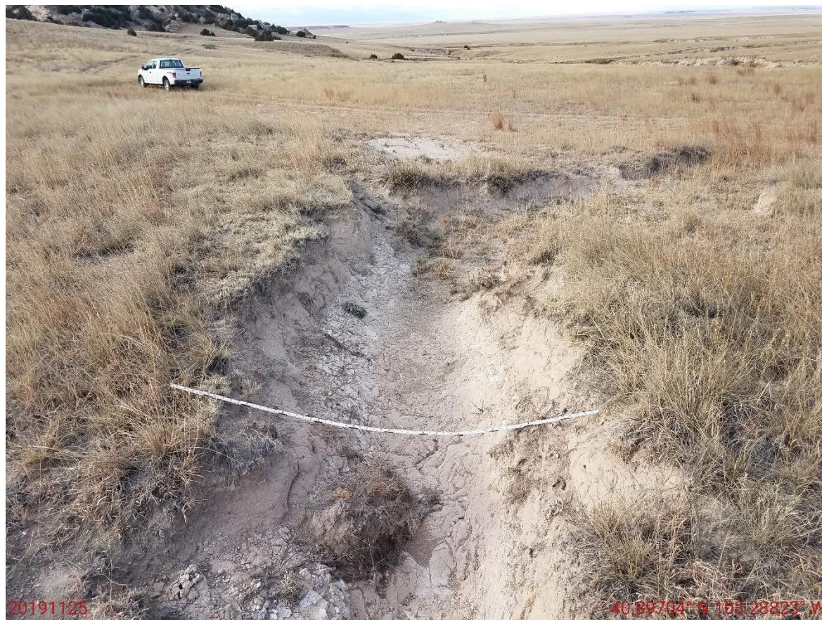
Photo 6: Photo taken from the east end of the location, facing southwest. Photo shows gully erosion. 6 foot measuring stick for reference.