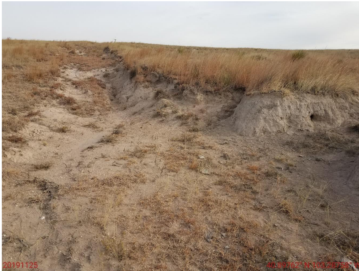
Photo 7: Photo taken from the access road northeast of the location, facing north. Photo shows access road has not been reclaimed, including but not limited to, recontouring/regrading to that of the adjacent lands. Stormwater has continued to degrade and channelize the access road.