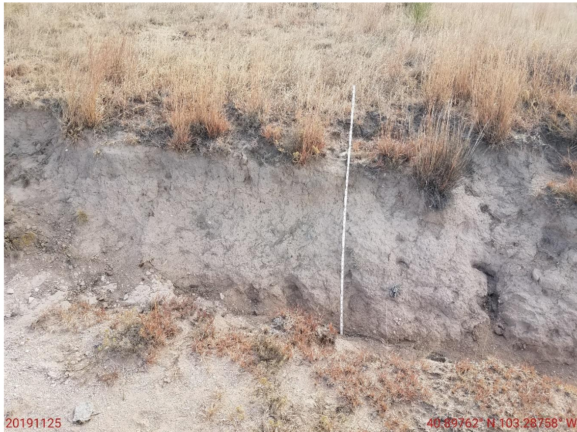
Photo 8: Continued from photo 7. 6 foot measuring stick for reference.