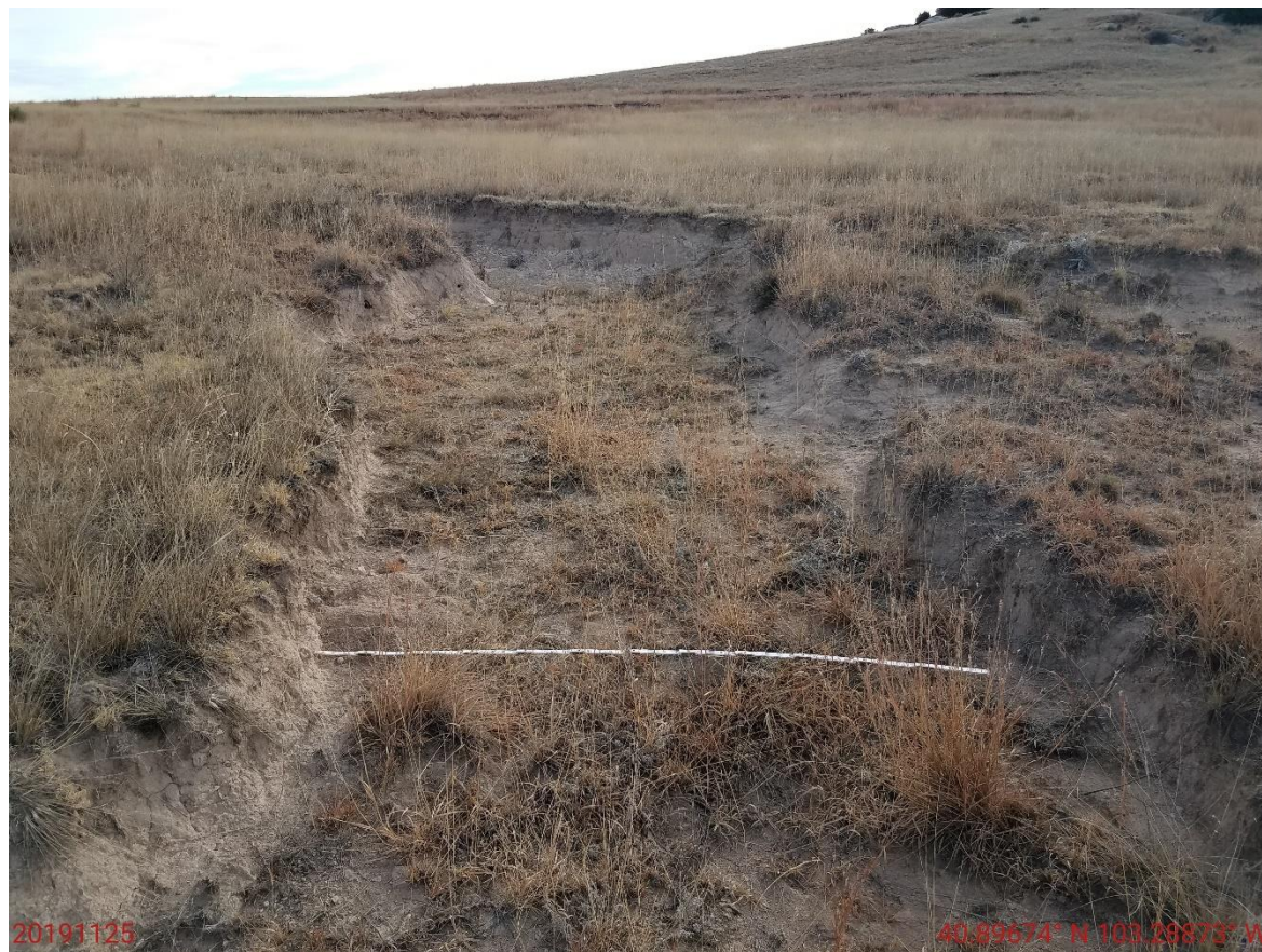
Photo 5: Photo taken from the east of the location, facing east. Photo shows gully erosion due to stormwater runoff from the access road. 6 foot measuring stick for reference.