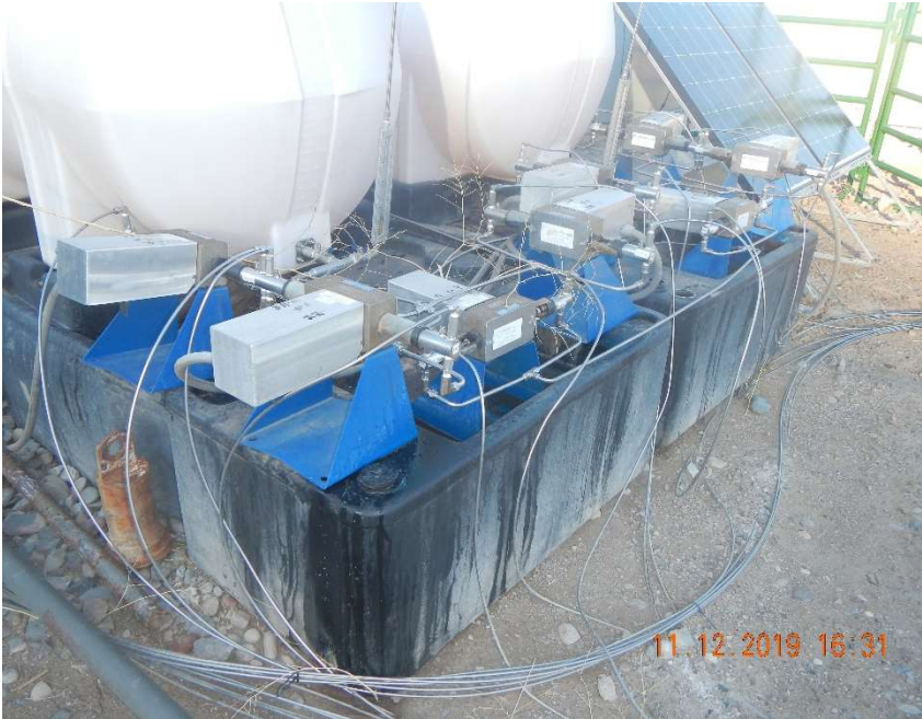
Photo #5 - View of staining on the containment of the plastic ASTs and the soil beneath the containment. Unused equipment is also present in the photo.