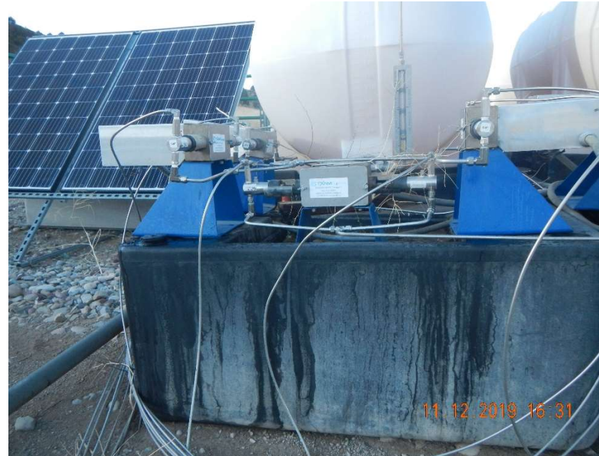
Photo #4 – View of staining on the containment of the plastic ASTs.