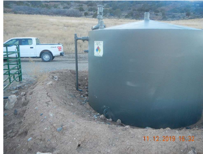
Photo #2 – View of the 80 bbls produced water tank with an earthen berm.