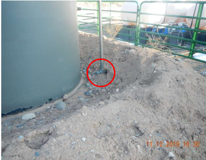
Photo #3 – View of the 2-inch flowline penetrating the south side of the earthen berm (Red circle).