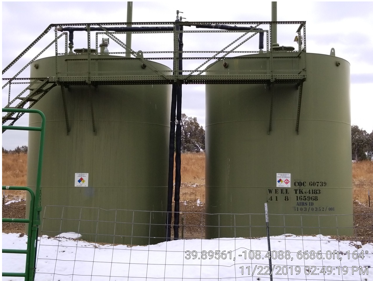
Photo 3. Tanks.

RGU 41-8-298 API: 05-103-10706 Inspection: 679706268