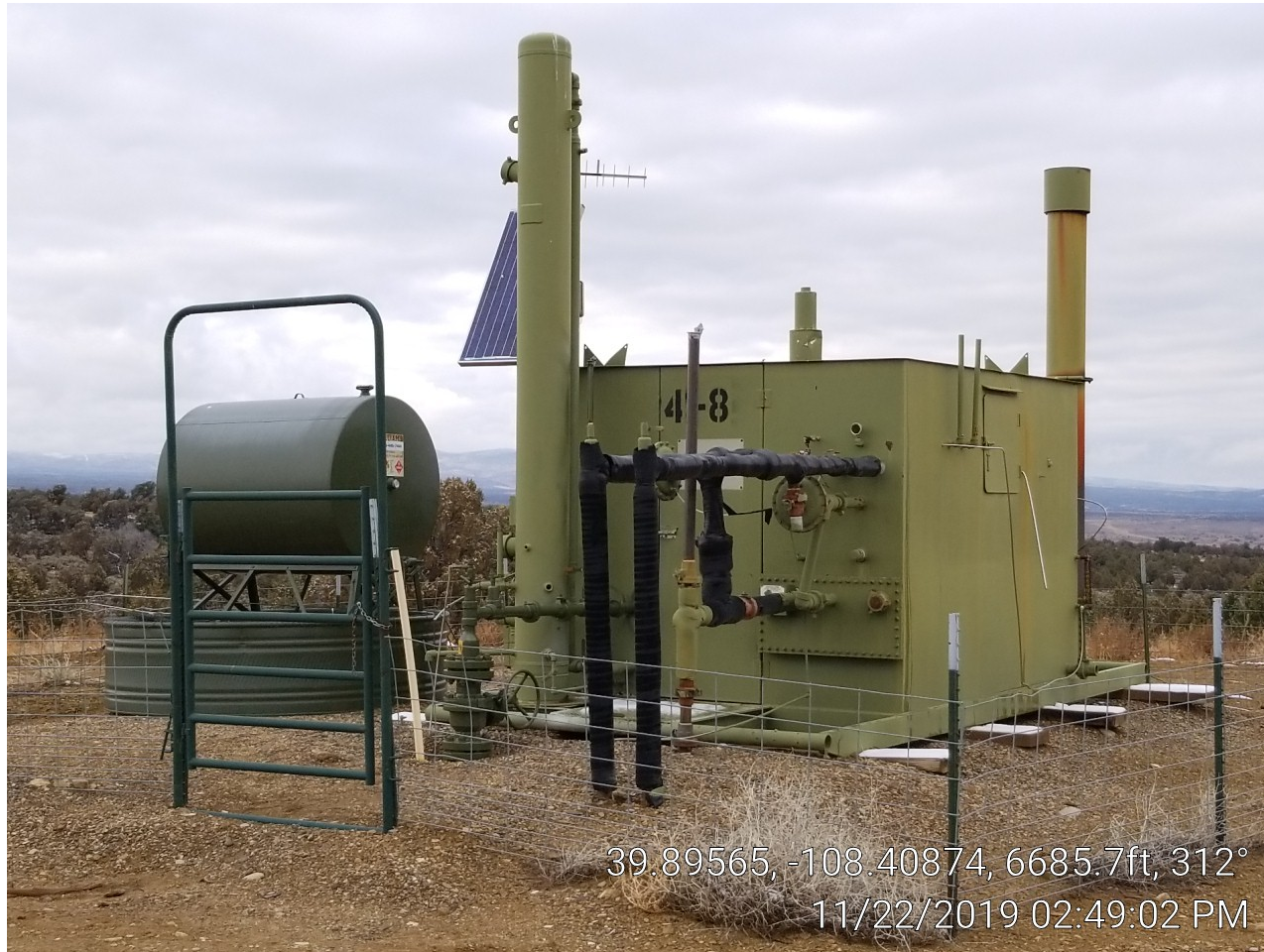
Photo 2. Separator.

RGU 41-8-298 API: 05-103-10706 Inspection: 679706268