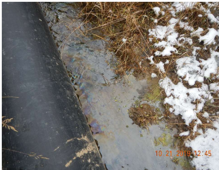
Photo # – Hydrocarbon sheen noted on surface water north of the weir and south of the Water Collection Vault.