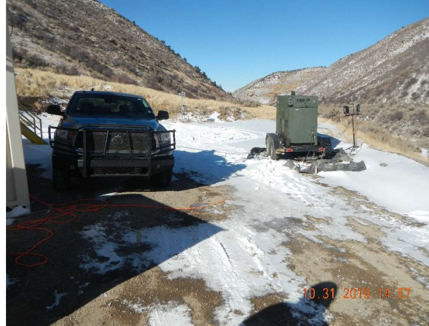
Photo #14 – View of the Operator's truck blocking access to the northern section of the location.