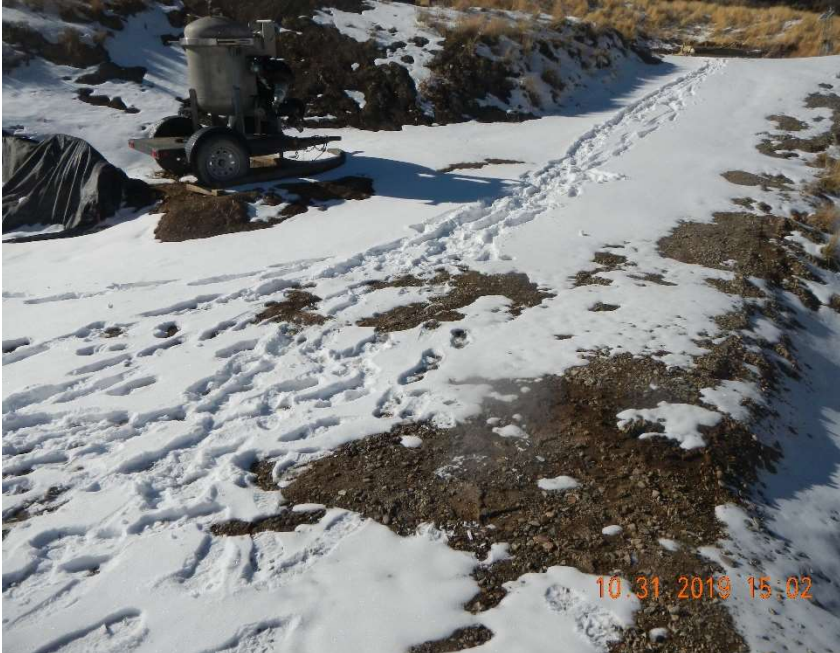
Photo #13 – View of the stained soil with a detectable hydrocarbon odor located north of the Water Collection Vault.