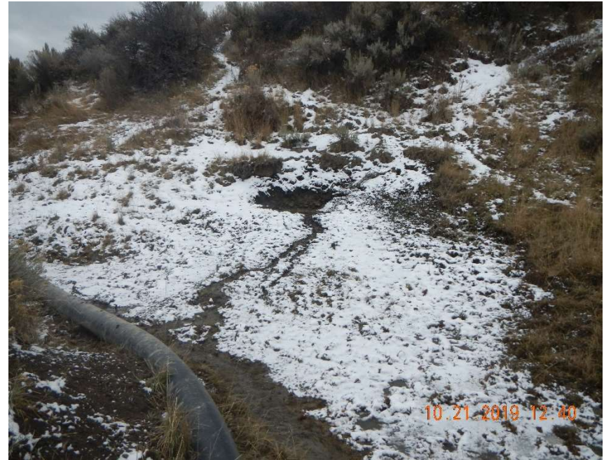
Photo #6 – Hydrocarbon seep north of the weir and south of the Water Collection Vault.