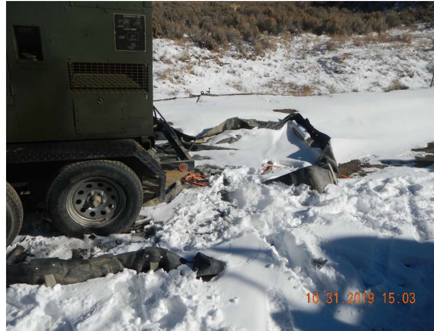
Photo # - View of the pump generator secondary containment in disrepair.