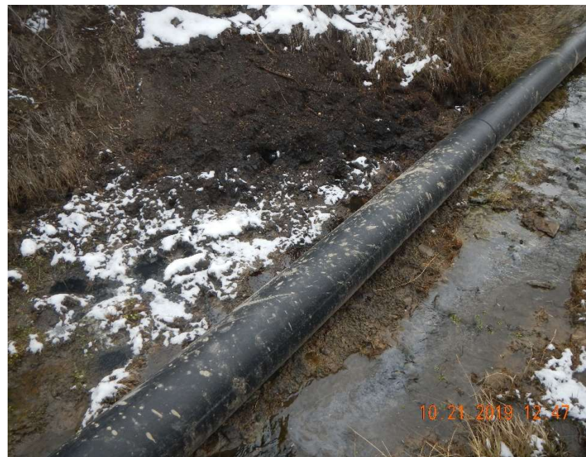
Photo # – Hydrocarbon Seep north of the weir and south of the Water Collection Vault.