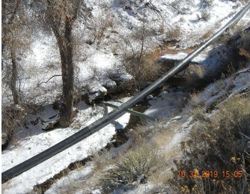
Photo #7 - View of the repaired poly pipe with additional support.