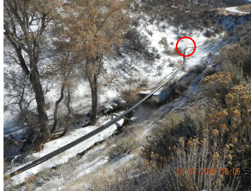
Photo #8 – View of the repaired section and the kink in the poly pipe (Red circle).