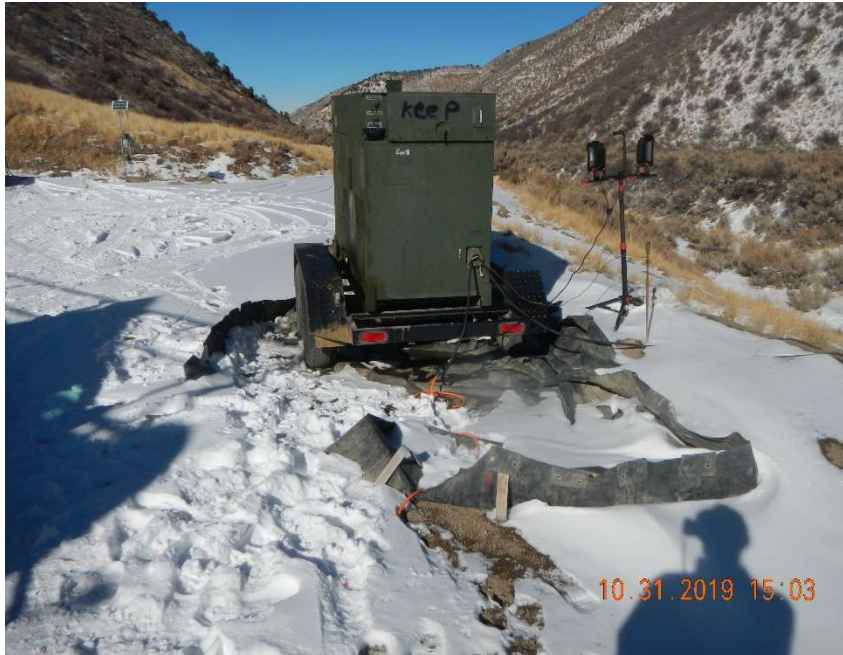
Photo #11 – View of the pump generator secondary containment in disrepair.