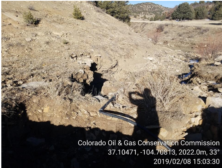
Colorado Oil & Gas Conservation Commission 37.10471, -104.70813, 2022.0m, 33° 2019/02/08 15:03:30