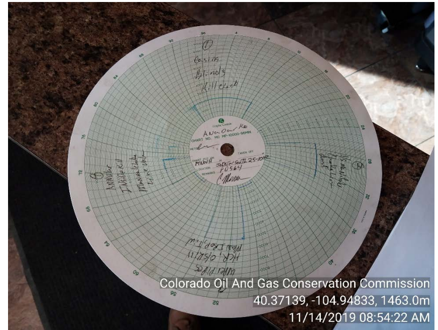
BOP test chart