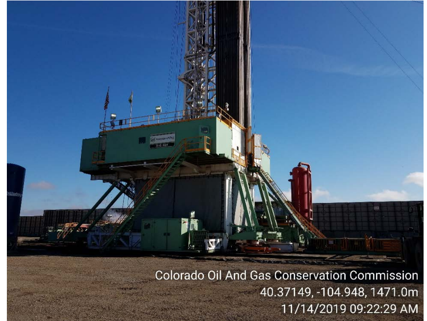
Precision rig #564