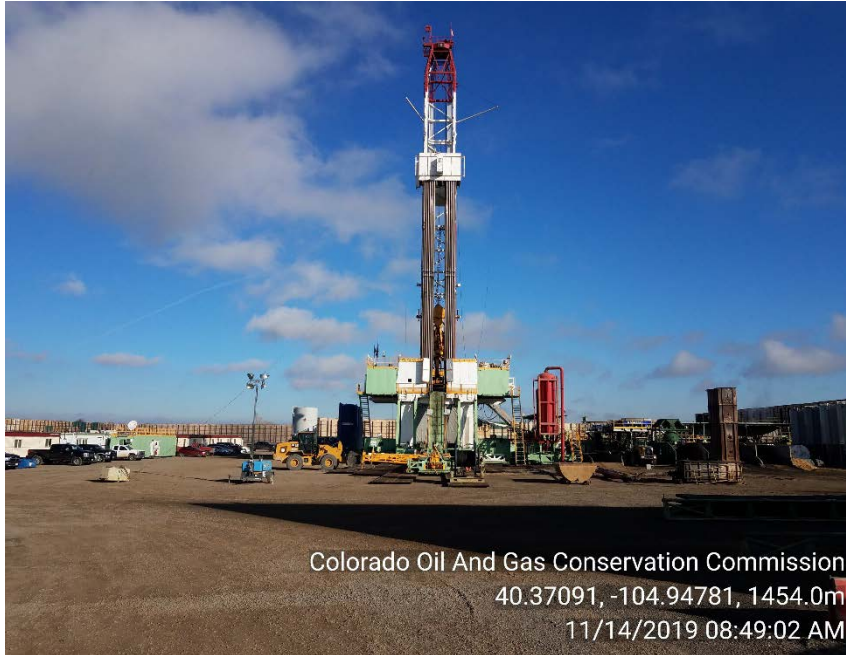
Precision rig #564