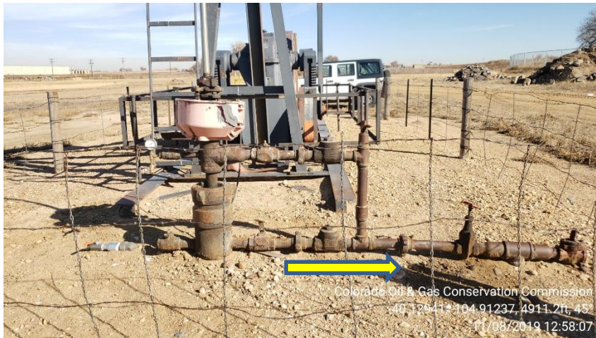
Photo 3 WH stained soil by valve