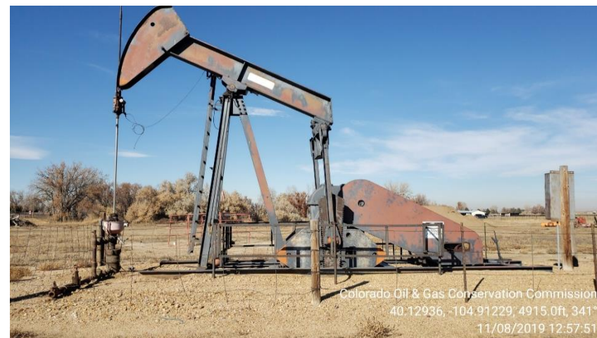
Photo 2 PU