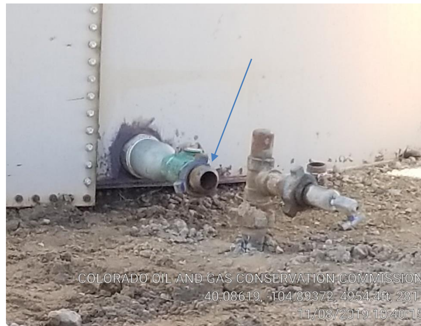
Pic 12 no cap on oil tanks