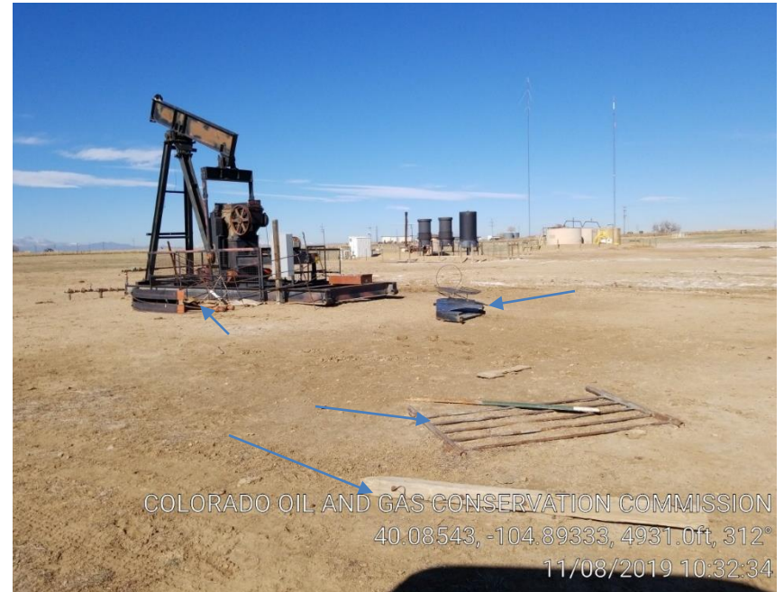
Pic 2 trash and parts around pump jack.