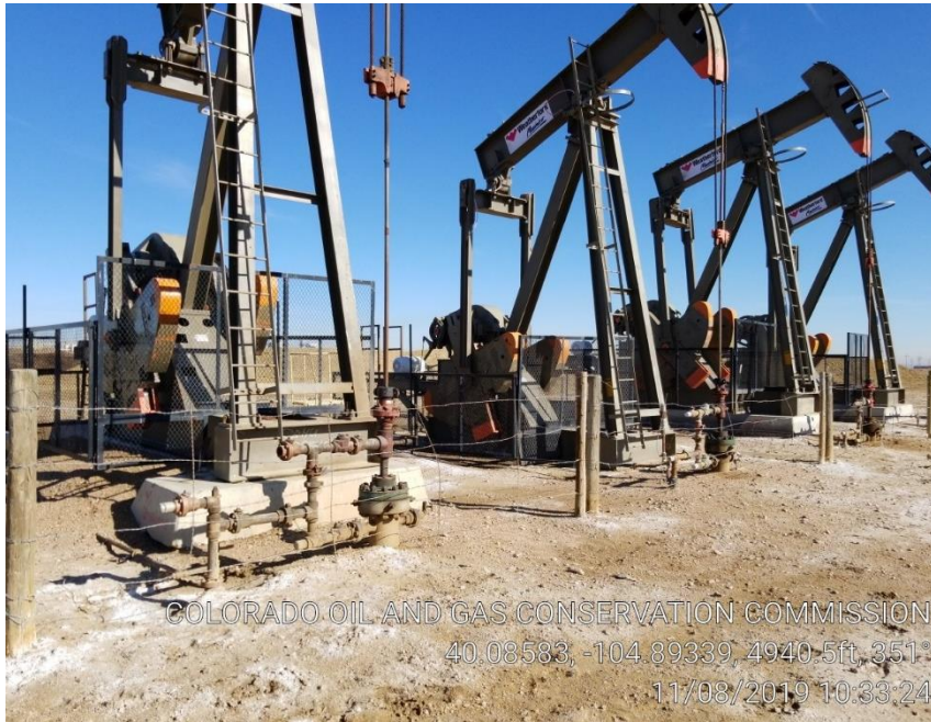
Pic 3 no wellhead sign or emergency contact number on 2 wells