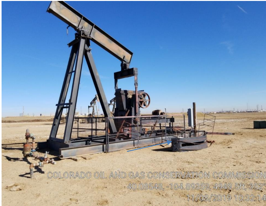
Pic 1 unused pumpjack and parts/no wellhead sign