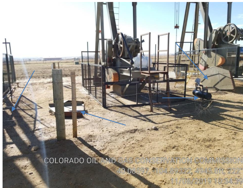
Pic 7 unused equipment/no wellhead sign on well