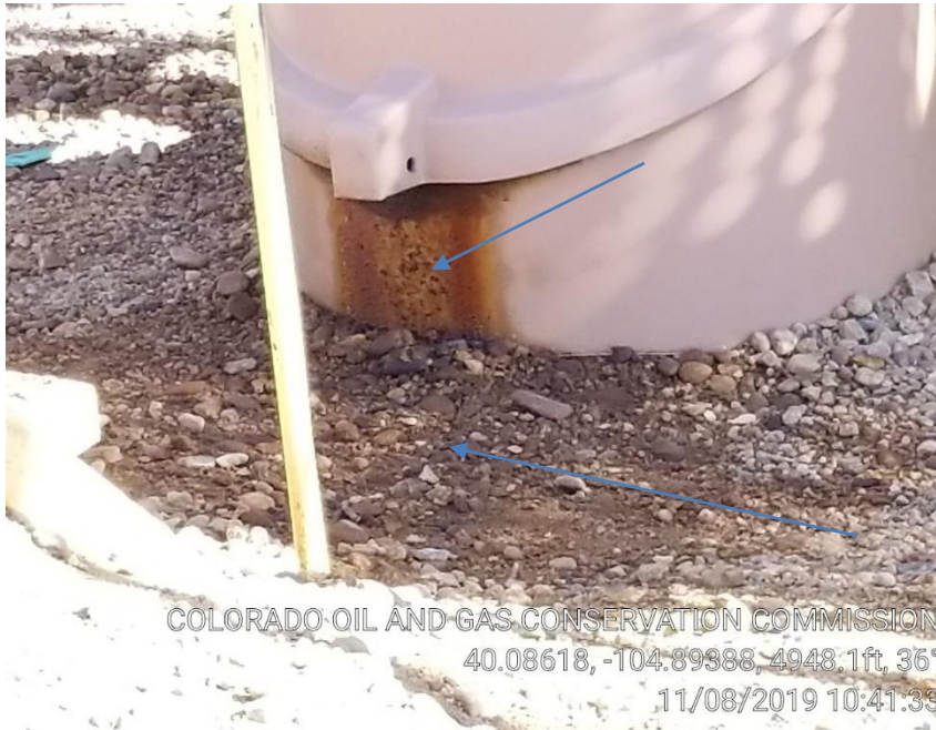
Pic 13 stained soil/possible leak