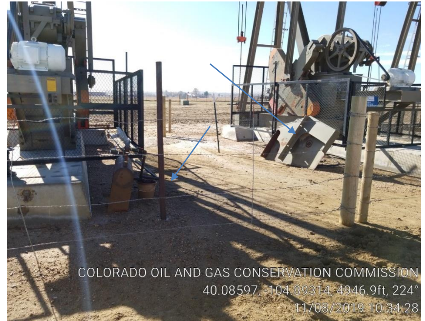
Pic 6 unused equipment and no wellhead sign on well