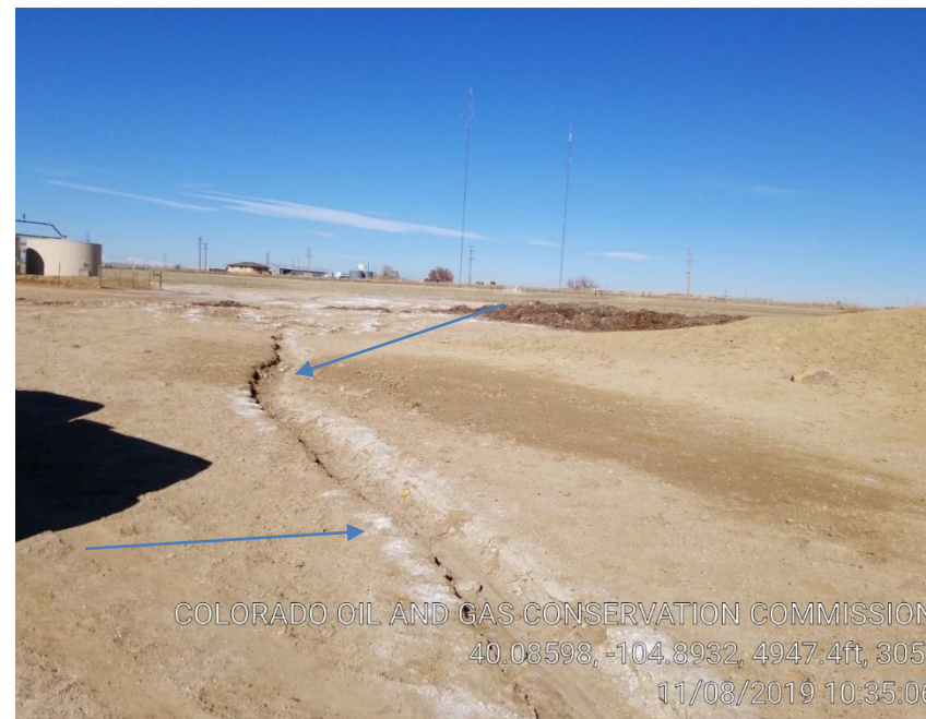
Pic 8 failing stormwater BMP