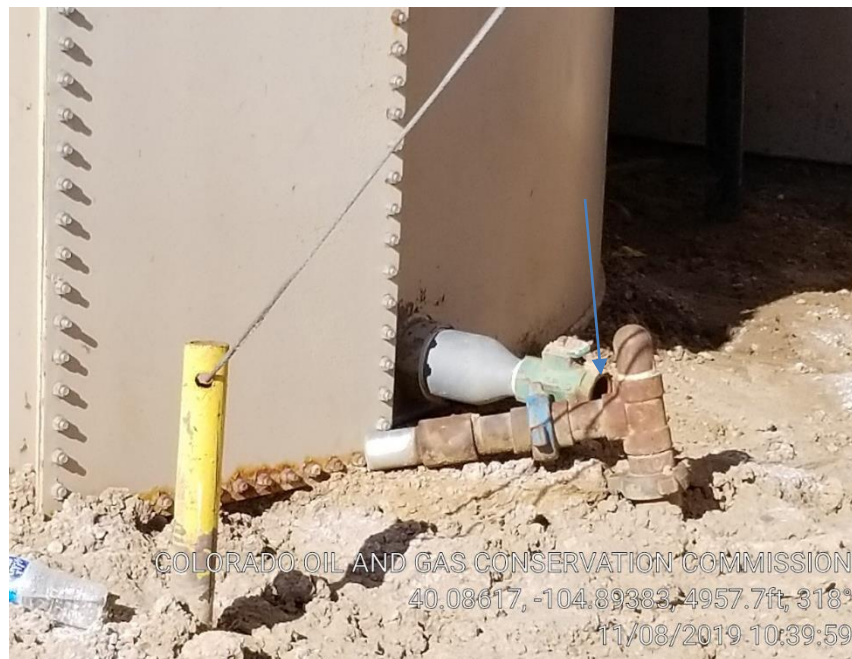
Pic 11 no cap on oil tanks