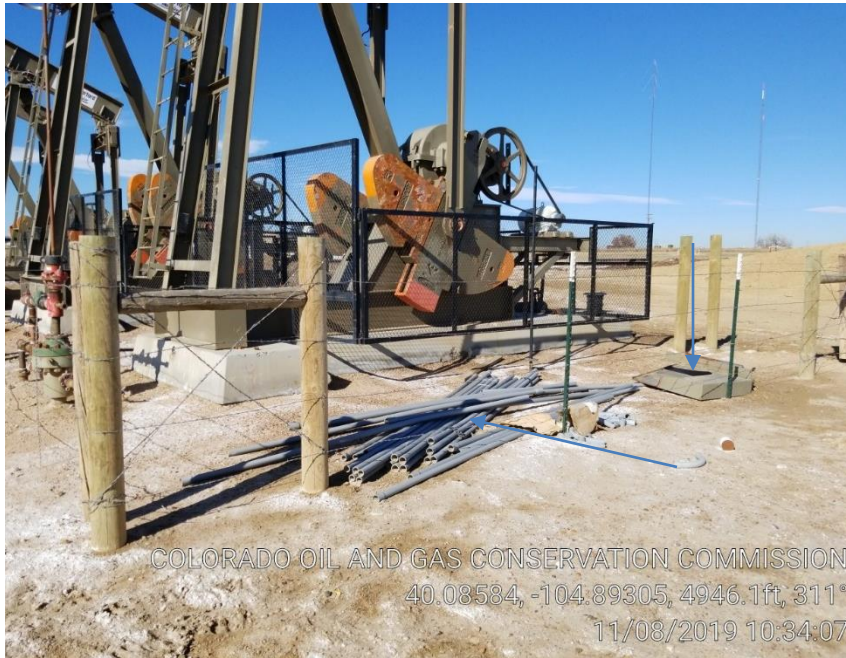
Pic 5 trash/unused equipment around pumpjack