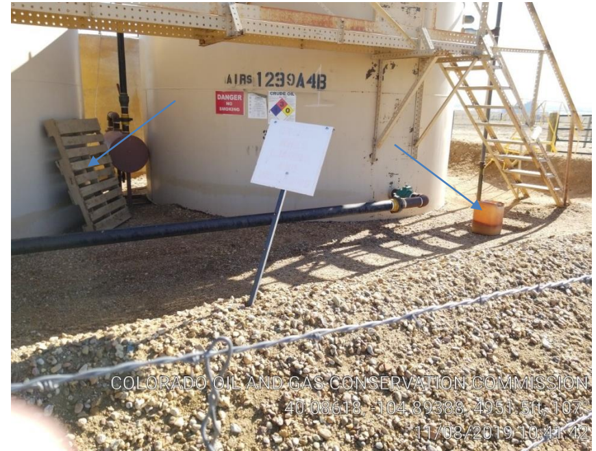
Pic 14 trash