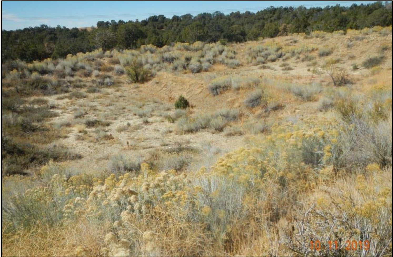
Photo 2. View of pits constructed and needing final reclamation.