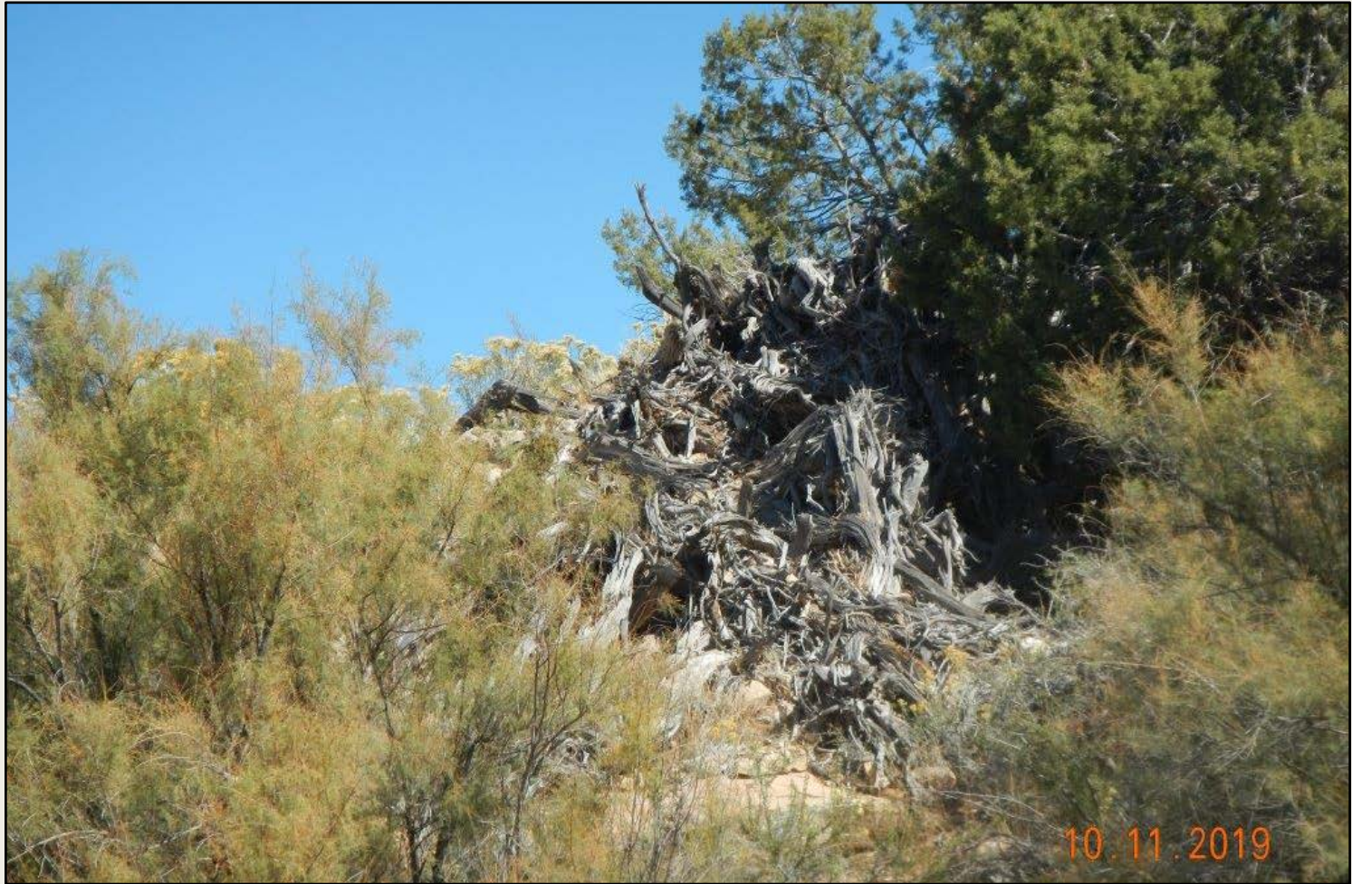
Photo 3. View of wood debris and salt cedar weeds within the eastern project area.