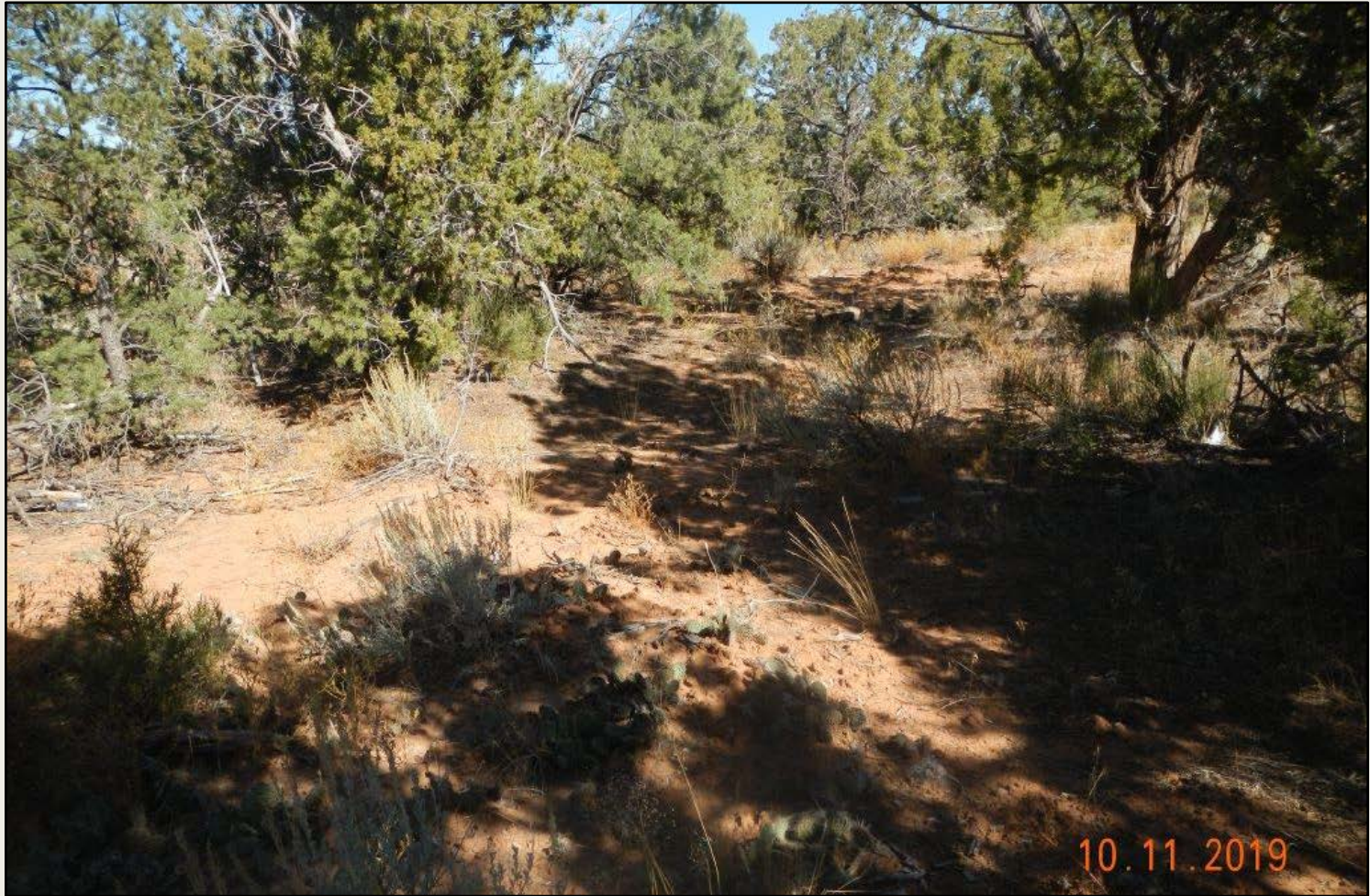
Photo 6. View of reference area vegetation comprised of pinyon-juniper woodland with sagebrush and native grasses and forbs in the understory.