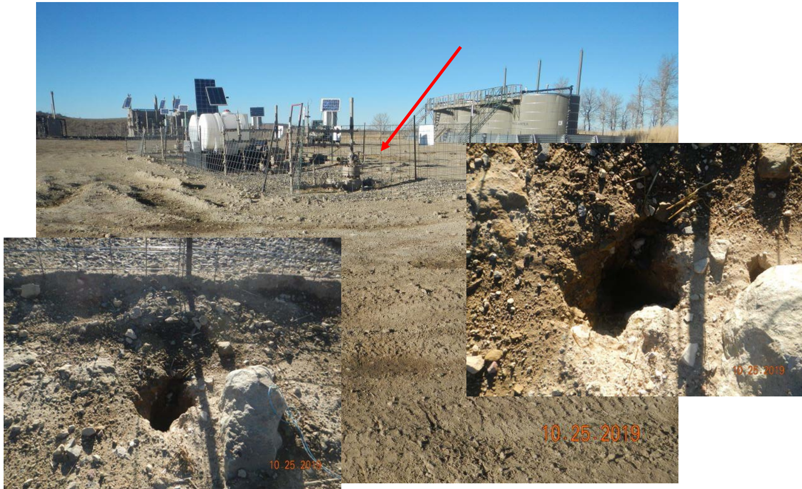
Photo#2: Stormwater discharge hole developed on NE side of Well corral Panels.