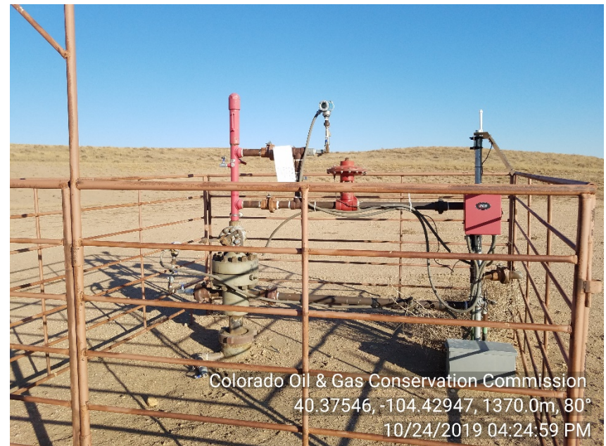
Photo #2 North Platte G-27 (05-123-35444) Wellsite Shut-In | SI