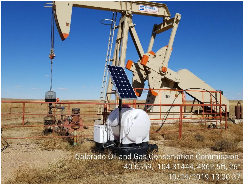
Photo 1 – Pumping Unit, weeds