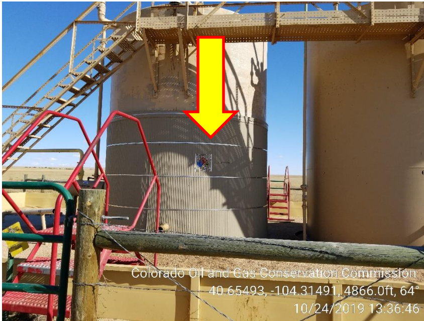
Photo 5 – 300 BBL Tank missing Content and Capacity, NFPA label is fading.