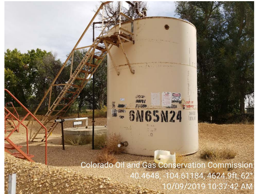
Photo 2 – Location photo; NFPA placard missing from crude oil tank