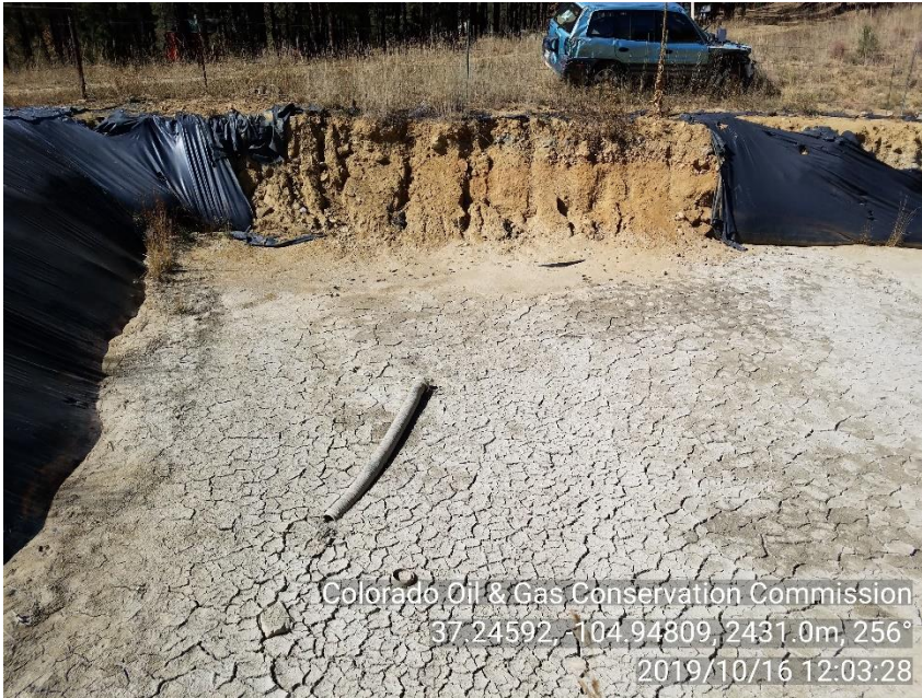
PHOTO 9: LINER ON TR WELL PIT, THIS IS THE SECOND WARNING ON CORRECTIVE ACTION. SIGN AT WELLHEAD STATES PIT IS IN PROCESS FOR CLOSURE. PIECES OF LINER ARE BEING SPREAD AROUND LOCATION AND OFF SITE. COMPLY WITH RULE 603.f. CONCERNING TRASH ON AND AROUND LOCATION, REMOVE SOURCE OF TRASH PREADING.