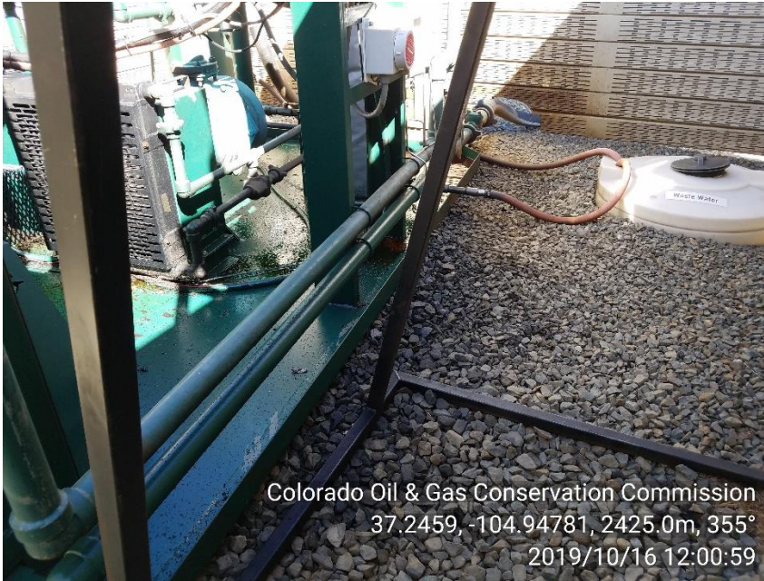
Colorado Oil & Gas Conservation Commission 37.2459, -104.94781, 2425.0m, 355° 2019/10/16 12:00:59

PHOTO 5: AREA OF IMPACTED SOIL AROUND COMPRESSOR SKID. Properly treat or dispose of oily waste in accordance with 907.e. CA DATE 11-16-19.