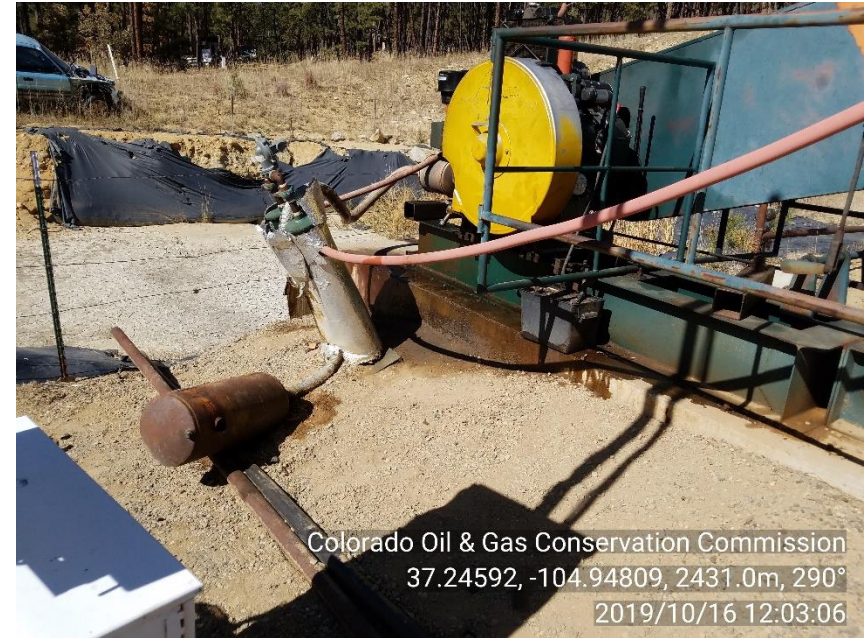
PHOTO 8: AREA OF IMPACTED SOIL AROUND TR WELLHEAD. Properly treat or dispose of oily waste in accordance with 907.e. CA DATE 11-16-19.