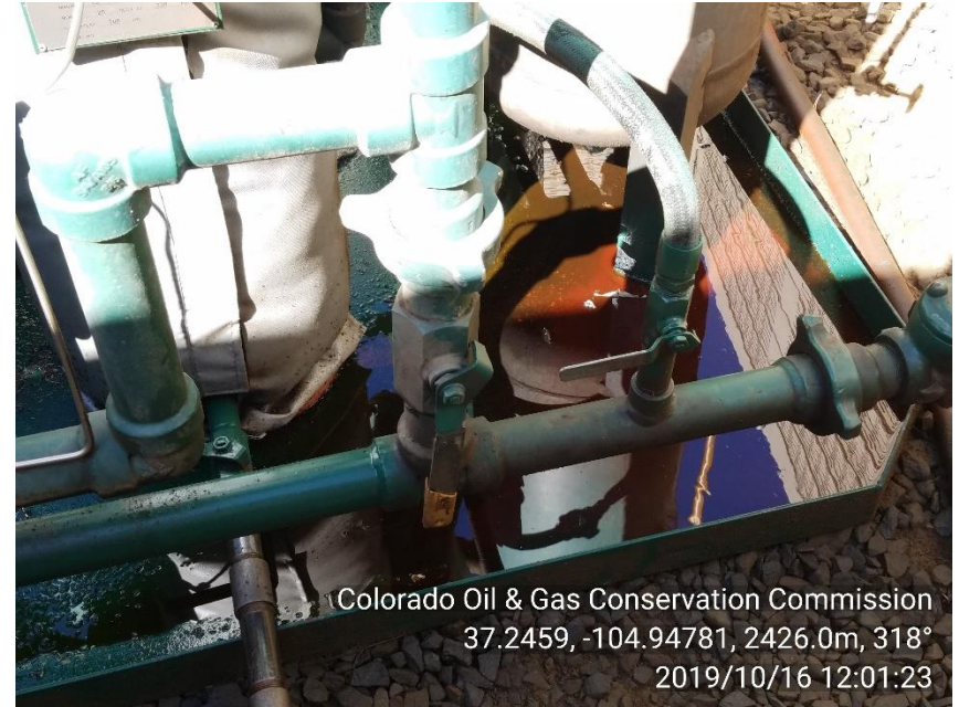
Colorado Oil & Gas Conservation Commission 37.2459, -104.94781, 2426.0m, 318° 2019/10/16 12:01:23

PHOTO 5: AREA OF IMPACTED SOIL AROUND COMPRESSOR SKID. Properly treat or dispose of oily waste in accordance with 907.e. CA DATE 11-16-19.