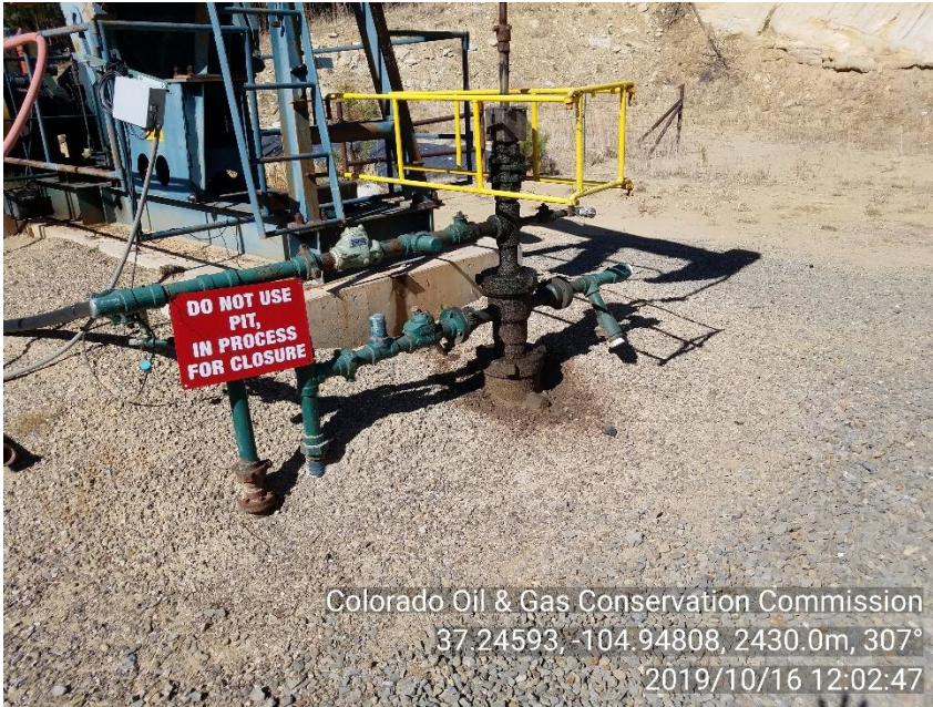
PHOTO 7: AREA OF IMPACTED SOIL AROUND TR WELLHEAD. Properly treat or dispose of oily waste in accordance with 907.e. CA DATE 11-16-19.