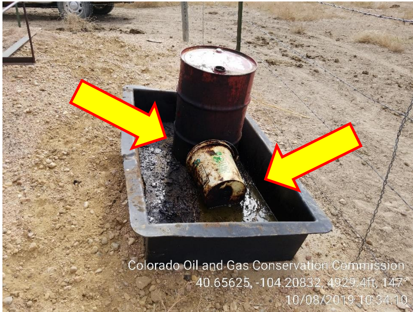
Photo 7 – Oily Waste and unused Chemical Containers at Pumping Unit