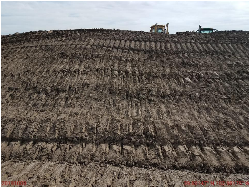
Photo 5: Photo taken from the topsoil stockpile on the west end of the location, facing east. Photo shows Operator has installed surface roughening (tracking) as a stabilization control on the slopes. Tracking has been installed along the contour of the slopes, rather than up and down. This will facilitate stormwater runoff and erosion degradation. BMP has not been installed in accordance with good engineering practices.