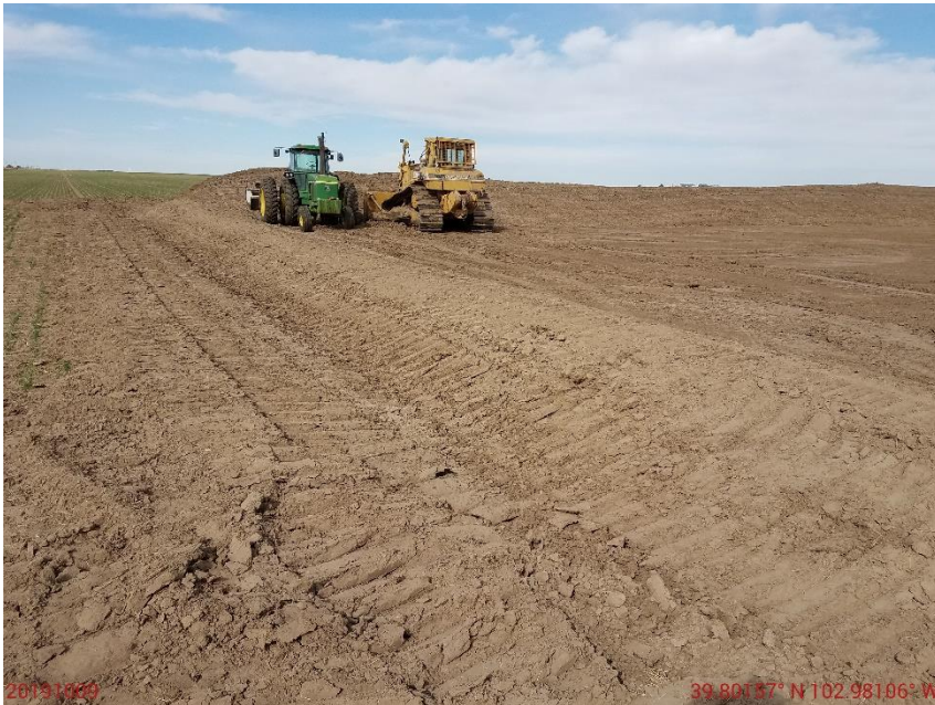
Photo 1: Photo taken from the south end of the location, facing west. Photos 1-4 provide an overview of the location from west, northwest, northeast to east.