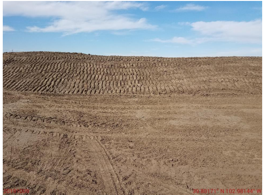
Photo 6: Photo from the topsoil stockpile on the west end of the location, facing west. See comments under photo 5.

Photo 5: Photo taken from the topsoil stockpile on the west end of the location, facing east. Photo shows Operator has installed surface roughening (tracking) as a stabilization control on the slopes. Tracking has been installed along the contour of the slopes, rather than up and down. This will facilitate stormwater runoff and erosion degradation. BMP has not been installed in accordance with good engineering practices.