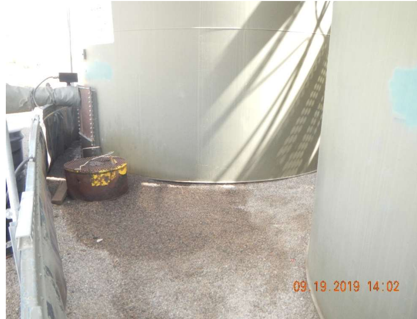
Photo #6 – View of the stained gravel within the secondary containment of the upper tank battery.