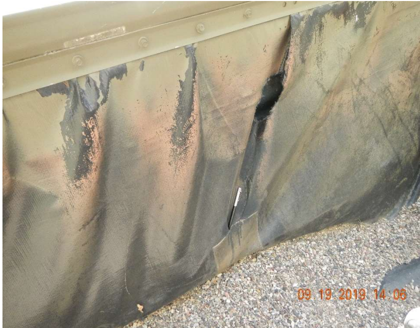
Photo #5 – View of the 5-6-inch hole and pen sized hole in a patch in the secondary containment liner of the upper tank battery.