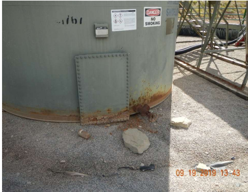
Photo #3 – View of the rusted out bull plug in the lower tank battery.