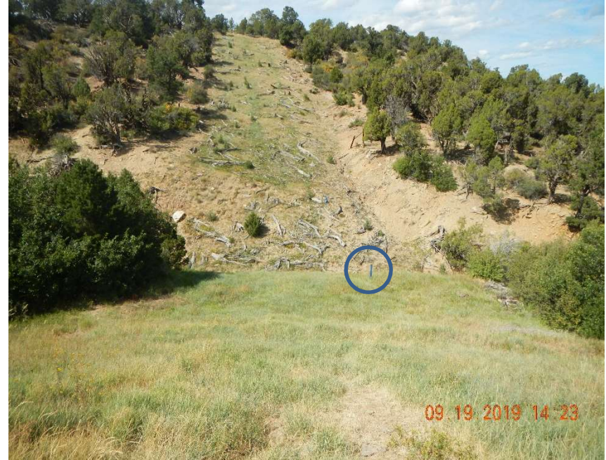
Photo #10 – View of the right away located north of the location. The mentioned hole is located near the blue pipeline marker (blue circle).