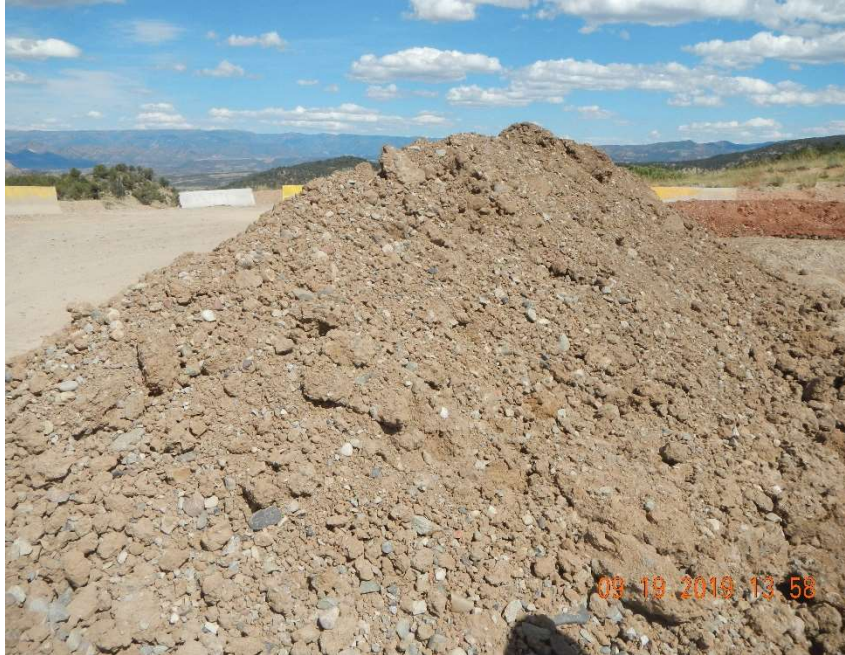
Photo #9 – View of the stockpiled soil on the north side of the excavation.