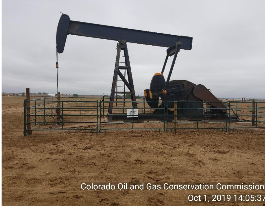
Photo 1 WH sign and PU