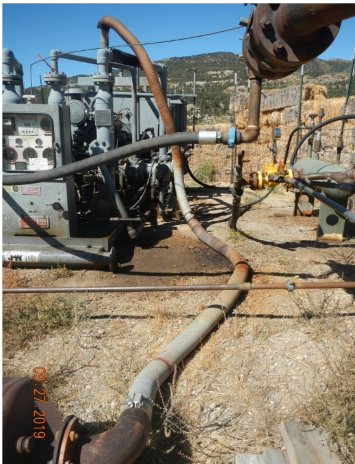
Photo#9: Staining, impacted soil observed around multiple pieces of equipment.