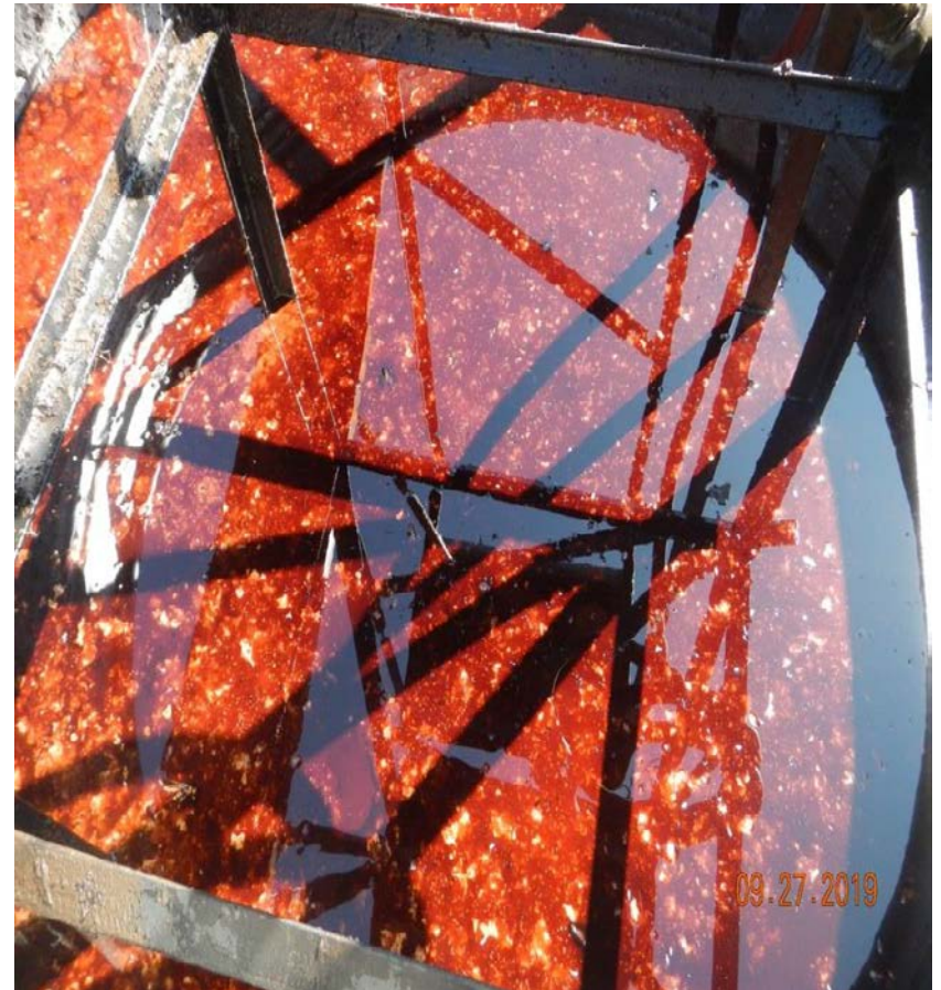
Photo#12: Close up view of liquid in stock tank used for containment of day tanks.