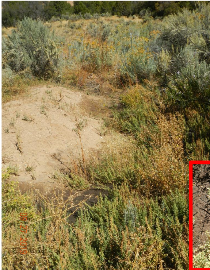
Photo#19: Shallow pit hidden in weeds at East side of site. Insert is close up of impacted soil.