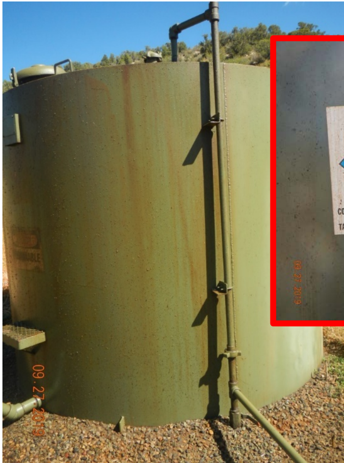
Photo#17: Tank appears stained with overflow; insert of tank label missing Capacity and contents.