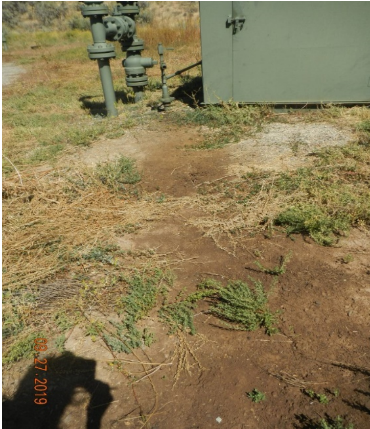
Photo#15: Staining, impacted soil observed around multiple pieces of equipment.