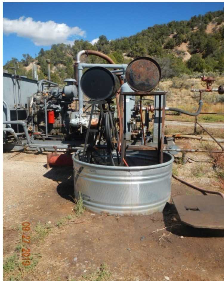
Photo#10: Staining, impacted soil observed around multiple pieces of equipment.