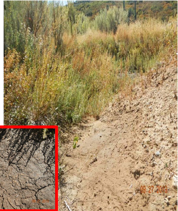
Photo#20: Shallow pit hidden in weeds at East side of site. Insert is close up of impacted soil.