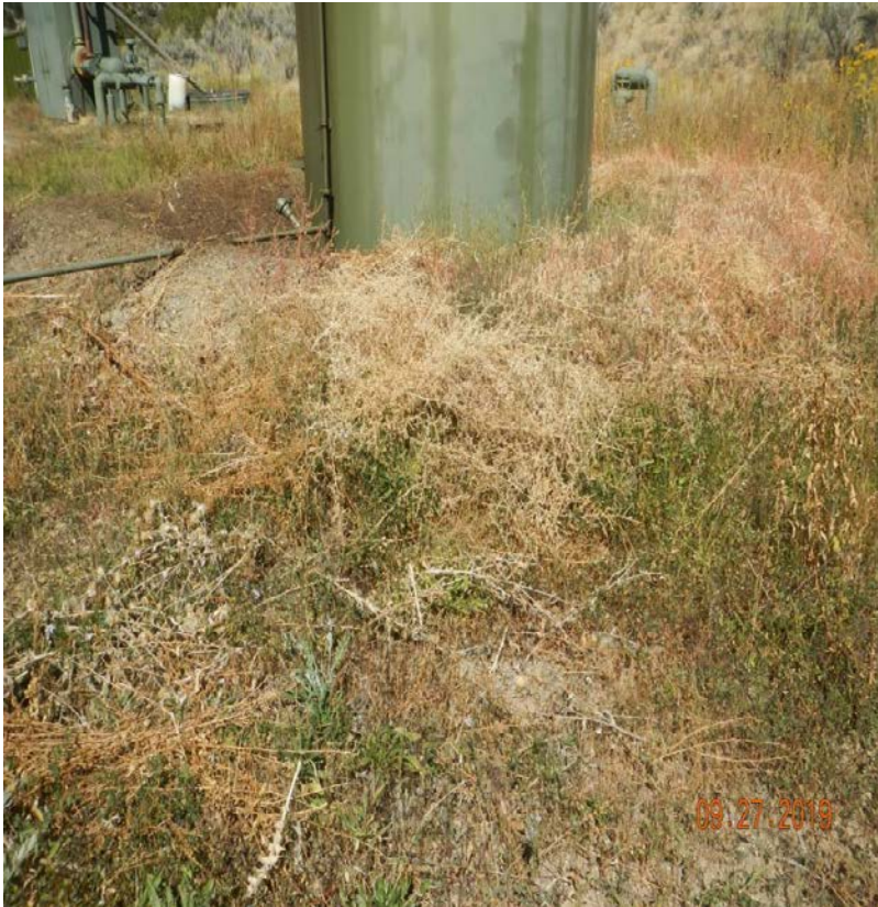
Photo#7: Mature weeds have been cut off, left on site & become Debris.