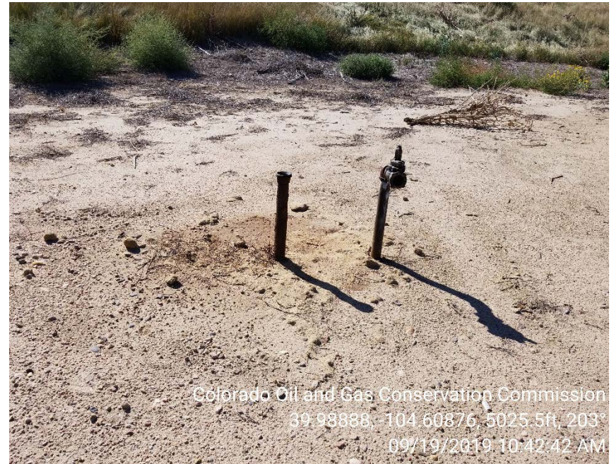
Photo 6 – Unmarked/inactive flowline risers located between tanks and separator