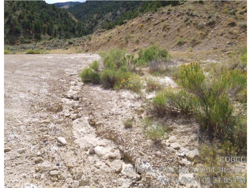
Photo 6. Storm water channel on lease road.