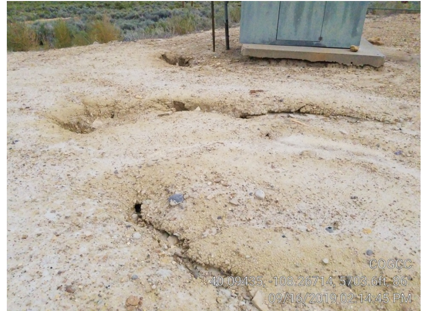
Photo 4. Storm channels on north side of location.