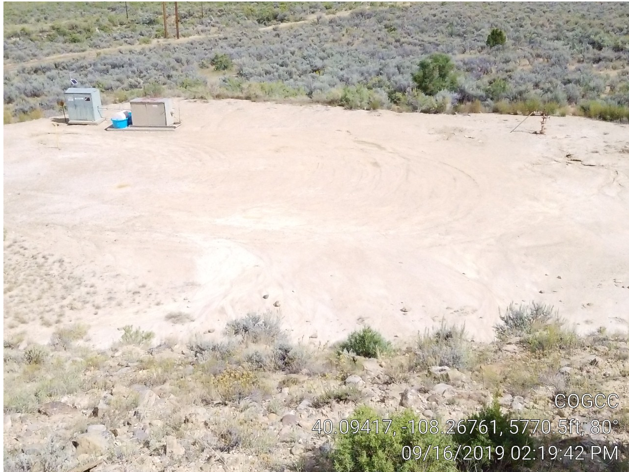
Photo 1. Location.

Government 2-34 API: 05-103-07413 Inspection: 679705458