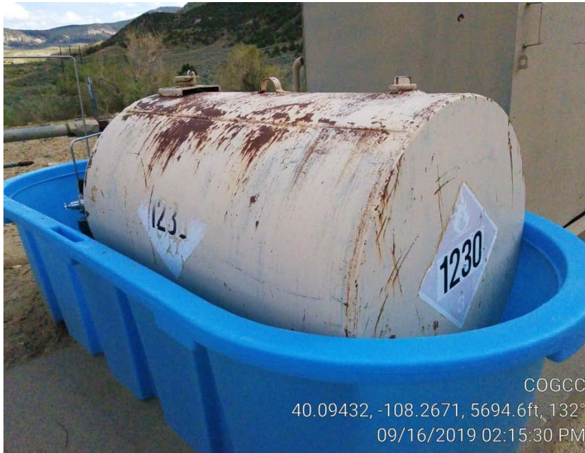
Photo 9. Container.

Government 2-34 API: 05-103-07413 Inspection: 679705458