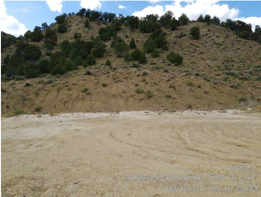
Photo 3. West side of location