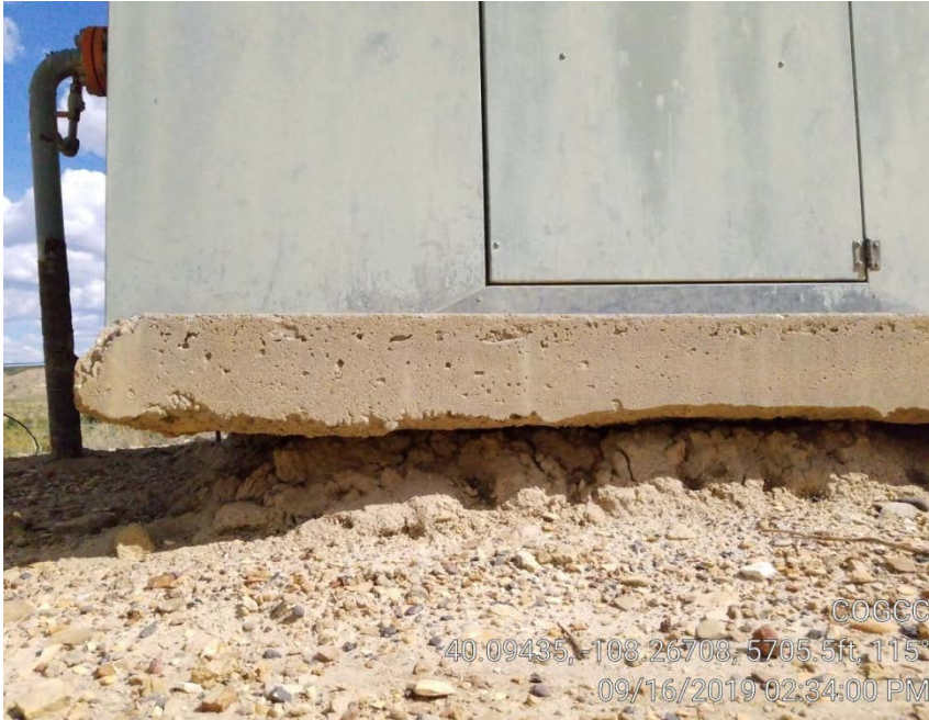
Photo 5. Gas meter building foundation.