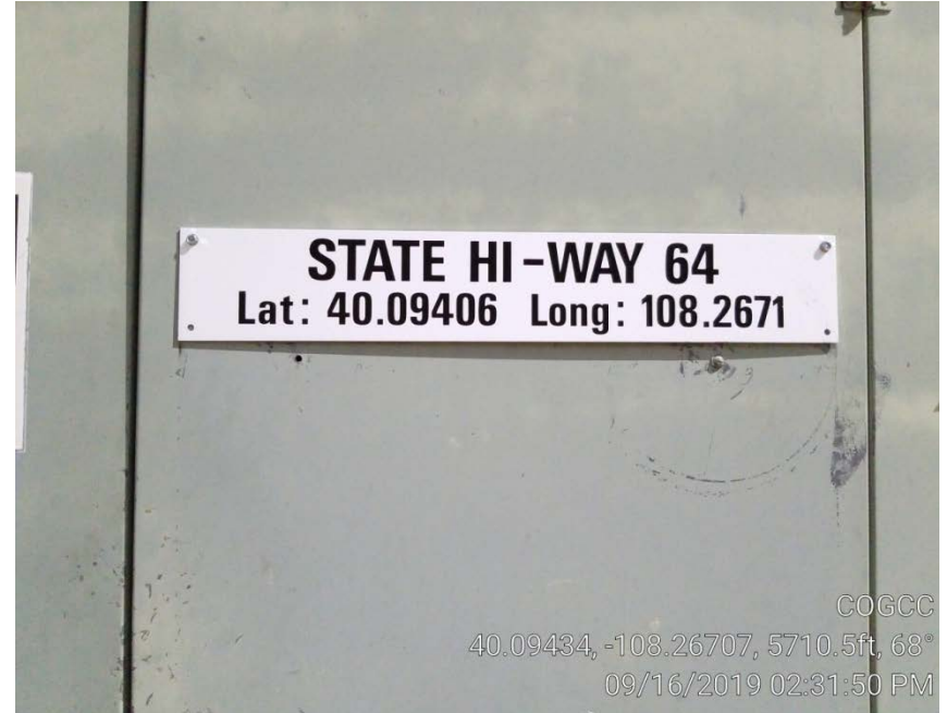
Photo 8. Signage on meter building.