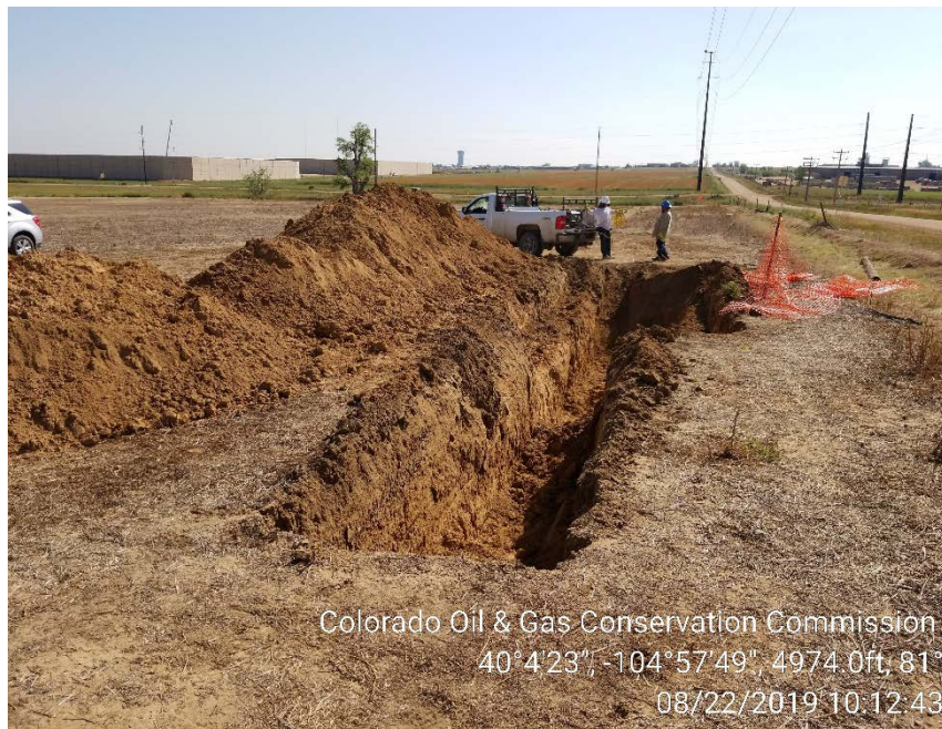
Excavation to expose failed section of flowline.