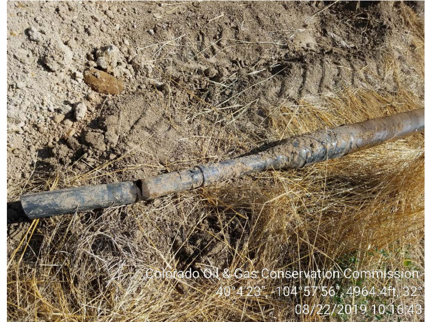
Failed section of flowline.