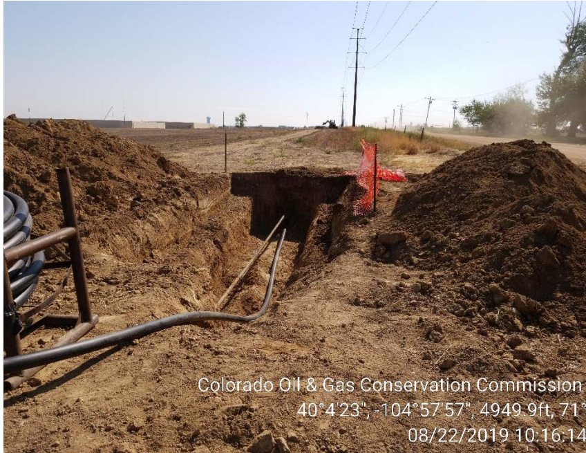
Excavation to expose failed section of flowline.