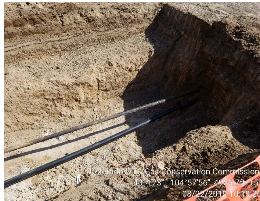
View into open excavation.