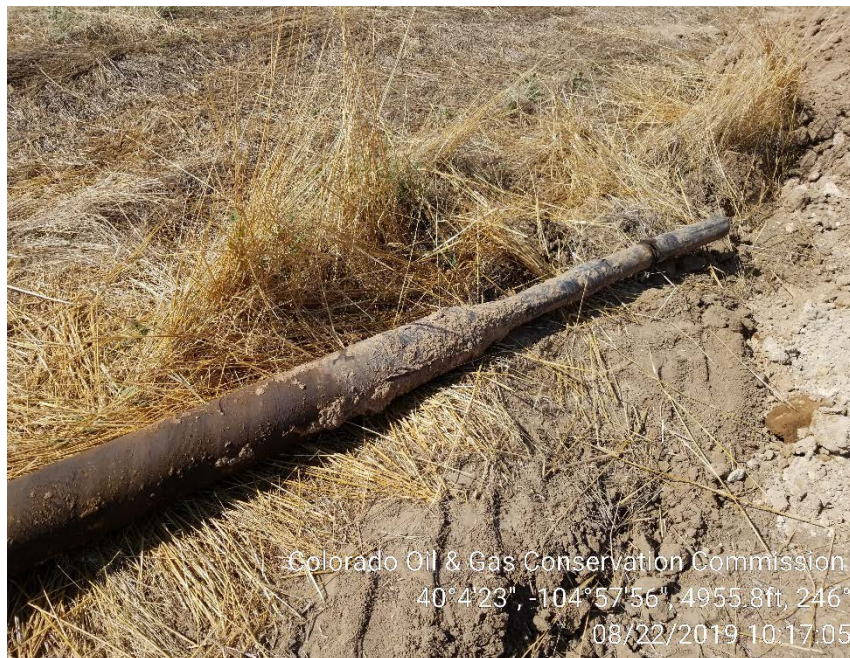
Failed section of flowline.