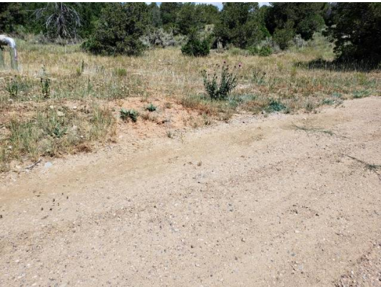
Completed work description Completed work description of corrective action 4 Additional photos