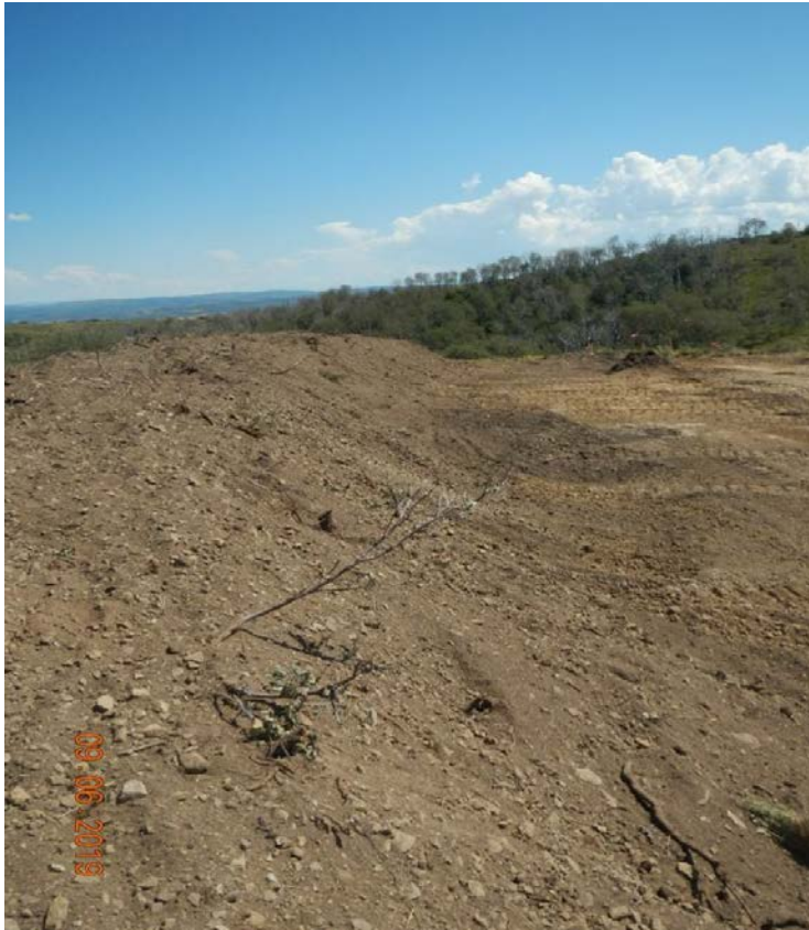
Photo#4: Topsoil windrowed along top of Cut slope is not being protected.