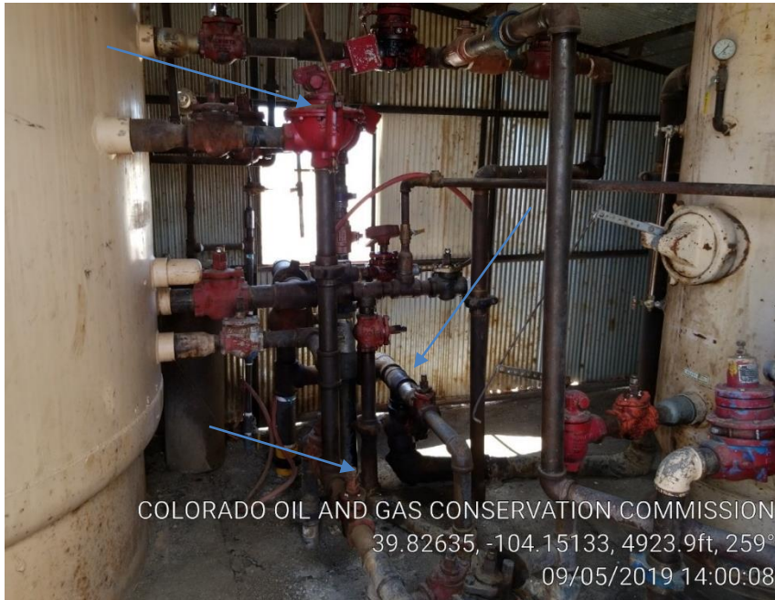
Pic 9 stained soil/mechanical conditions