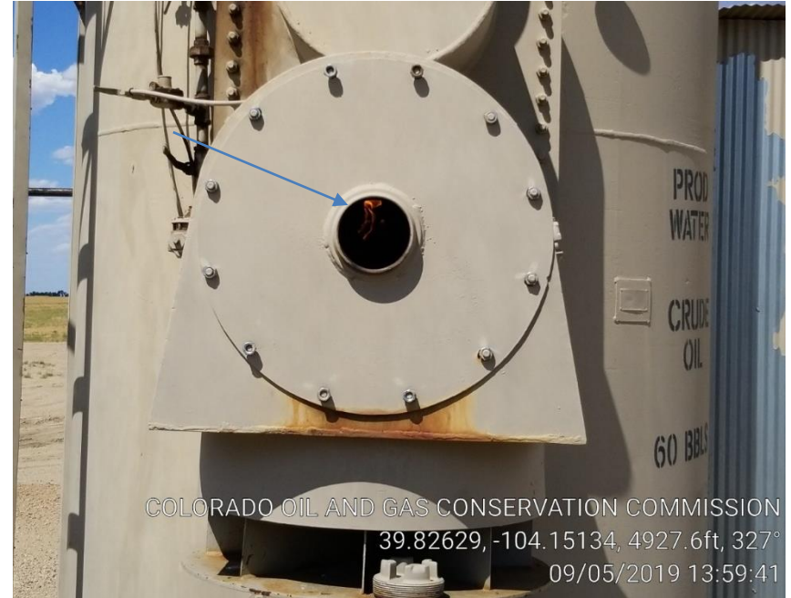
Pic 8 no netting around open flame