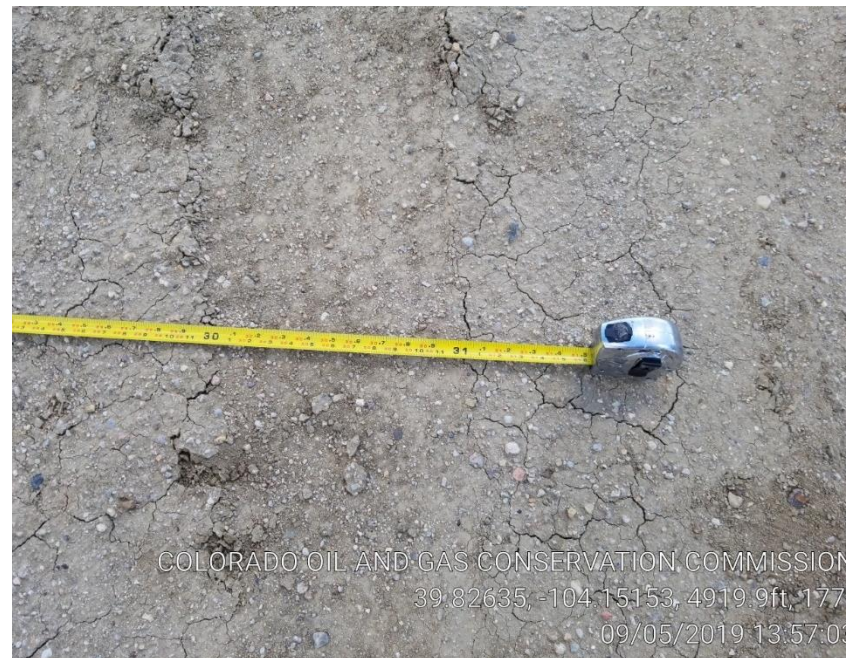
Pic 4 spill approx. 30 feet