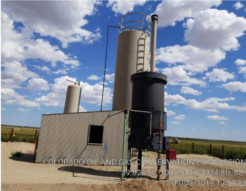
Pic 7 emission control device appears to be burning gas from producing wells coming into location, Gas meter is LOTO