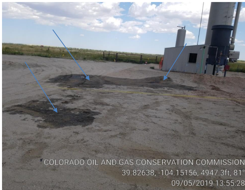
Pic 1 spill