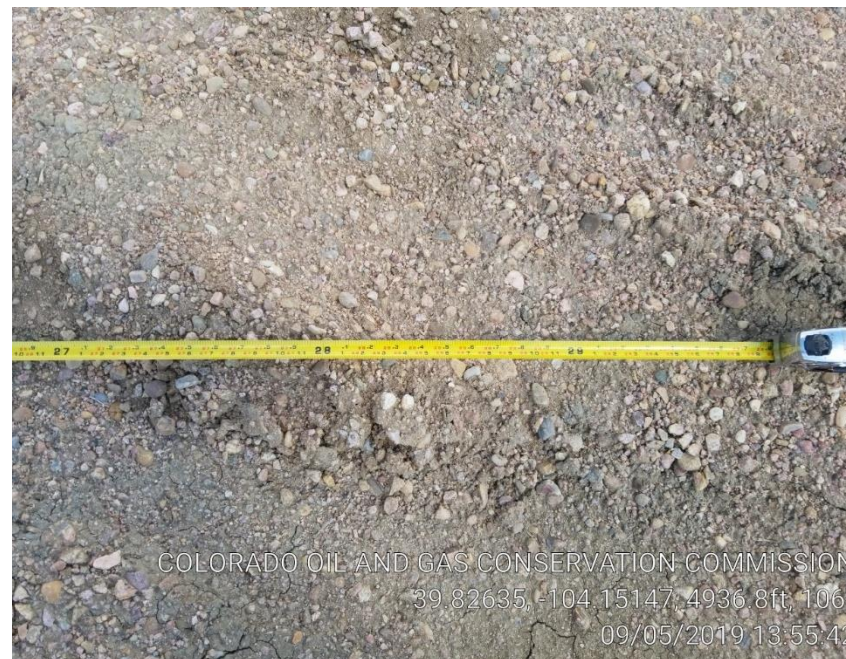
Pic 2 spill approx. 29 feet