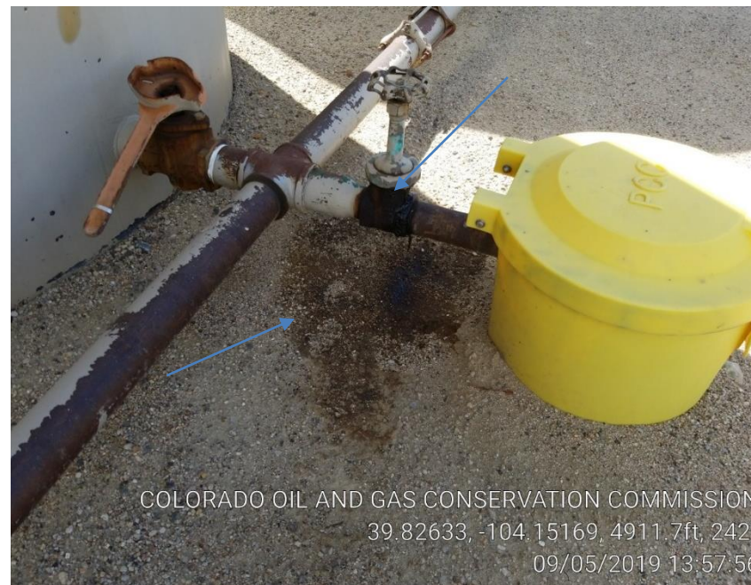
Pic 6 stained soil/mechanical conditions