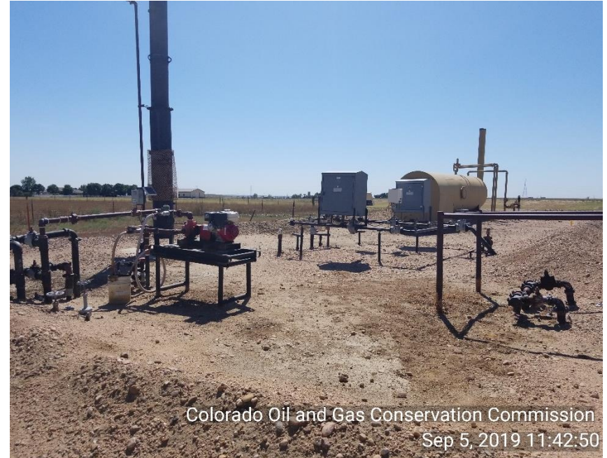
Colorado Oil and Gas Conservation Commission Sep 5, 2019 11:42:50