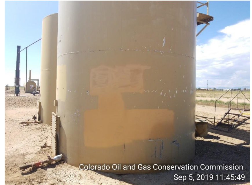
Photo 6 OUT OF SERVICE on crude oil tanks appears to have been painted over