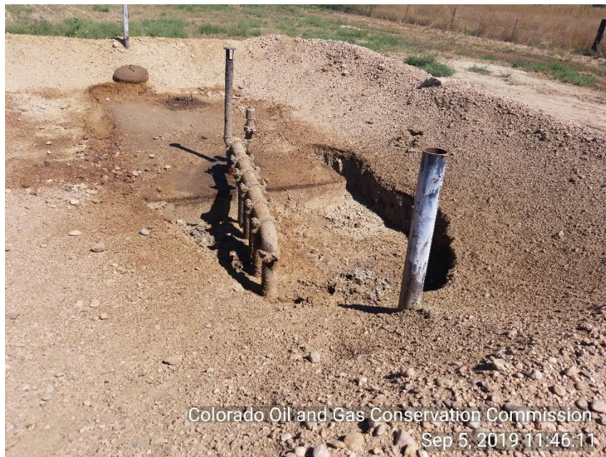
Photo 7 Produced water tank spill/ stained soil has not been addressed