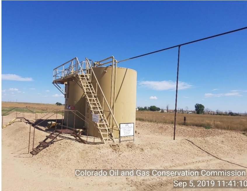
Colorado Oil and Gas Conservation Commission Sep 5, 2019 11:41:10