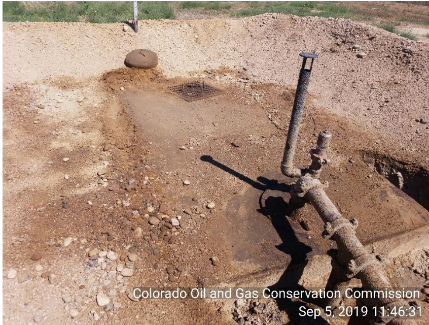
Photo 9 Produced water tank spill/ stained soil has not been addressed