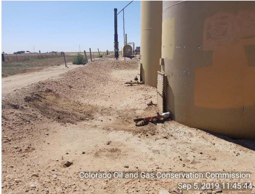
Photo 5 Stained soil appears to have been removed from crude oil tank load lines