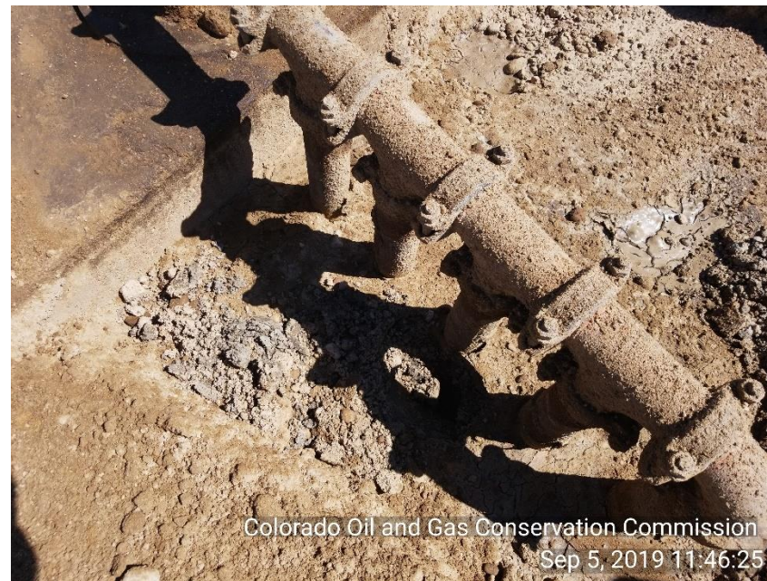
Photo 8 Produced water tank it appears crew has started to hydrovac stained soil. At time of inspection stained soil and grey material are still present.