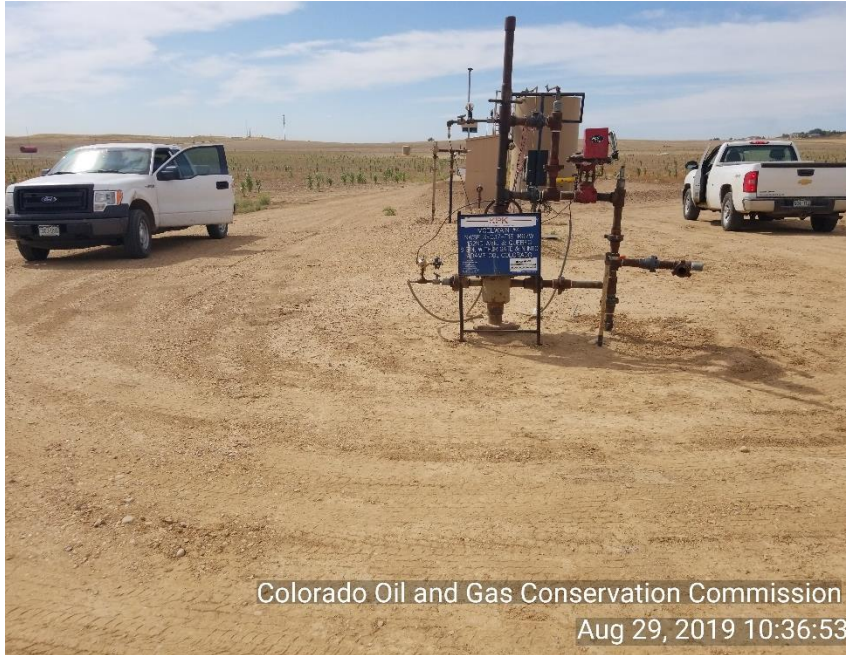
Colorado Oil and Gas Conservation Commission Aug 29, 2019 10:36:53