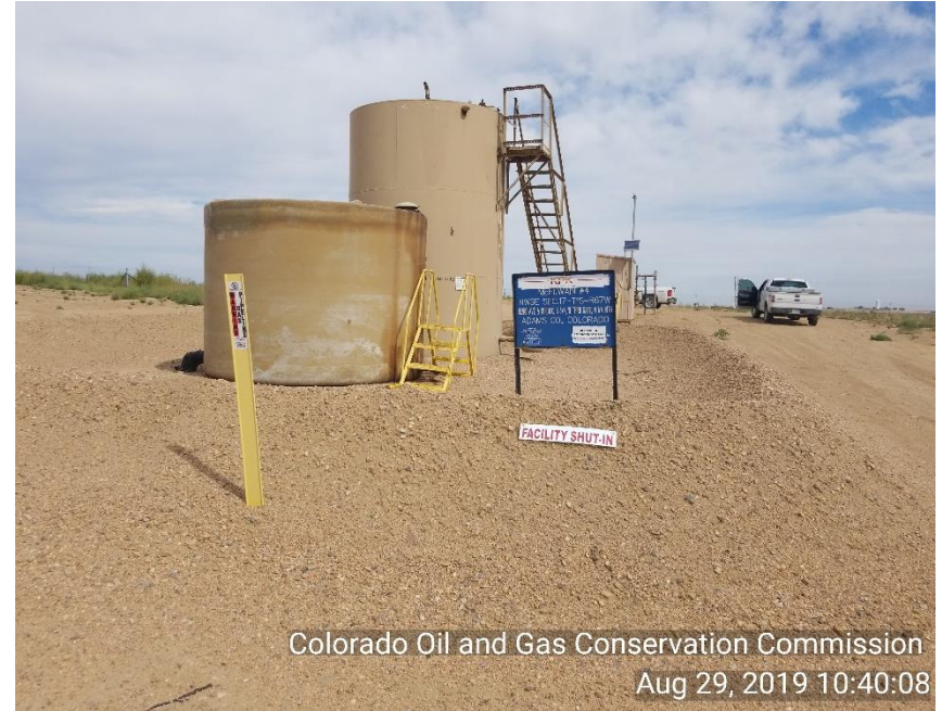
Colorado Oil and Gas Conservation Commission Aug 29, 2019 10:40:08