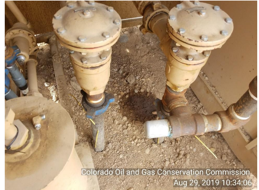
Photo 4 stained soil inside separator house and mechanical issue.