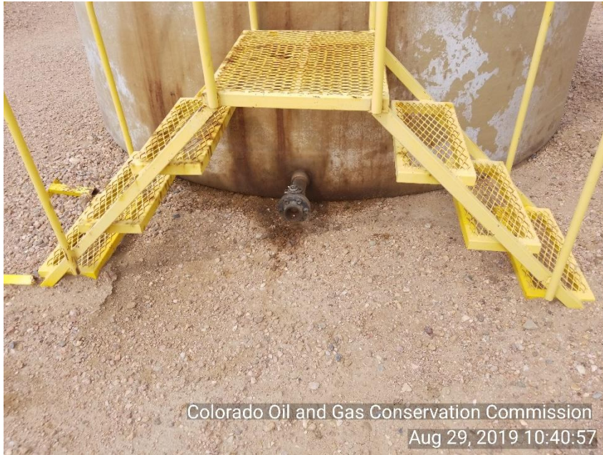
Photo 9 Stained soil around produced water tank. Mechanical issue 2" valve