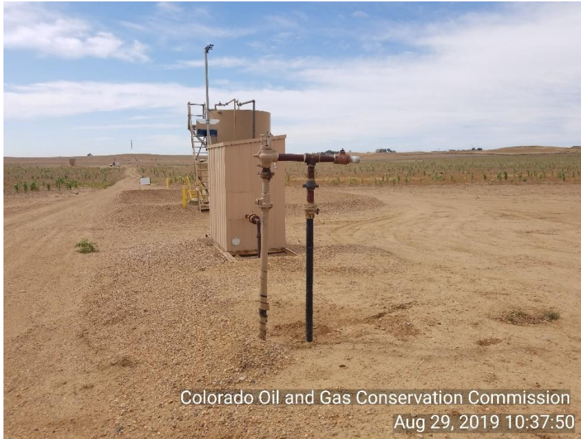
Colorado Oil and Gas Conservation Commission Aug 29, 2019 10:37:50