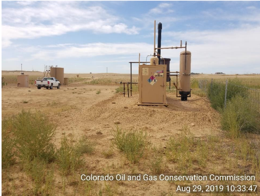
Photo 3 Separator Weeds on location