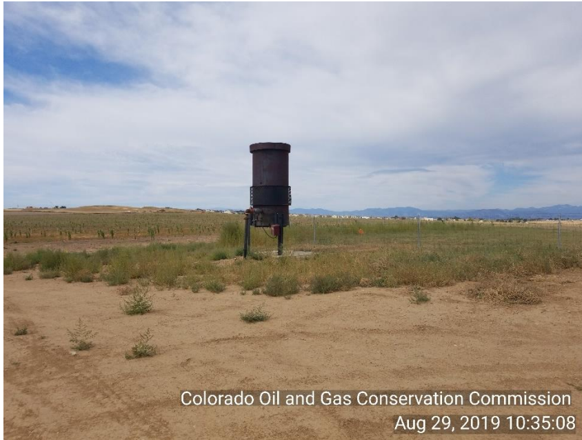
Photo 5 ECD and weeds on location