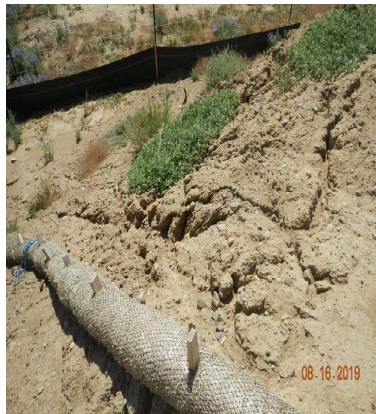
Photo#3: Slopes/ topsoil stockpile are not stabilized, resulting in erosion, sediment migration and degradation.