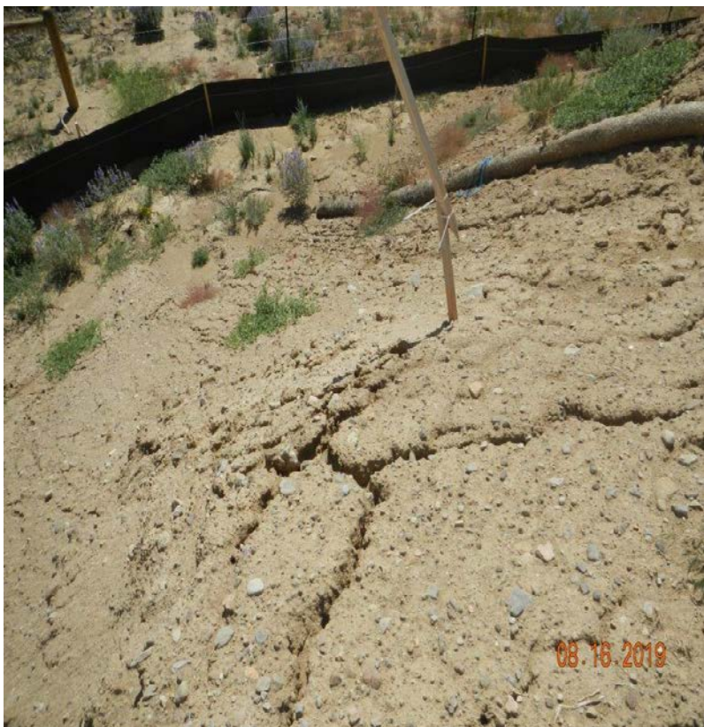
Photo#2: Slopes/ topsoil stockpile are not stabilized, resulting in erosion, sediment migration and degradation.