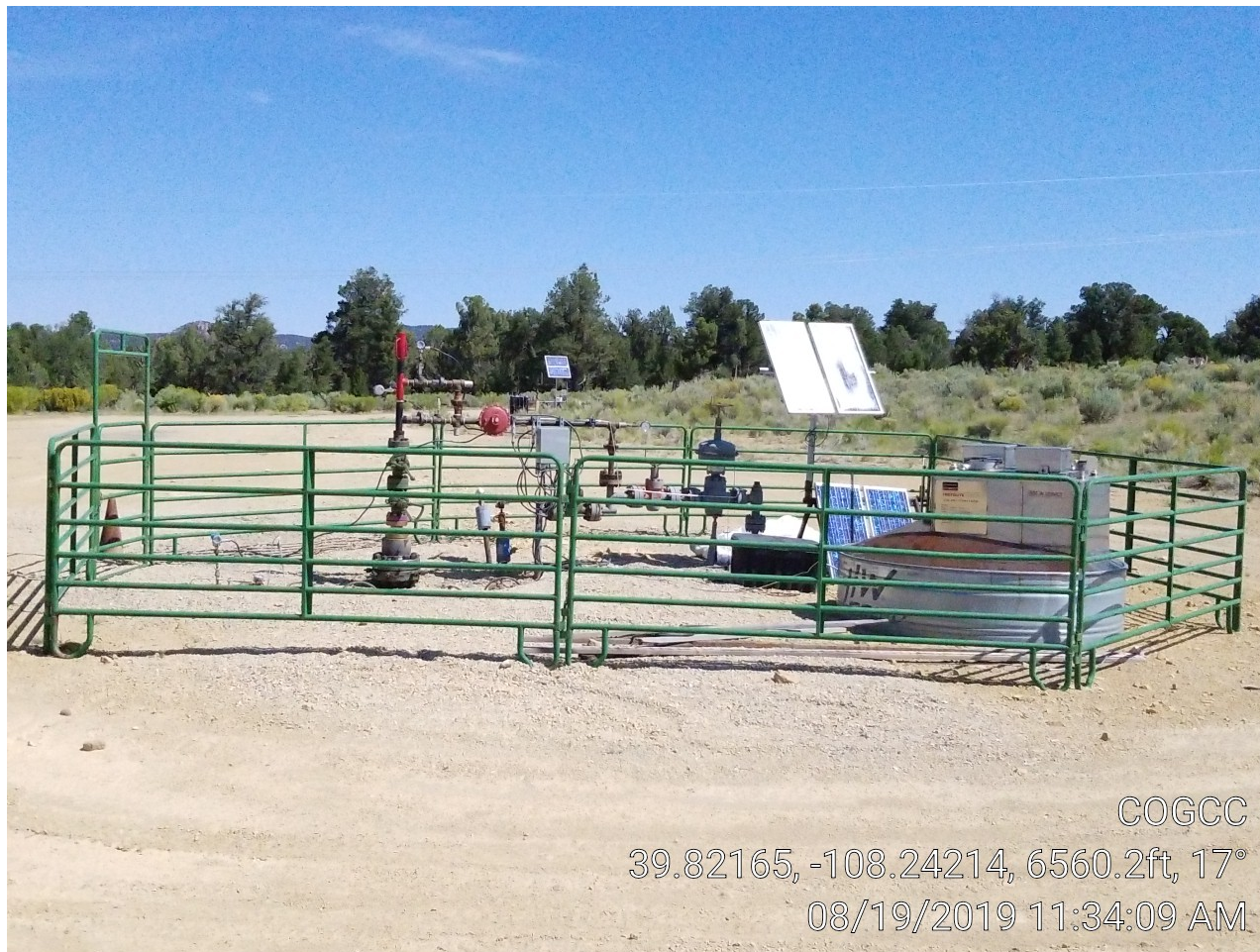
Photo 1. Location.