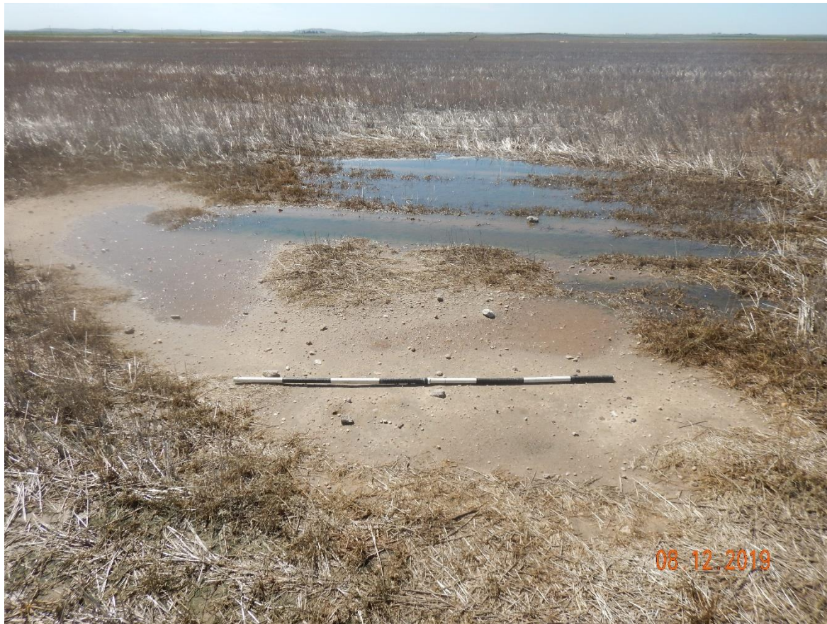
Photo 1: Photo taken from the north end of the well location, facing south. Location within cropland. Photo shows area of the well remains bare and exposed soils. Vegetation over the reclamation area is not uniform or reflective of the adjacent reference area. 2 meter robel pole for reference.