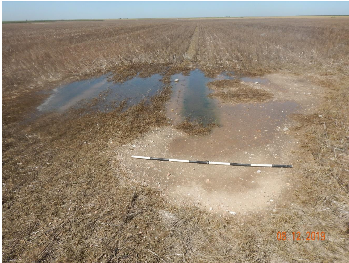
Photo 2: Photo taken from the east end of the well location, facing west. Location within cropland. Photo shows area of the well remains bare and exposed soils. Vegetation over the reclamation area is not uniform or reflective of the adjacent reference area. 2 meter robel pole for reference.