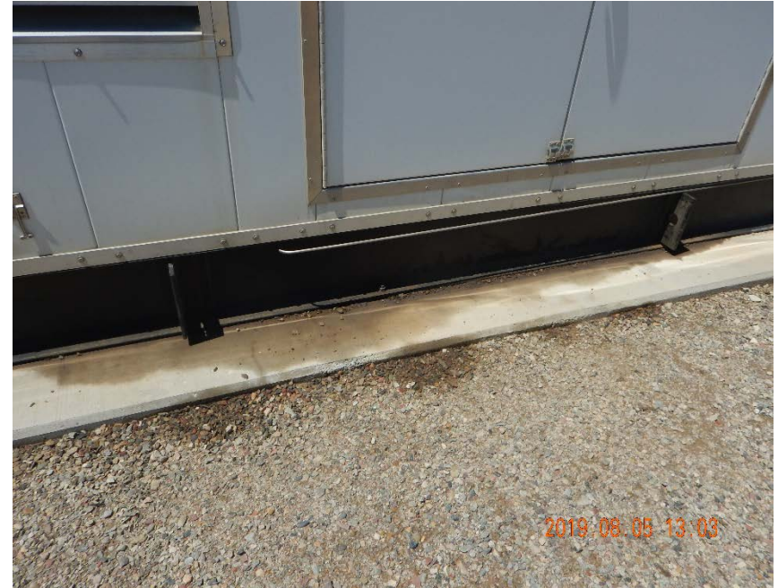
Photo #14 – Localized accumulations of stained gravel and possible staining observed on top of east side of concrete pad beneath compressor shed located north of Cascade Creek #616-21-32 (API #045-10444) well.