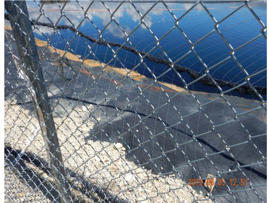
Photo #4 – De minimis accumulations of road base on pit liner in SW corner of pit.