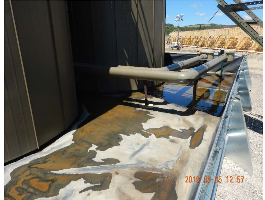
Photo #12 – Localized accumulation of fluids along east side of tank battery.