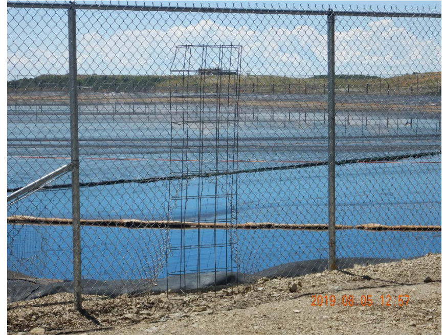
Photo #10 – Inlet in NE corner of pit has been removed and fence has been patched by operator.