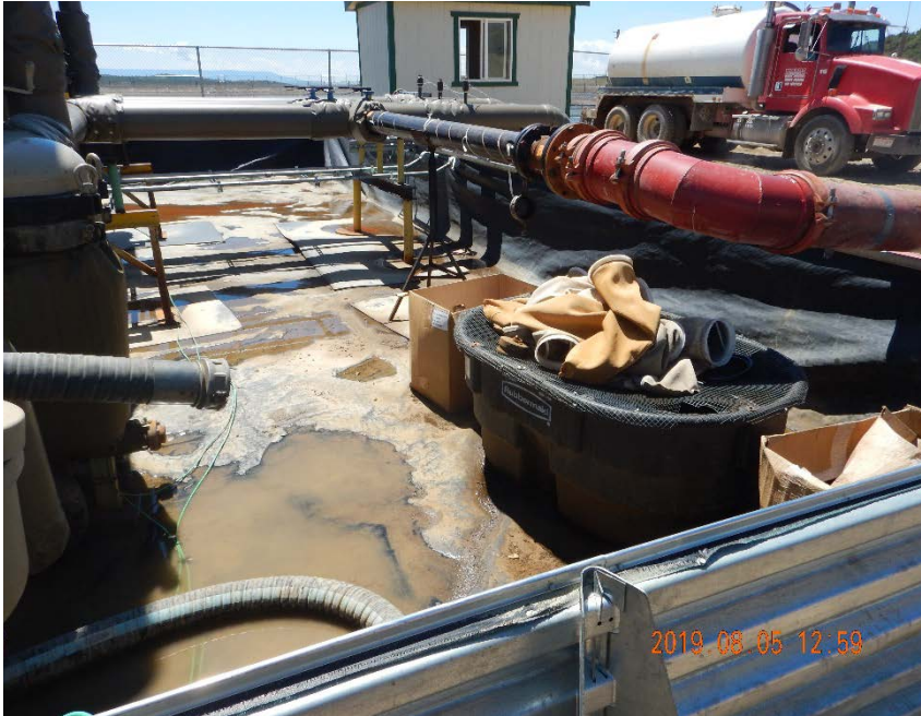
Photo #13 – Localized accumulation of fluids along west side of tank battery. Note wildlife mesh has been installed over filter sock tub in response to previous FIR.