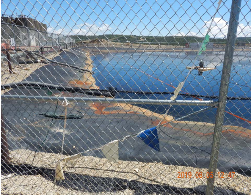
Photo #1 – View of north side of Pit Facility ID #414402 (Pond G) from NW corner.