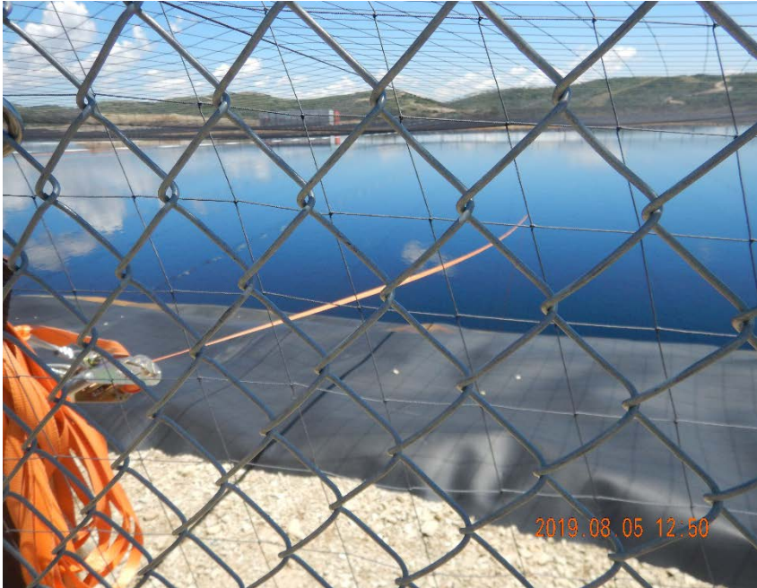
Photo #3 – Orange ratchet strap sagging into pit fluids, view from west side of pit.