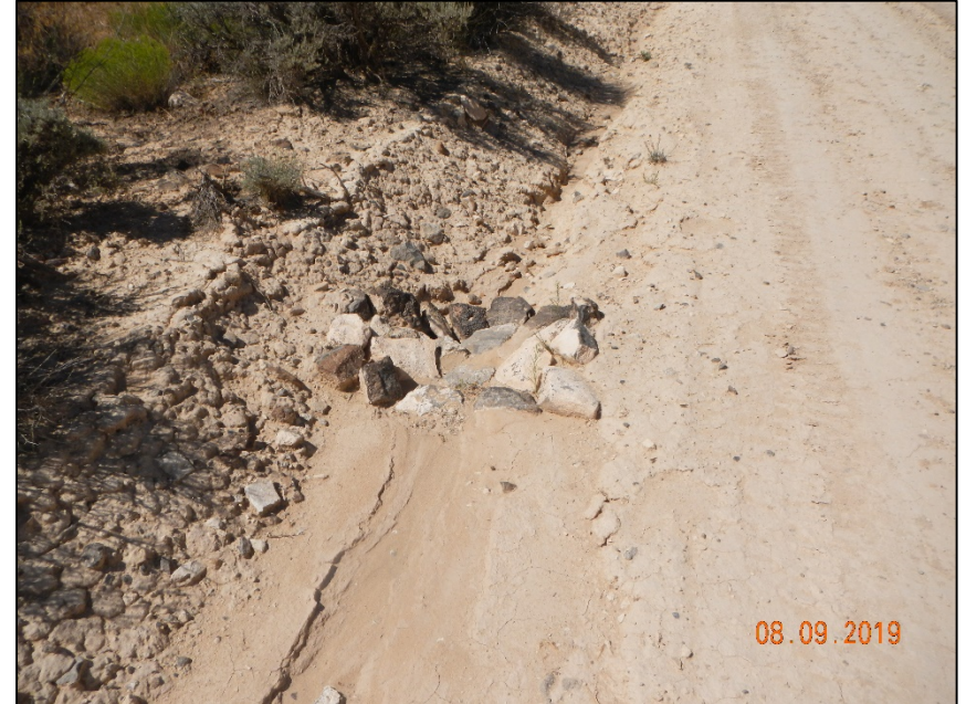
Photo #7 Erosion sediment moving down access road. BMP's need maintenance.