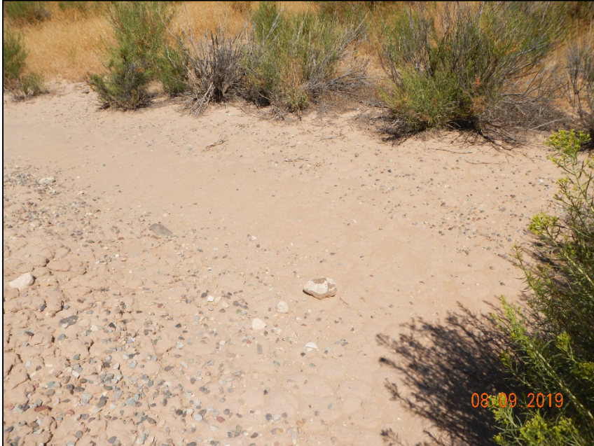
Photo #10. Erosion moving sediment off location by the Separator and tank battery. Sediment is choking out vegetation. No BMP's in place at time of inspection.