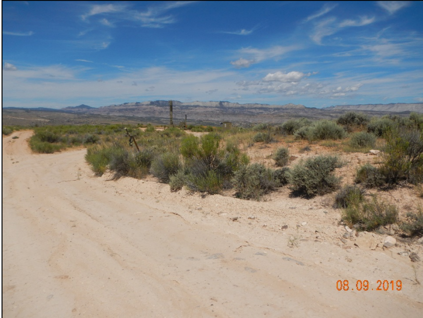
Photo #8 Erosion sediment moving down access road at entrance to location. BMP's need maintenance or are not in place.