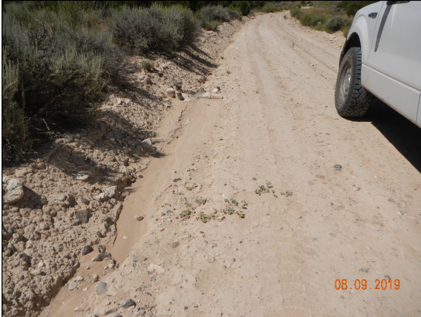
Photo #6 Erosion sediment moving down access road. BMP's need maintenance.