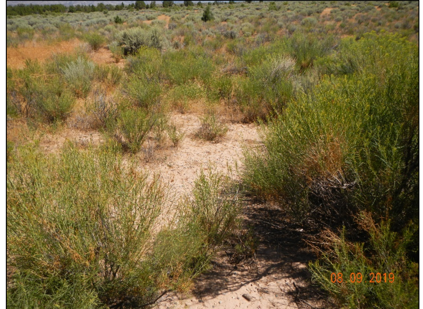
Photo #11. Erosion moving sediment off location by the Separator and tank battery. Sediment is choking out vegetation. No BMP's in place at time of inspection.