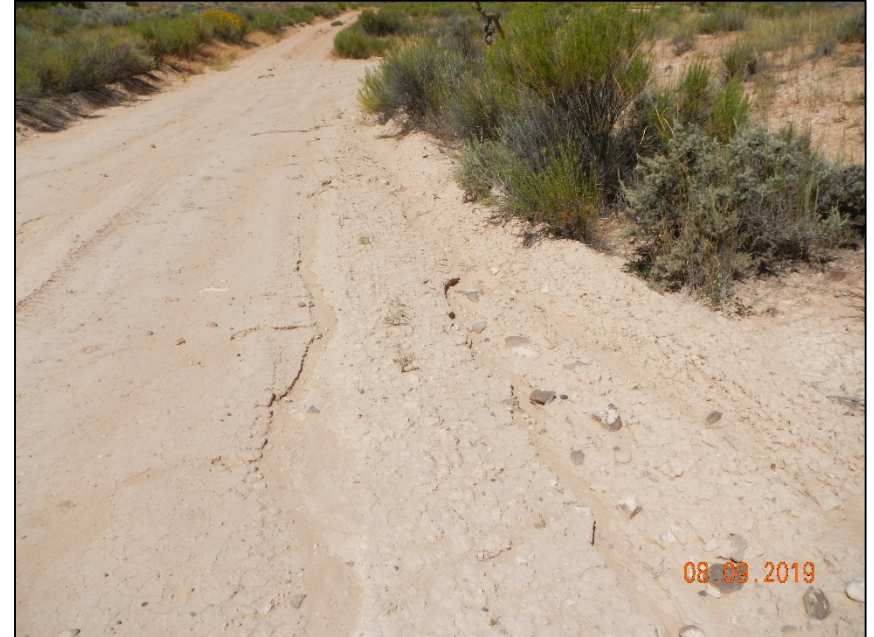
Photo #9 Erosion sediment moving down access road at entrance . BMP's need maintenance or are not in place.