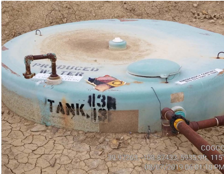
Photo 2. Tank.