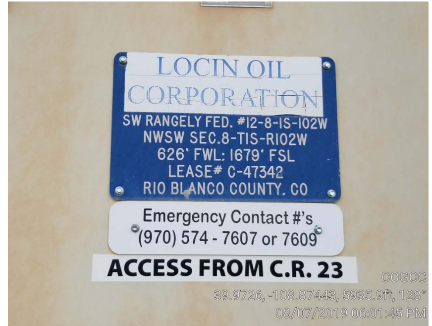
Photo 3. Battery sign.