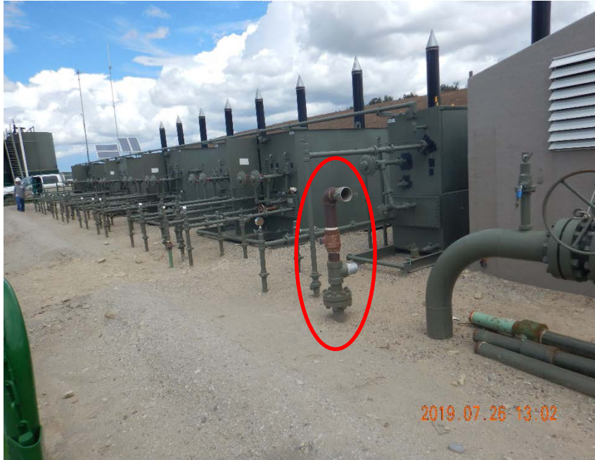
Photo #15 – Unused, unmarked, and uncapped flowline riser located at south end of separators.