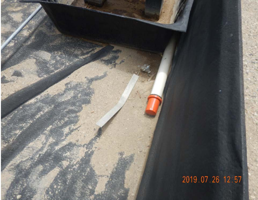
Photo #5 – Metal scrap and unused equipment stored inside of lined secondary containment area (southwest corner).