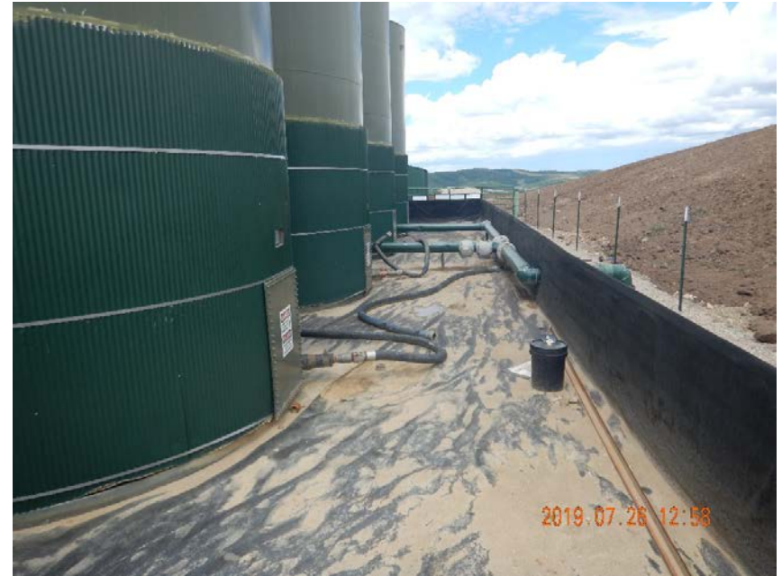
Photo #6 – Angle iron and hoses with metal fittings stored inside of lined secondary containment area (east side).