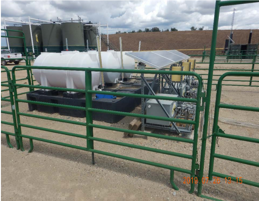
Photo #23 – Day tanks inside of secondary containment on north side of fenced wellhead area.