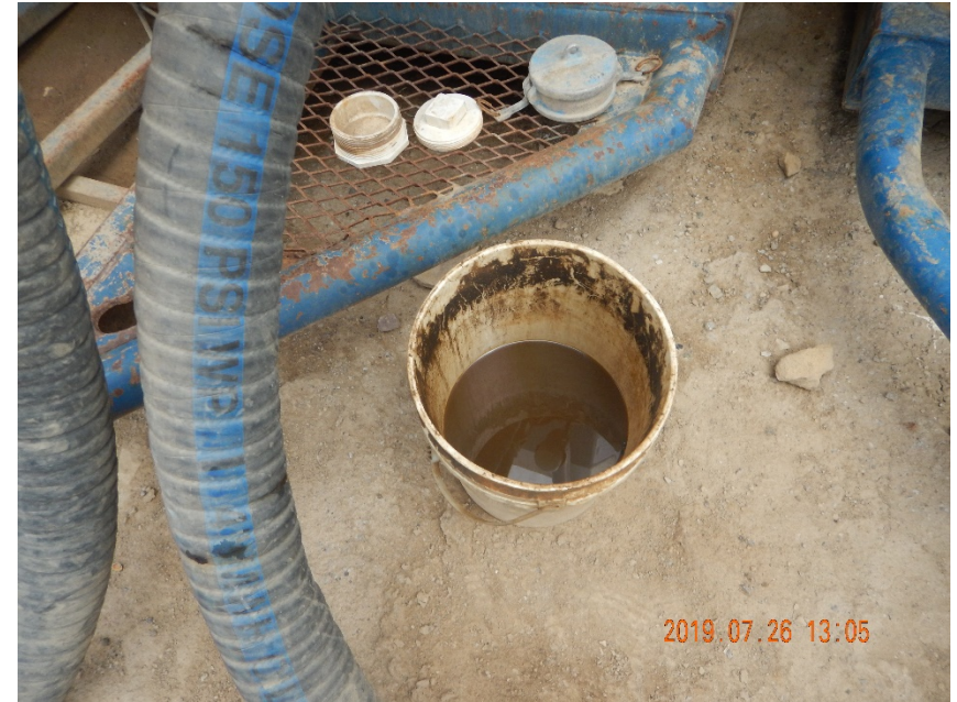
Photo #20 – Bucket of unidentified fluid stored on west side of frac tanks.