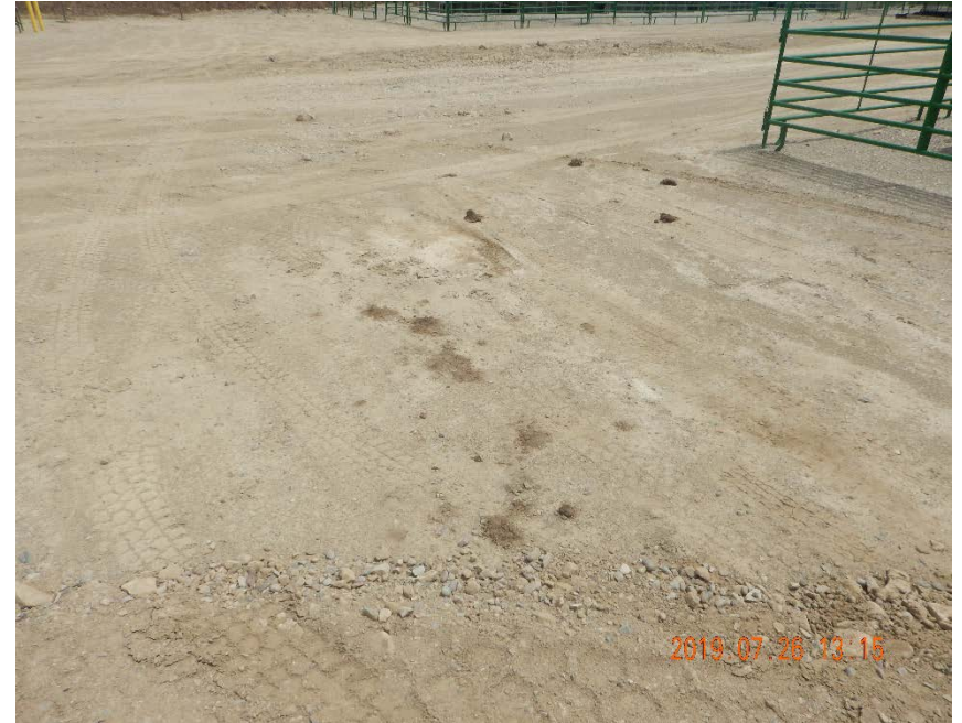
Photo #24 – Localized accumulations of oil-stained soil north of fenced wellhead area.