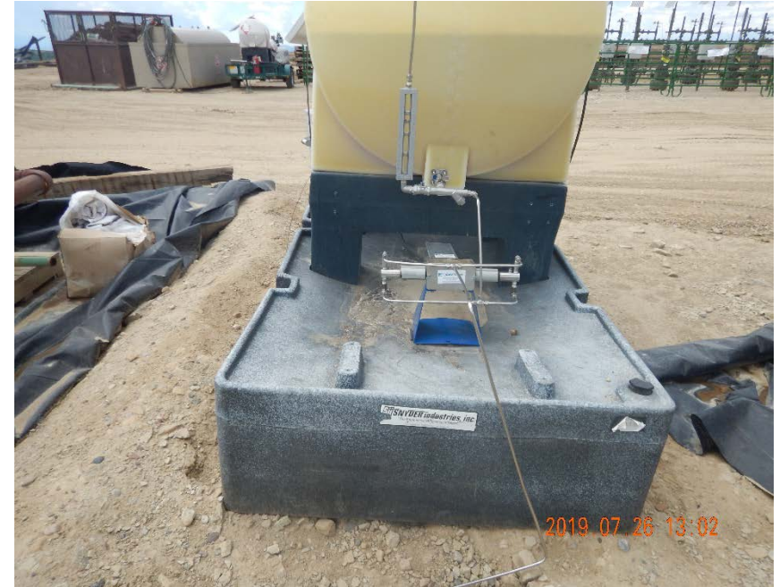
Photo #12 – Day tank with process piping located west of separators.