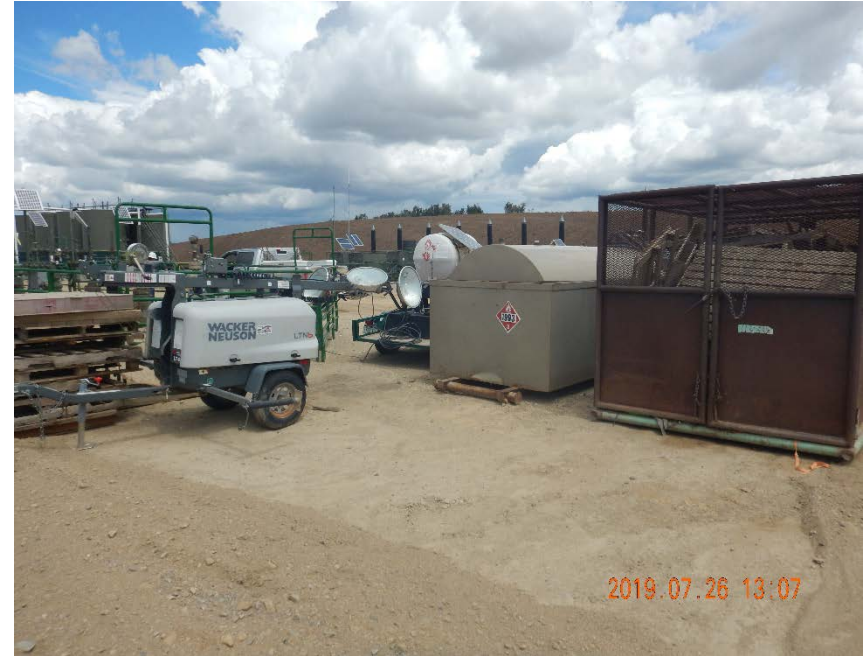
Photo #22 – Additional ancillary equipment (day tank, diesel AST, trash container) located south of wellhead area.