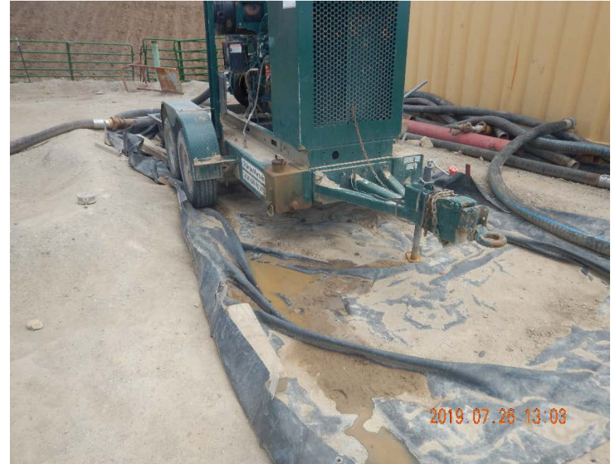
Photo #14 – Pump on top of liner. Note pump wheels and hitch jack directly on liner may cause damage due to vibration.