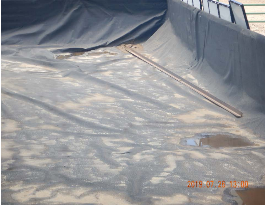
Photo #9 – Angle iron stored inside of lined secondary containment area (northwest corner).