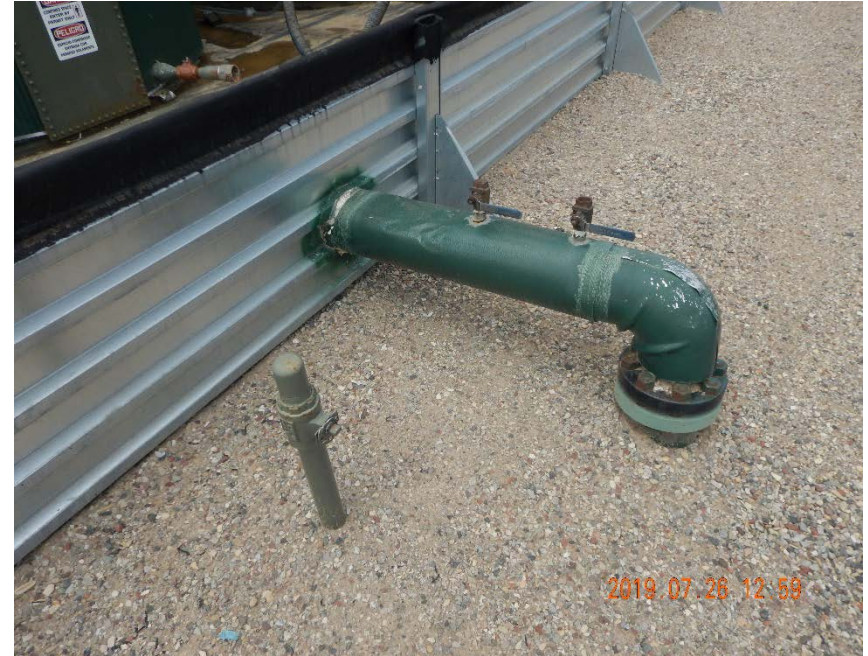
Photo #8 – Unmarked, unused 2" flowline riser east of tank battery.