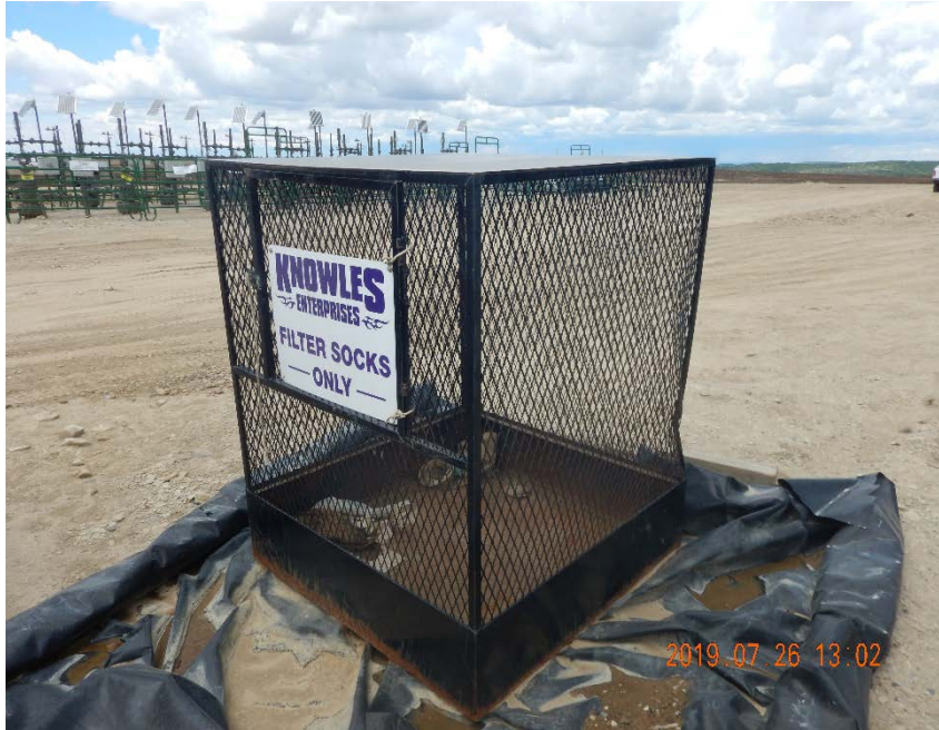
Photo #11 – Filter sock containment device on top of liner, located west of separators.