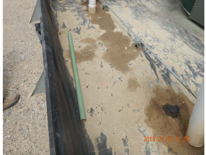
Photo #4 – Metal pipe stored inside of lined secondary containment area (west side).