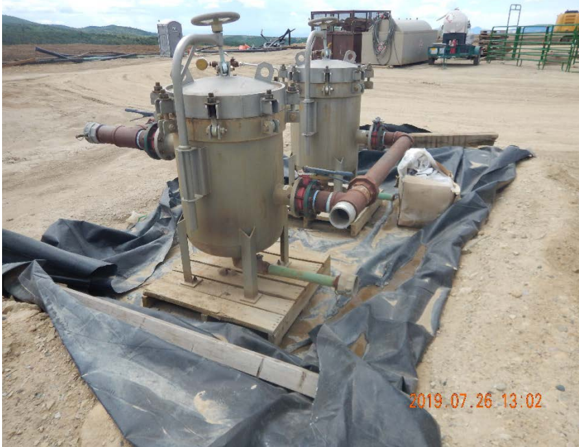
Photo #13 – Filter pots on top of liner, located west of separators.