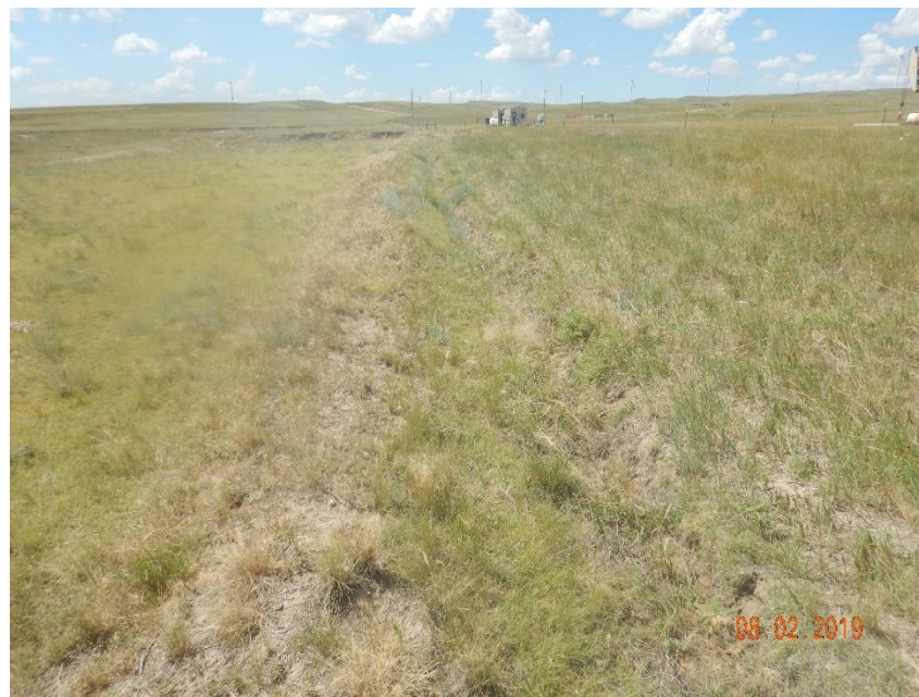
Photo 4: Photo taken from the south end of the location, facing west. Photo shows the perimeter stormwater ditch during initial construction activities remaining. Vegetation over interim areas appear to have sufficiently stabilized the soils; Original perimeter stormwater ditch, sediment traps, BMPs etc... no longer appear to be necessary and require reclamation.