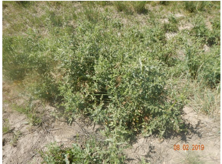
Photo 6: Photo shows Canada thistle establishing on sediment trap/ditch. This is a Colorado State listed noxious weed and requires management.

Photo also shows Canada thistle establishing on sediment trap/ditch. This is a Colorado State listed noxious weed and requires management.