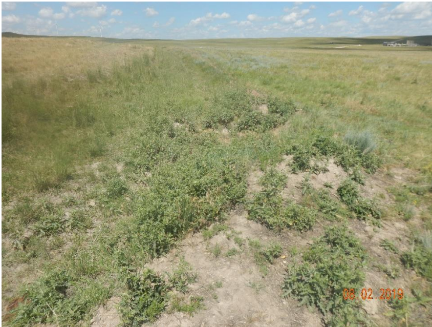
Photo 5: Photo taken from the south east end of the location, facing north. Photo shows the perimeter stormwater ditch and sediment trap during initial construction activities remaining. Vegetation over interim areas appear to have sufficiently stabilized the soils; Original perimeter stormwater ditch, sediment traps, BMPs etc... no longer appear to be necessary and require reclamation.

Photo also shows Canada thistle establishing on sediment trap/ditch. This is a Colorado State listed noxious weed and requires management.