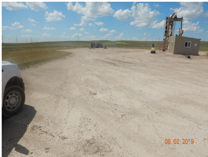
Photo 1: Photo taken from the south end of the location, facing west. Photos 1-3 provide an overview of the location from west, northwest, to northeast. Photos show active wells remaining on location. Photos also show that only the areas of the access road, and immediate areas surrounding the wells appear to have been stabilized. Photo shows large areas that remain unstabilized where stormwater ponding outside of the perimeter ditch is evident.